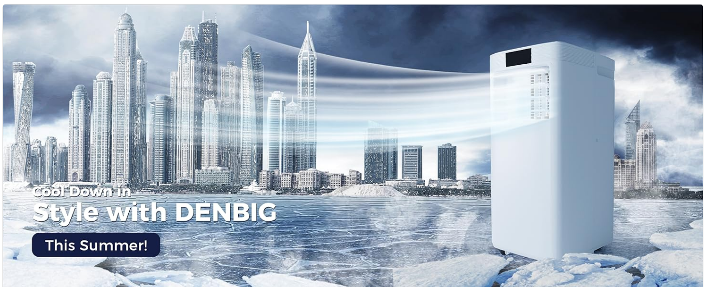
Image: Visual representation of the 3-in-1 operation system: Cool, Fan, and Dry (Dehumidify) modes.