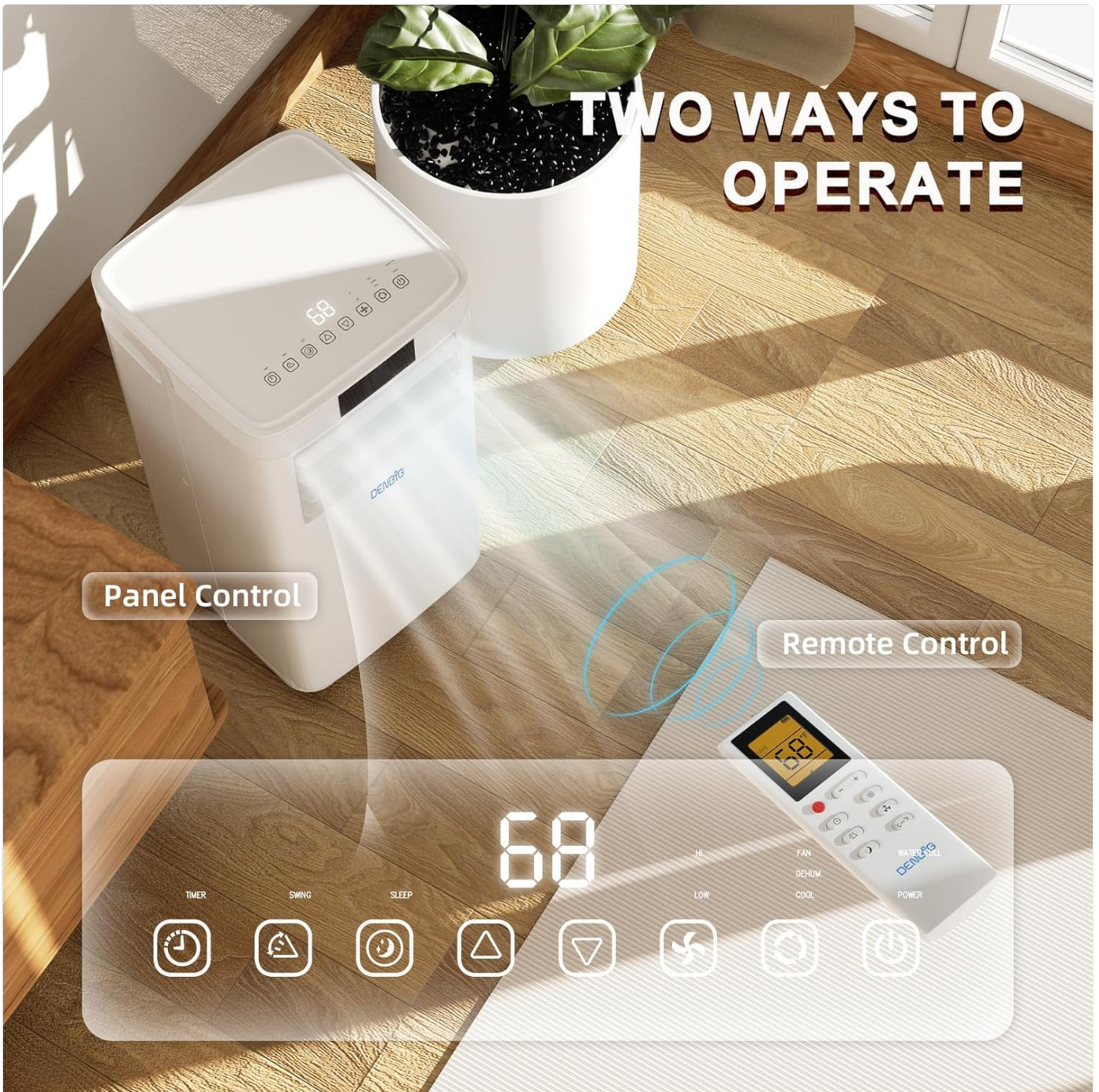
Image: The unit's top control panel and the remote control, demonstrating the dual operation methods.