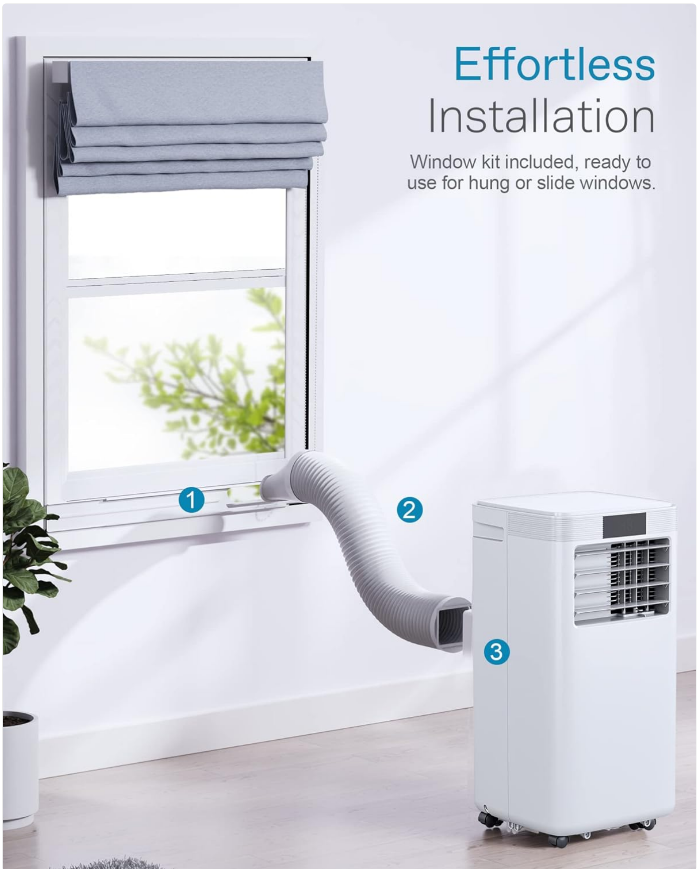
Image: The portable AC unit set up with the exhaust hose connected to a window, demonstrating the ease of installation.

Window kit included, ready to use for hung or slide windows.