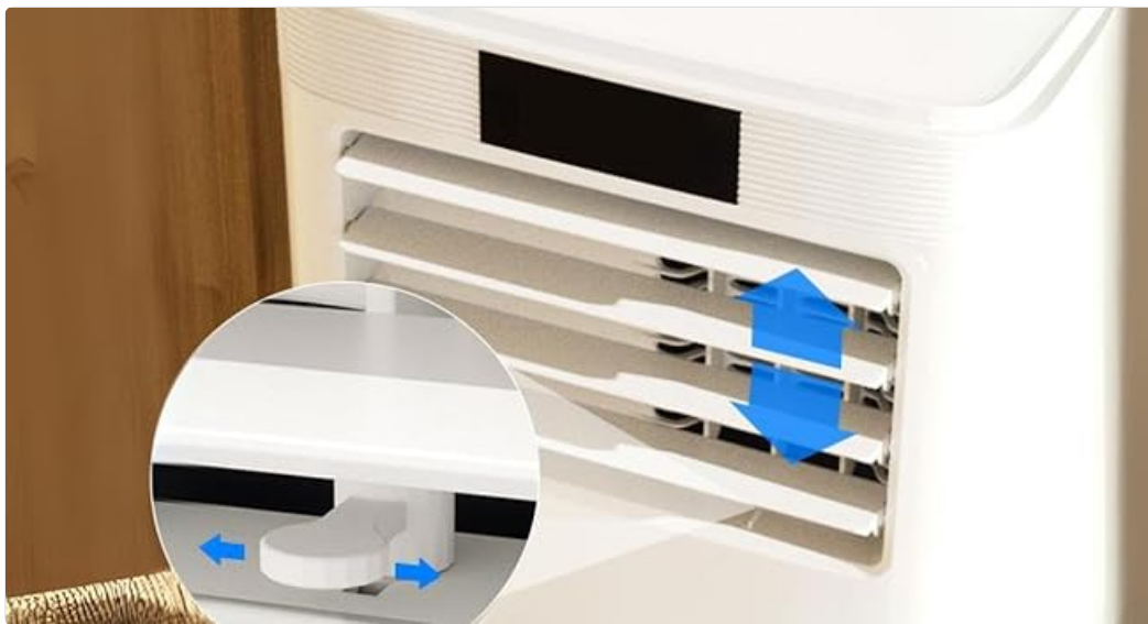
Image: A close-up view of the unit's adjustable louvers, indicating how to control airflow direction.

Adjust the horizontal and vertical louvers to direct airflow as desired.