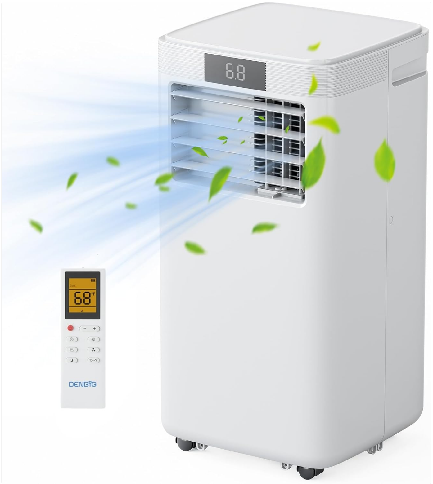
Image: The DENBIG Portable Air Conditioner unit with its remote control, illustrating the cool air output.