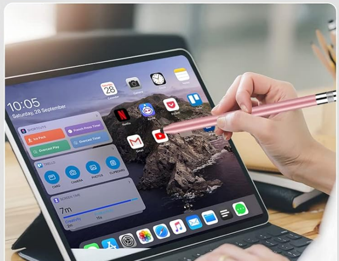
Clicking small icon