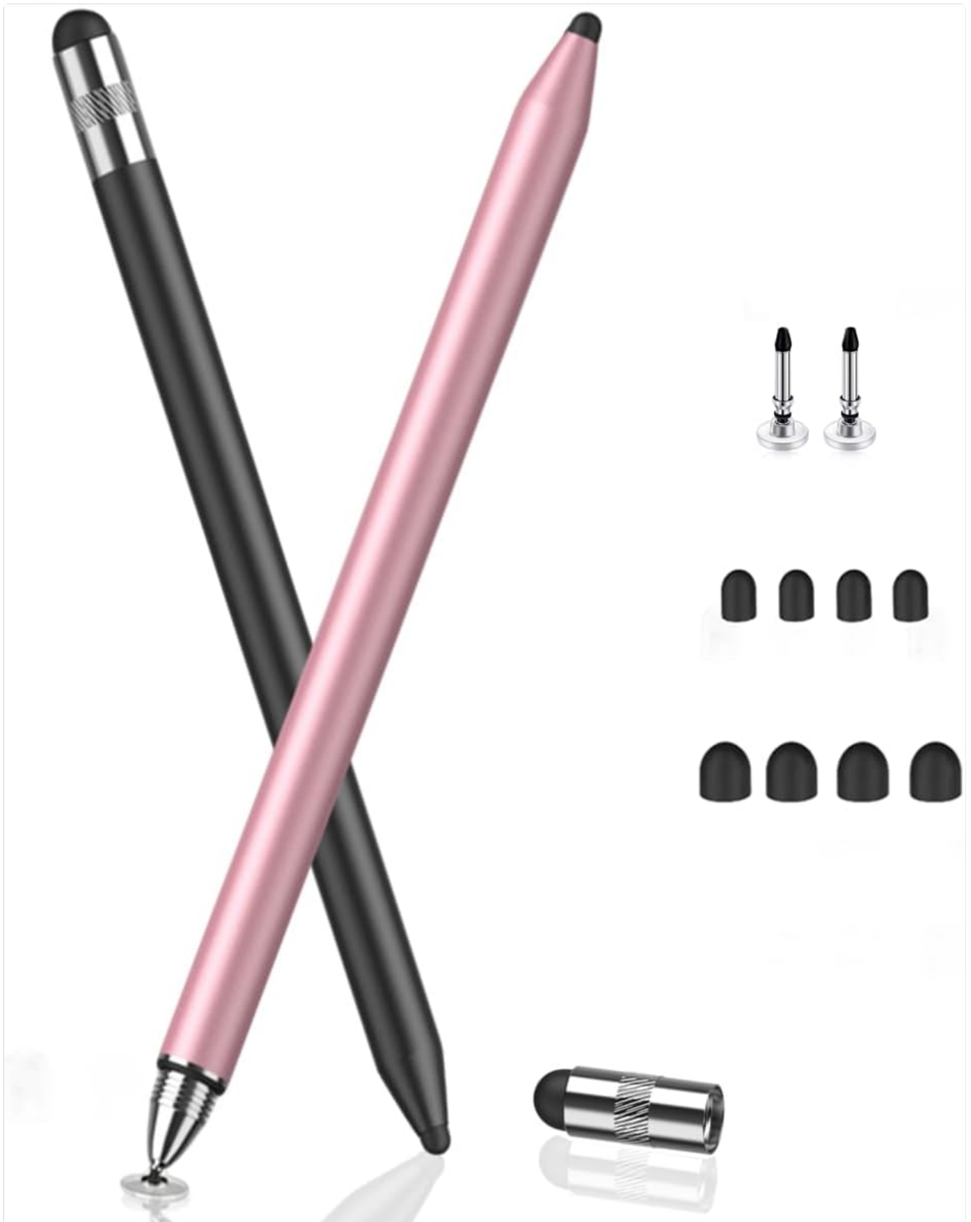
Figure 1: MEKO 3-in-1 Stylus Pens with included accessories.