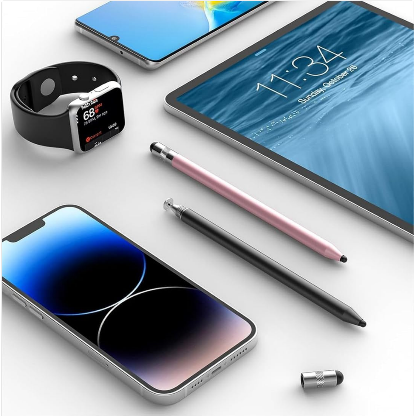
Figure 5: Instructions for replacing stylus tips.