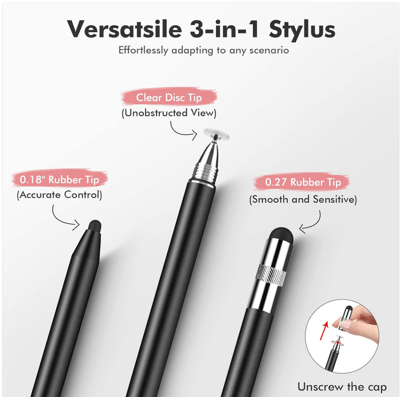
Figure 2: Detailed view of the versatile 3-in-1 stylus tips.