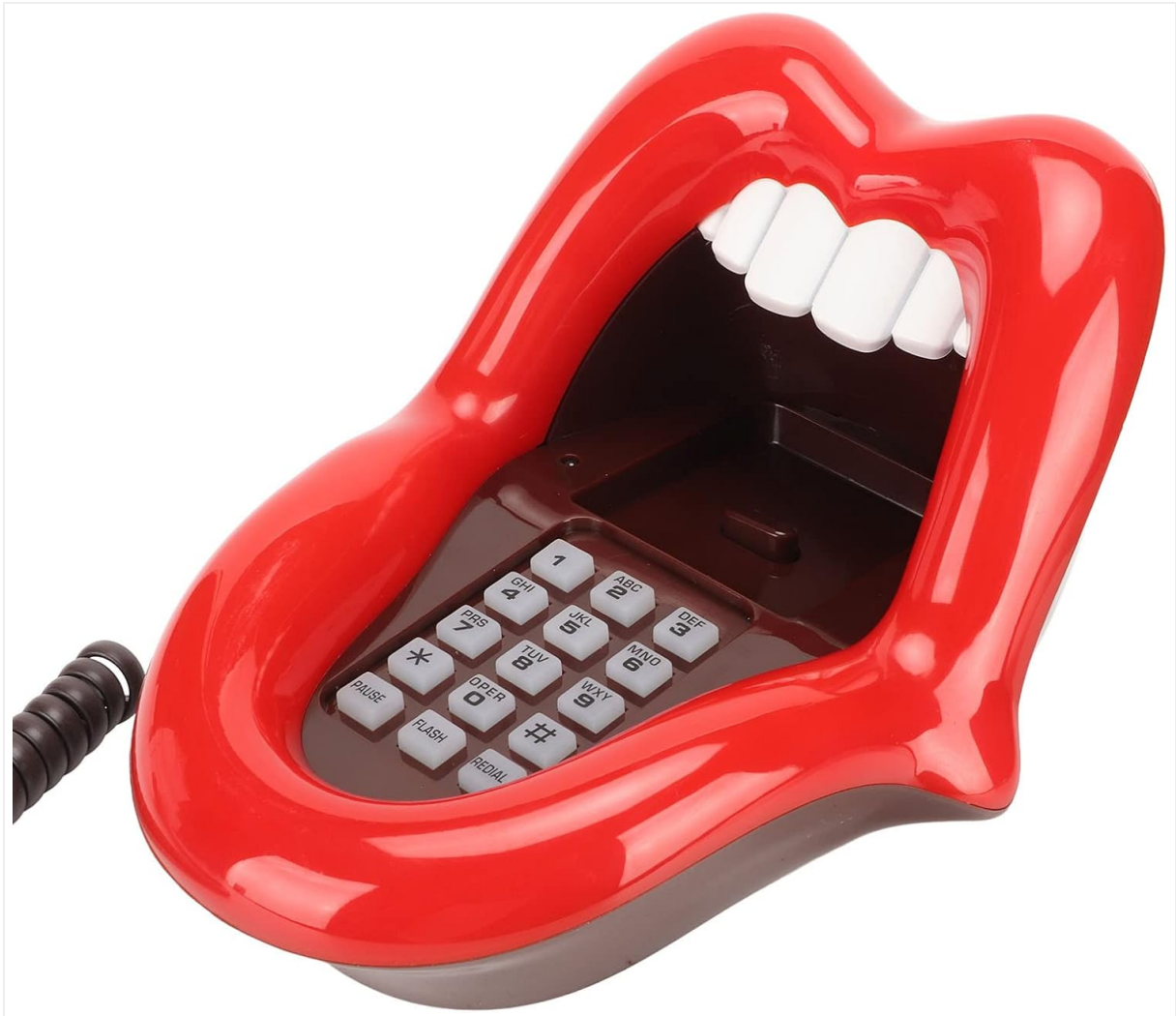
Image: Close-up of the telephone keypad, showing number buttons and function buttons like PAUSE, FLASH, and REDIAL.