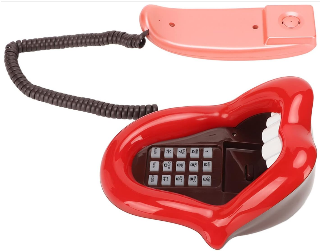
Image: Top view of the Zyyini telephone, showing the keypad and the connection point for the handset's coiled cord.