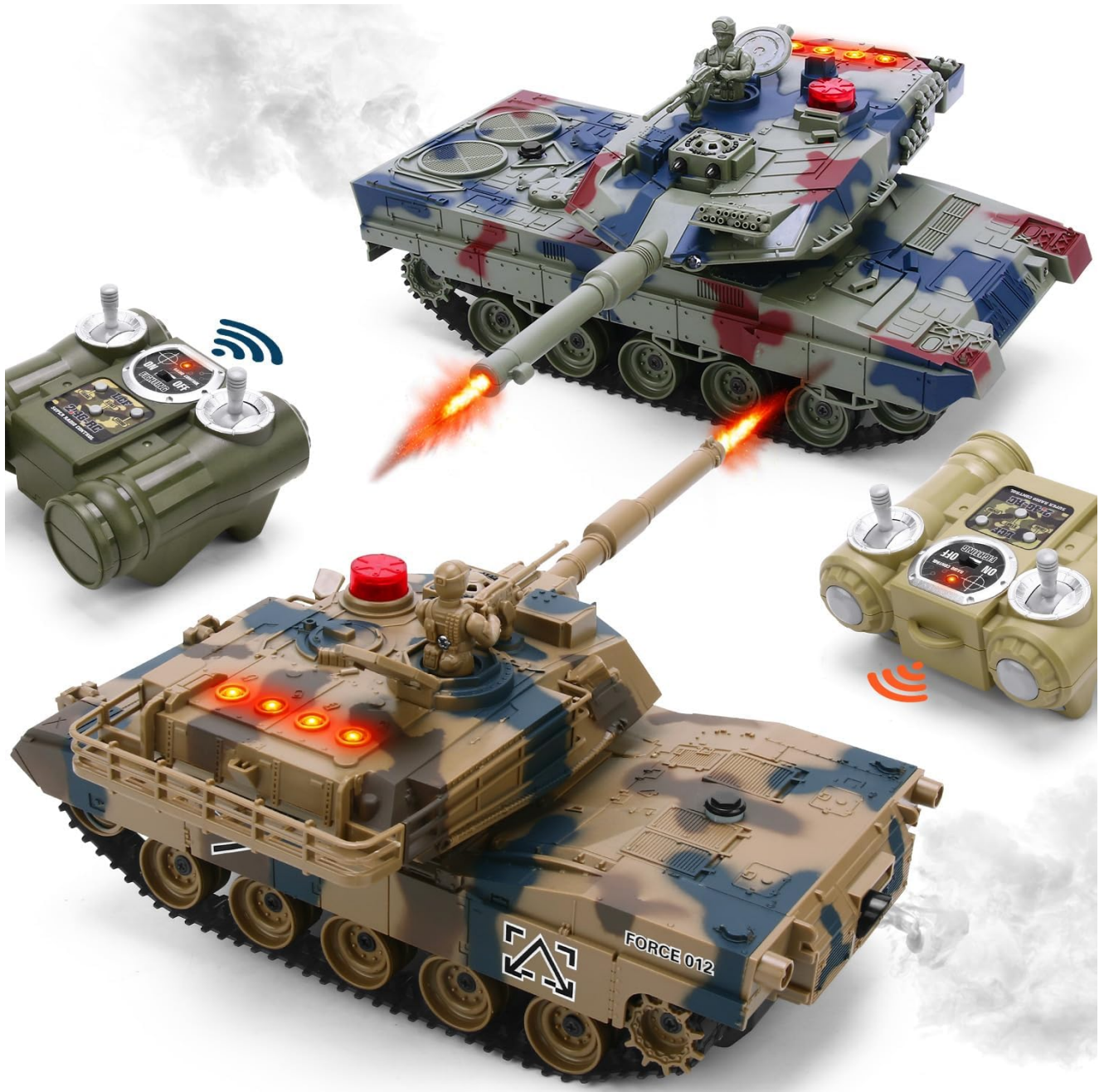
Image: The RO GALALY RC Tank Set, featuring two tanks and their remote controls, demonstrating the spray and firing effects.