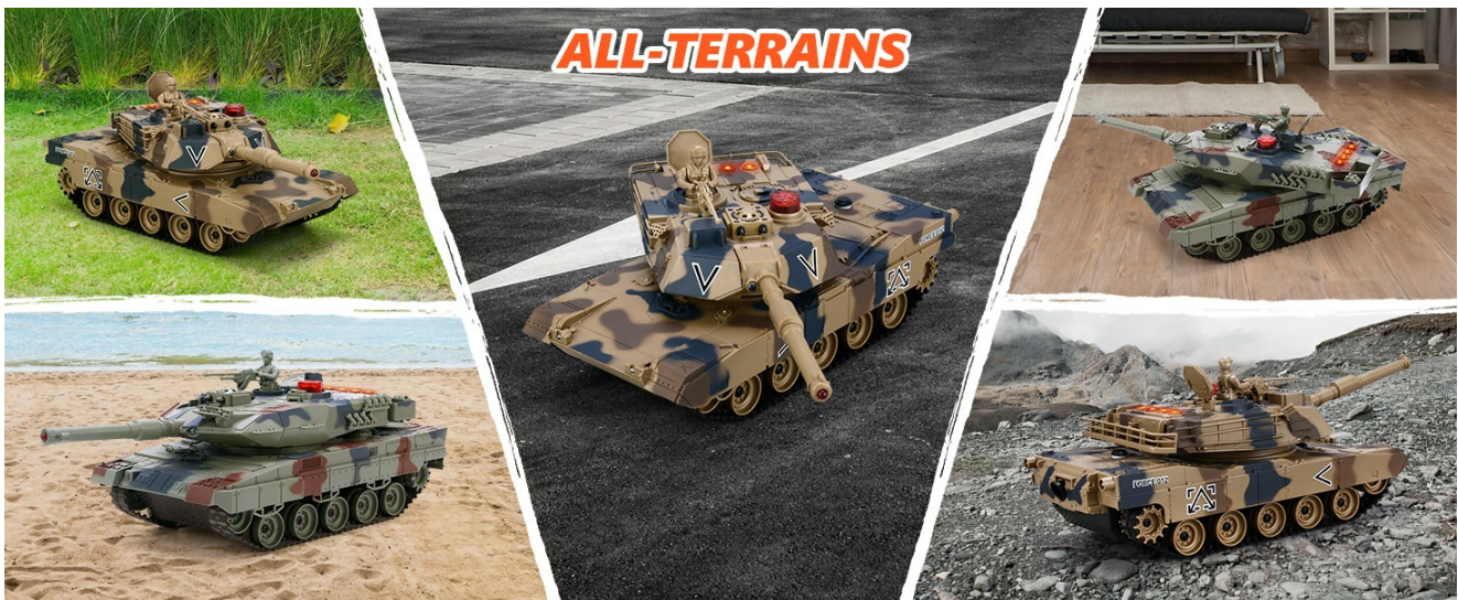
Image: The RC tanks demonstrating their ability to traverse various terrains including sand, lawn, indoor surfaces, and climb inclines.