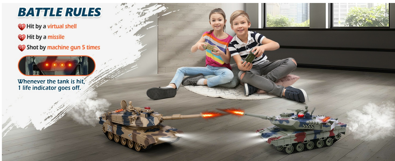
Image: Children engaging in a tank battle, illustrating the life indicator system and battle rules.