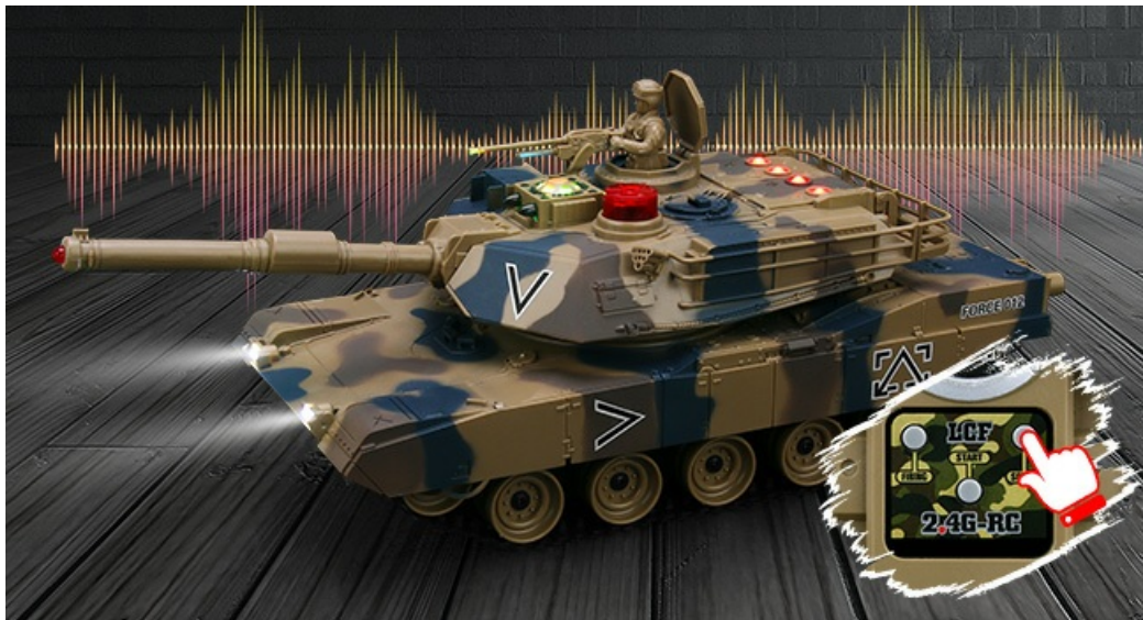
Image: Tank with active LED lights and sound effects, highlighting the sound control on the remote.