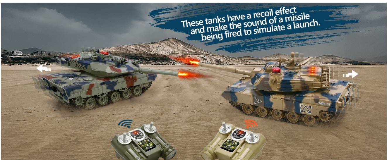
Image: Demonstrating the tank's 360-degree rotation, 330-degree turret rotation, and 30-degree manual barrel adjustment.