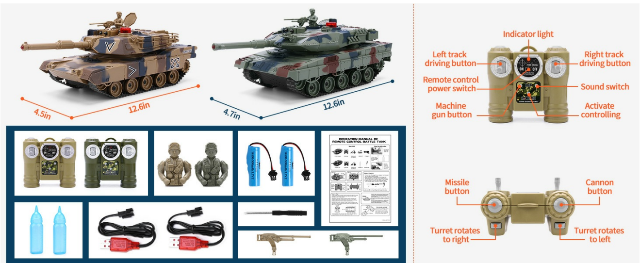
Image: Tank dimensions and remote control button layout for operation.