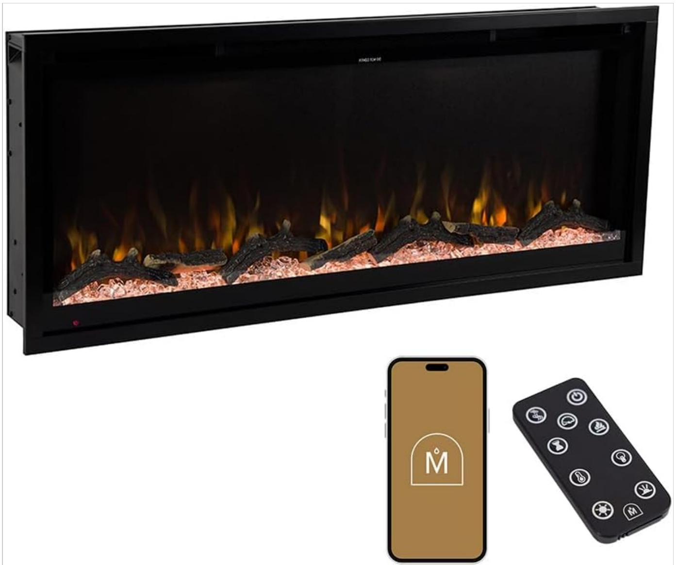
Figure 3.4: The fireplace with the media kit installed, showcasing the flame effects.