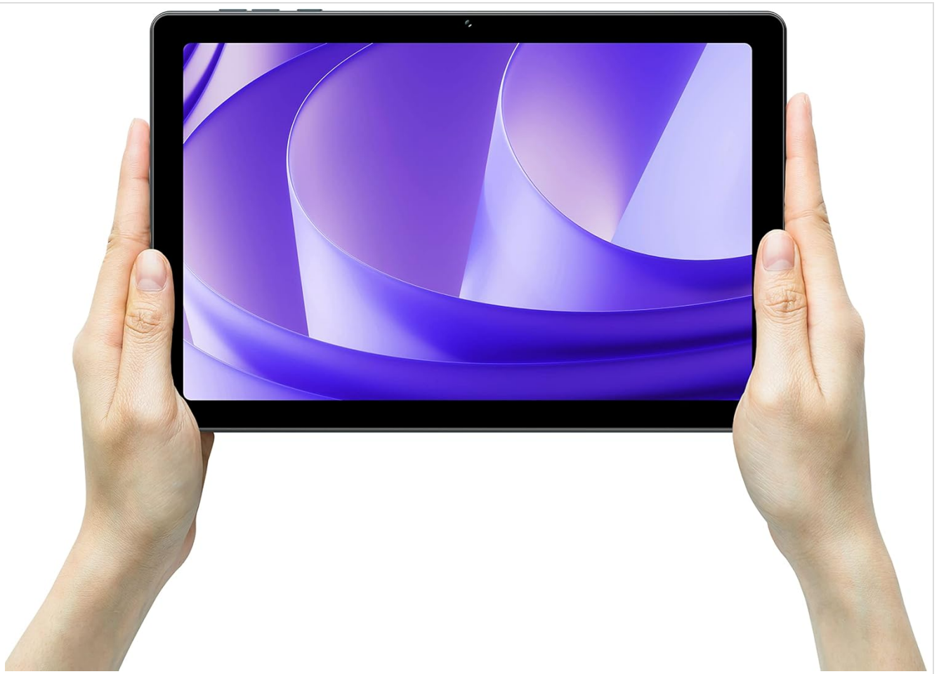
The BLU M10L Plus tablet being held horizontally, demonstrating its 10.1-inch display in use.