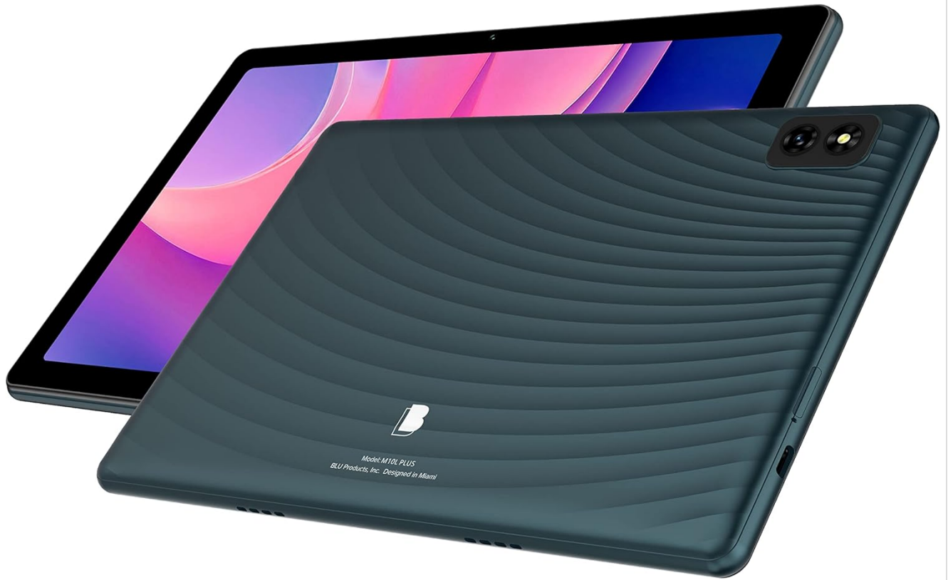
Rear view of the BLU M10L Plus tablet, showing the camera module and textured back.