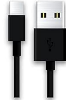
TYPE C CABLE