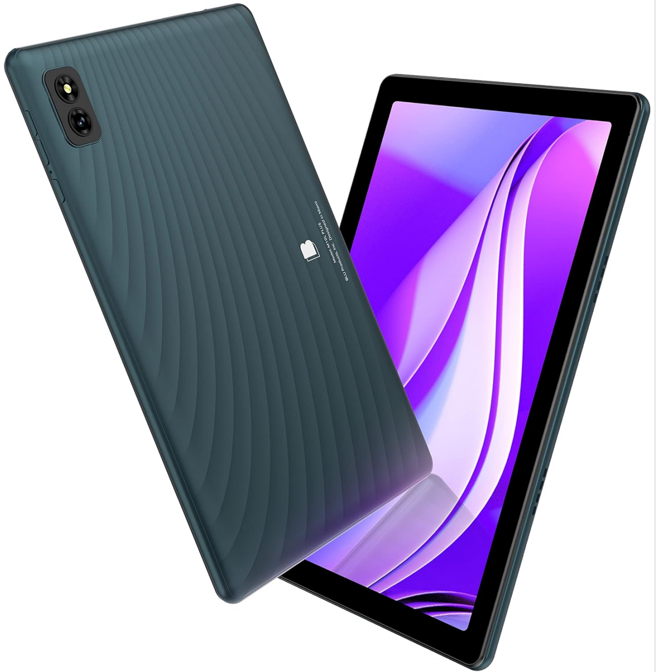
Side view of the BLU M10L Plus tablet, illustrating port locations and button placement.