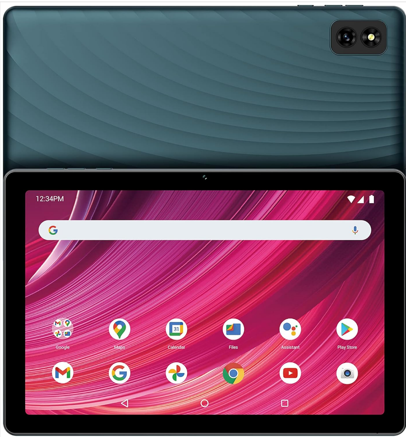
Front and back view of the BLU M10L Plus tablet, showcasing its display and rear camera.