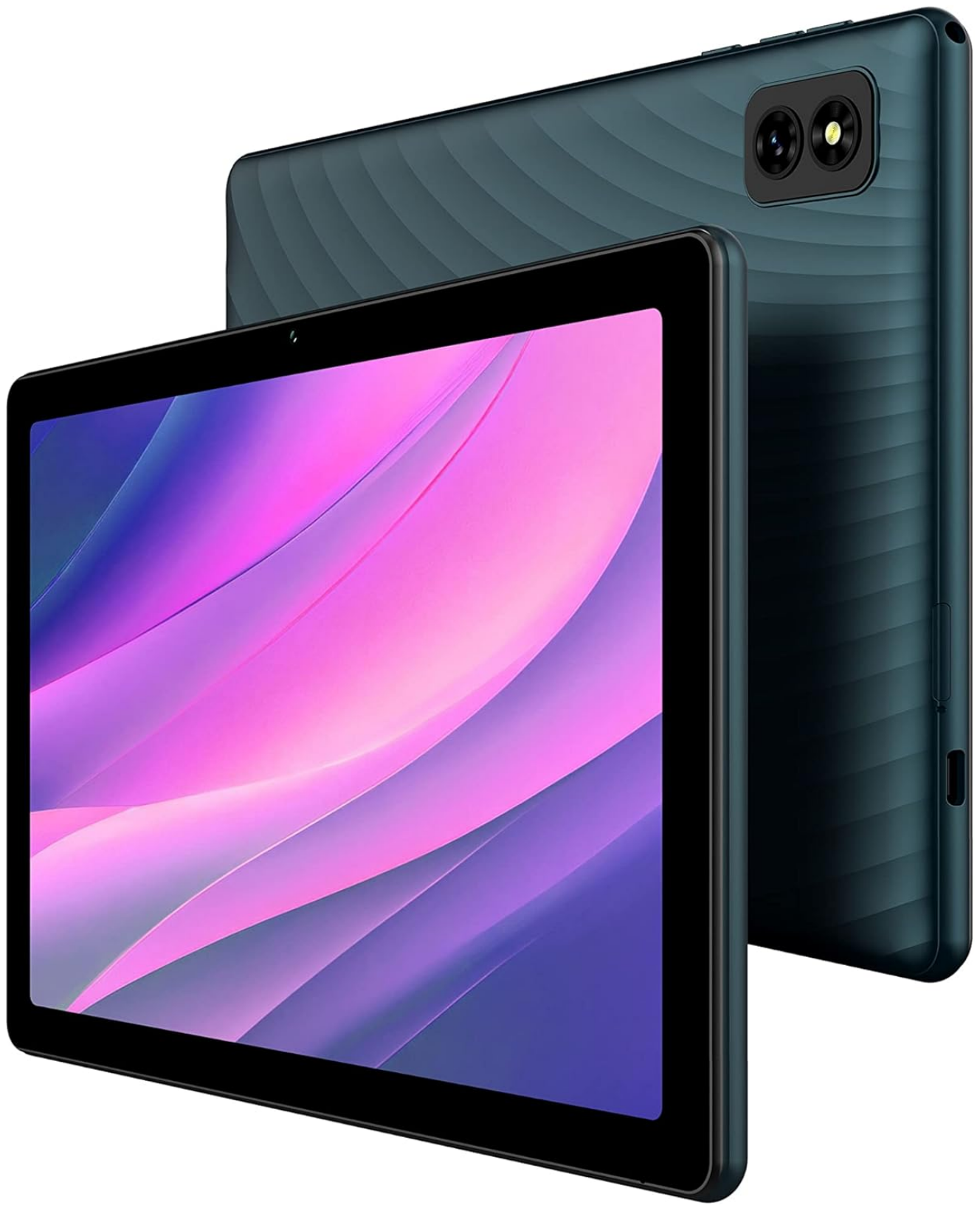
Angled view of the BLU M10L Plus tablet, highlighting its sleek design.