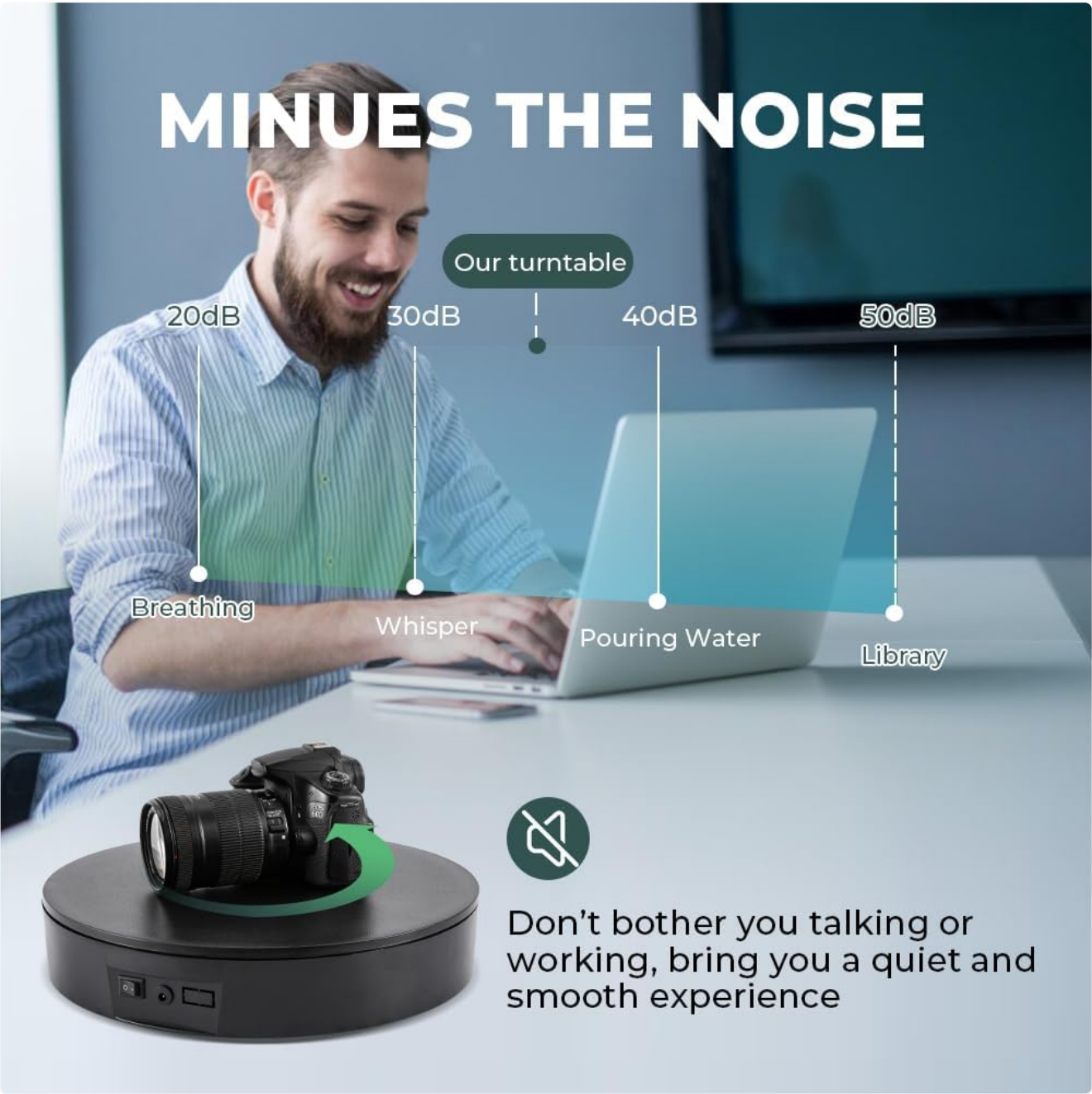
Figure 5: Noise level comparison, indicating the turntable operates quietly at ≤50db.