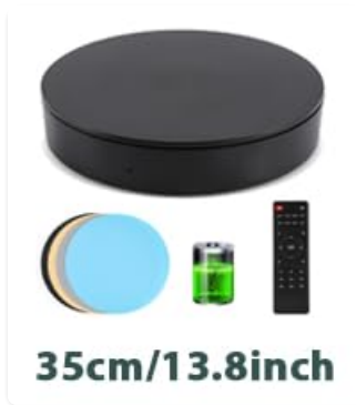
Figure 1: Overview of the Flyrivergo YZM-49 Turntable components including the main unit, remote control, power switch, frosted platform, and non-slip feet.

This 13.7-inch (35cm) turntable can support items up to 110 lbs (50kg), making it suitable for a wide range of products, from small appliances to heavy camera gear. It features adjustable rotation speeds, multiple rotation modes, and comes with a convenient remote control for effortless operation. The built-in 3600mAh rechargeable battery ensures portability, allowing you to use it anywhere without being tethered to a power outlet.