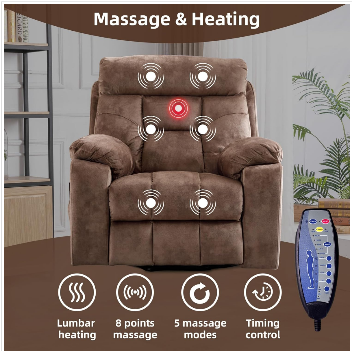
Image: Massage & Heating - Highlights the 8 massage points and lumbar heating area on the chair, along with the massage remote.