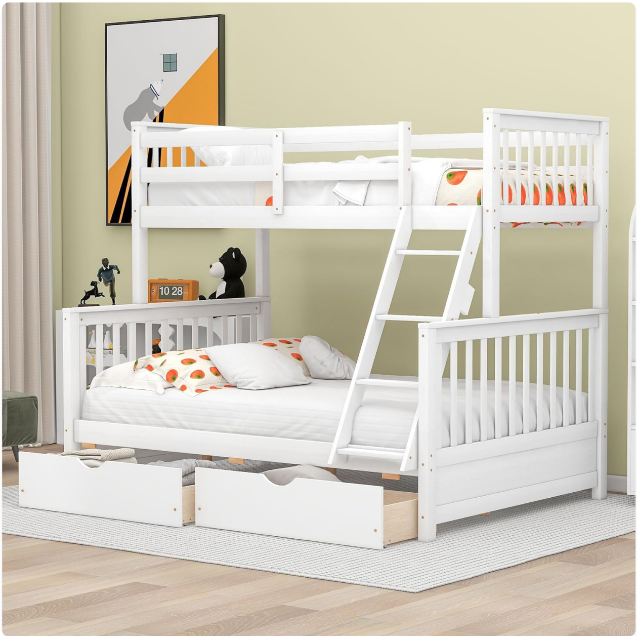
Figure 1: Merax Wood Bunk Bed with Drawers (Twin over Full, White)