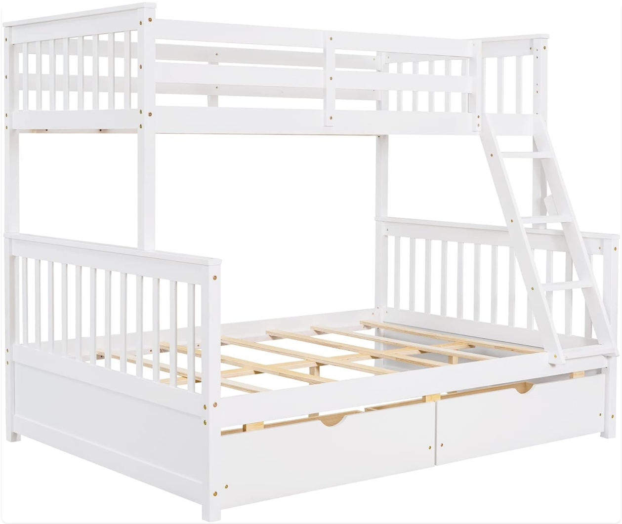
Figure 3: Bunk Bed Frame Ready for Mattresses