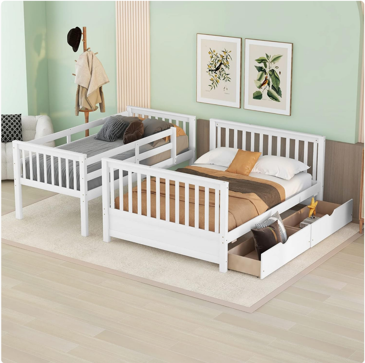
Figure 4: Bunk Bed in Detached Configuration