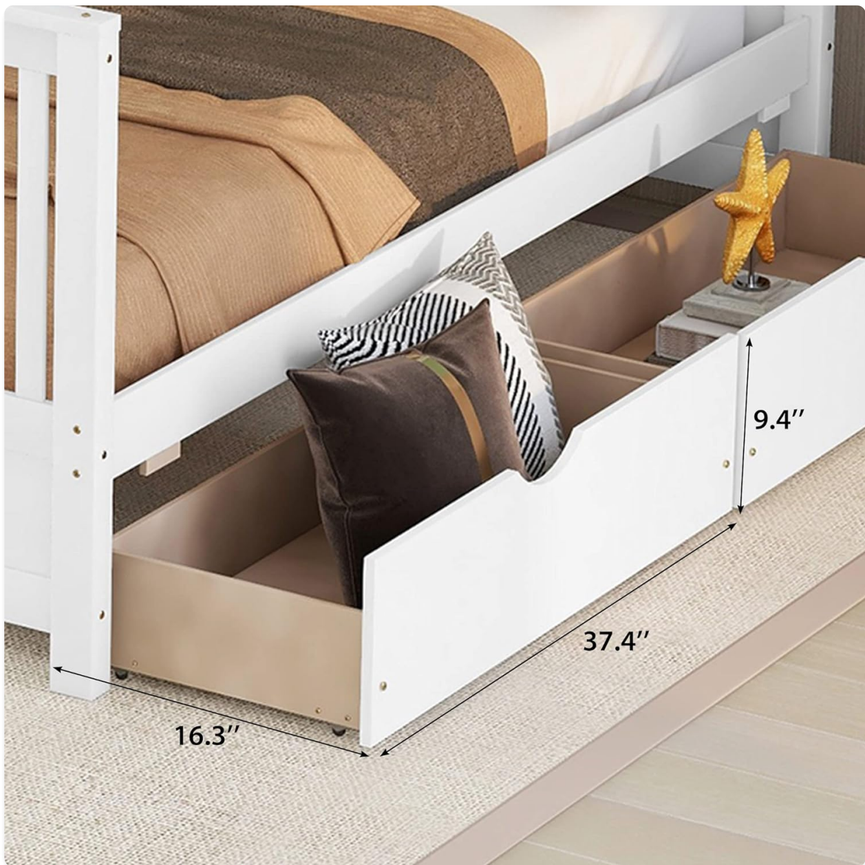
Figure 5: Integrated Storage Drawers