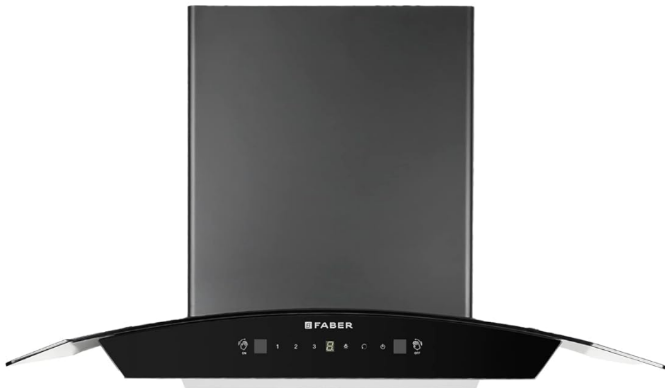
Figure 5: Detailed view of the touch control panel.