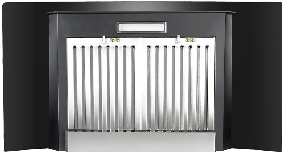
Figure 7: Activating the Autoclean function with I-clean technology.