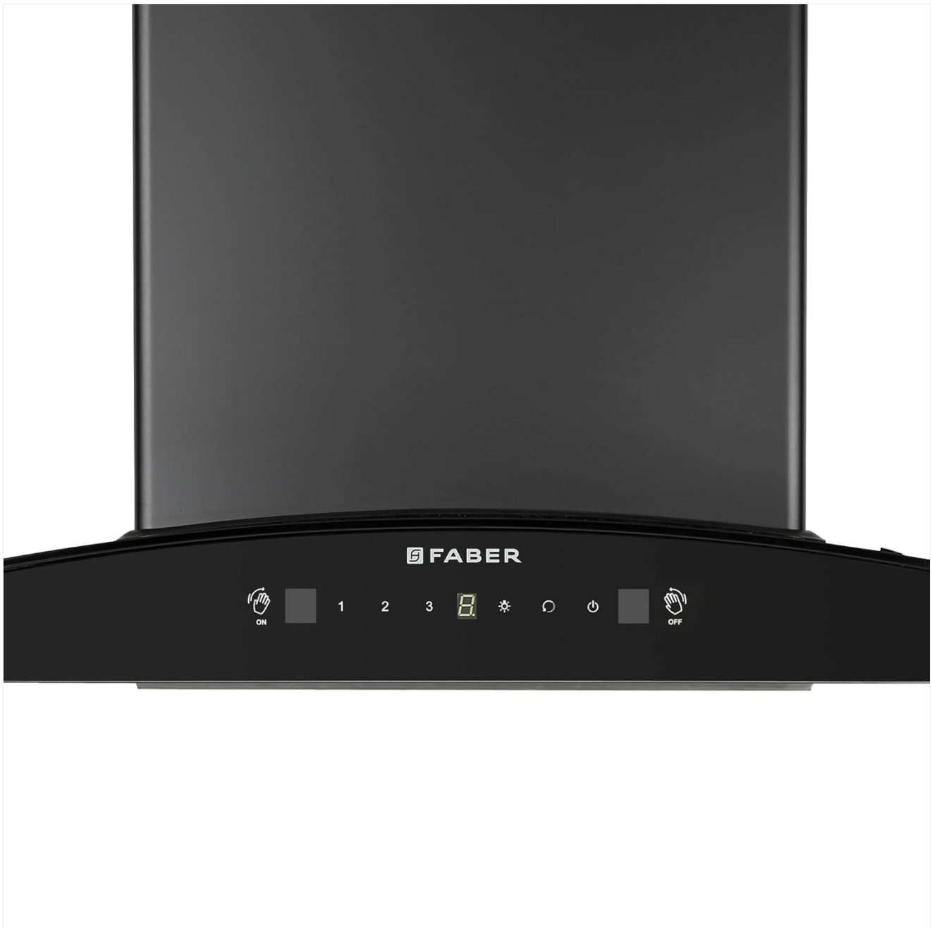
Figure 3: Illustration of the chimney's soft noise operation for a quieter cooking experience.