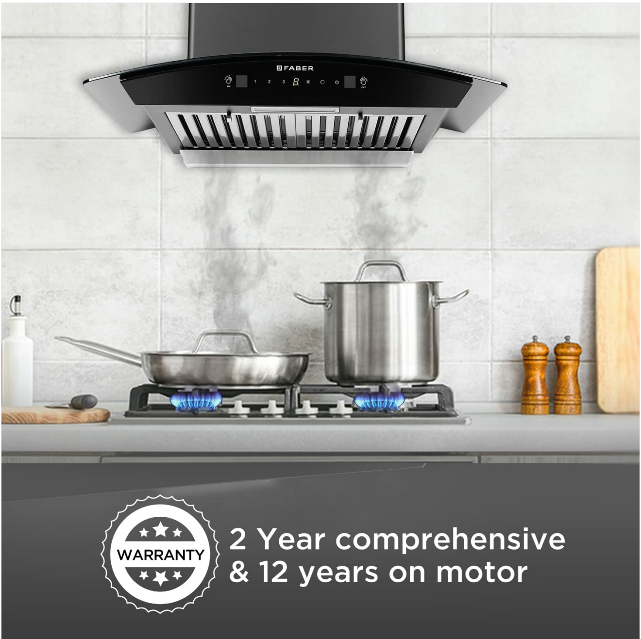
Figure 10: Warranty information for the Faber chimney.