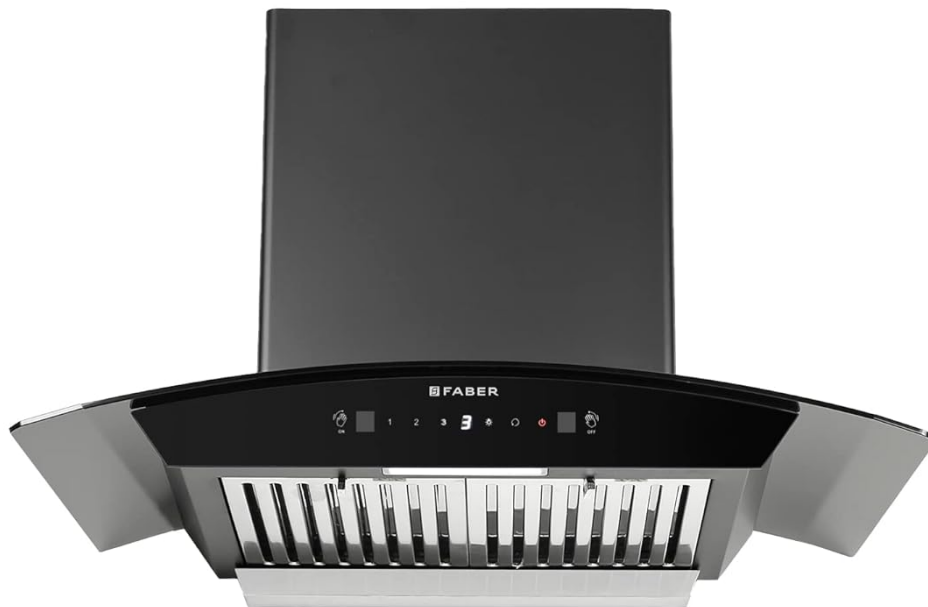
Figure 1: Front view of the Faber 75 cm Autoclean Curved Shape Kitchen Chimney.