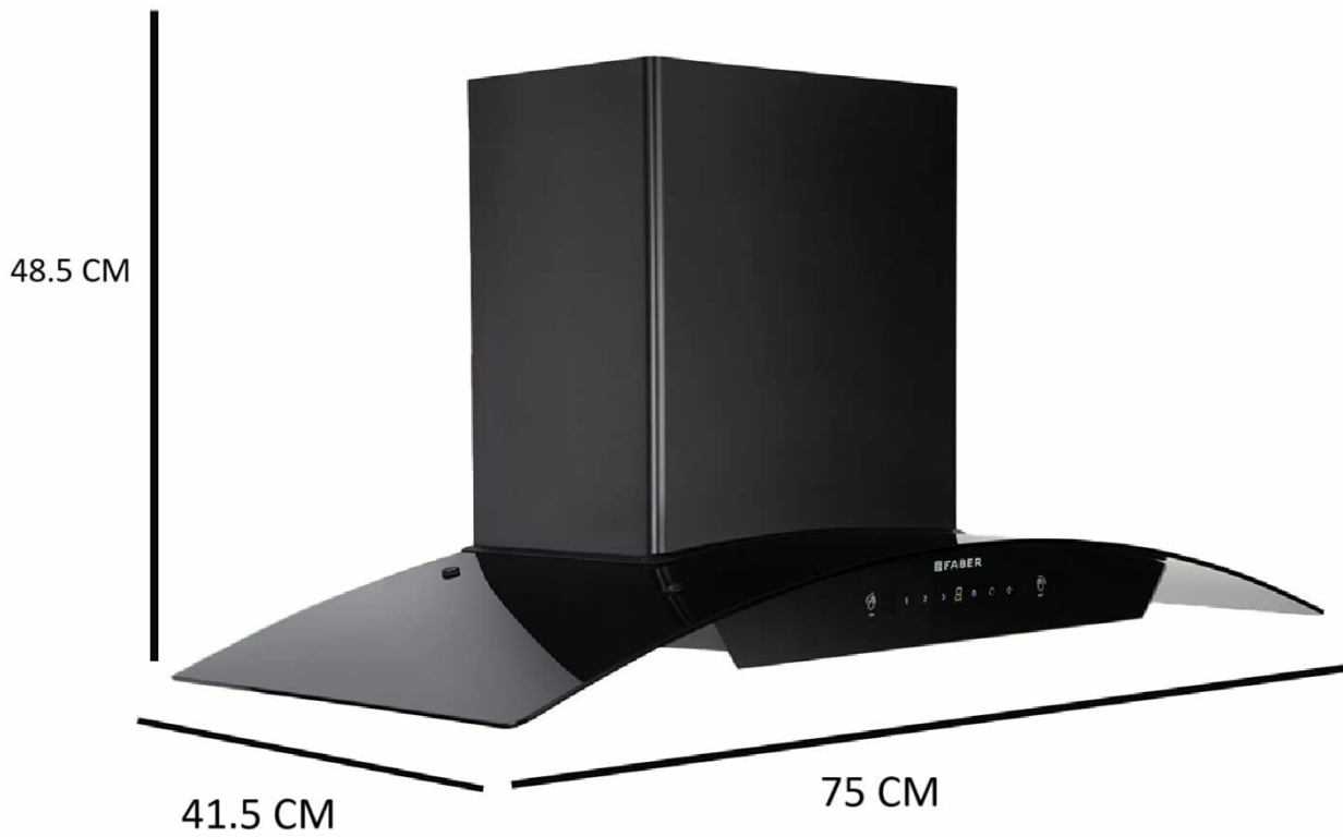
Figure 9: Product dimensions for installation planning.