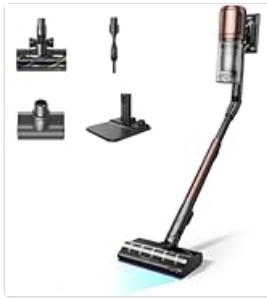
Image: A visual representation of all accessories included with the dreame R20 Cordless Stick Vacuum Cleaner. This includes the main unit, extension wand, various brush heads, and charging accessories.