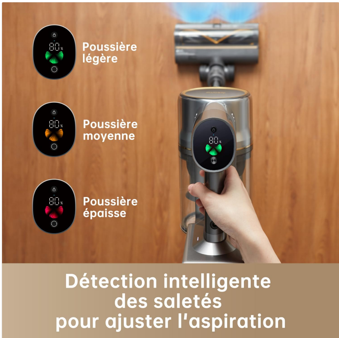
Image: The multi-surface brush head of the dreame R20 in action, showing its blue LED lights illuminating dust on a hard floor.