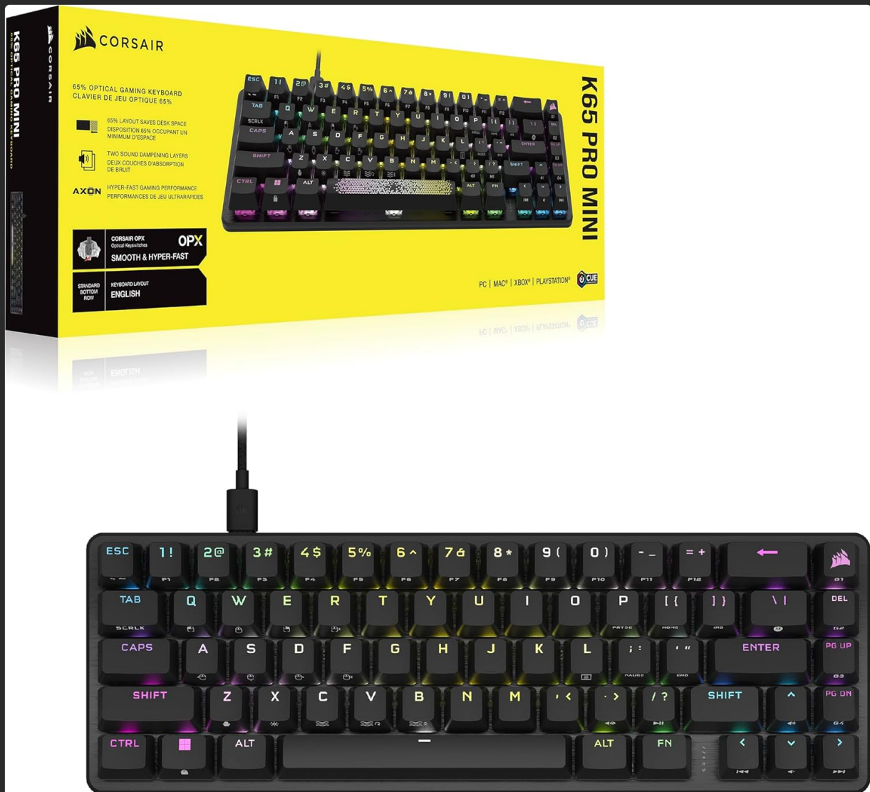
Image: The Corsair K65 PRO Mini keyboard shown with its retail packaging and included USB cable.