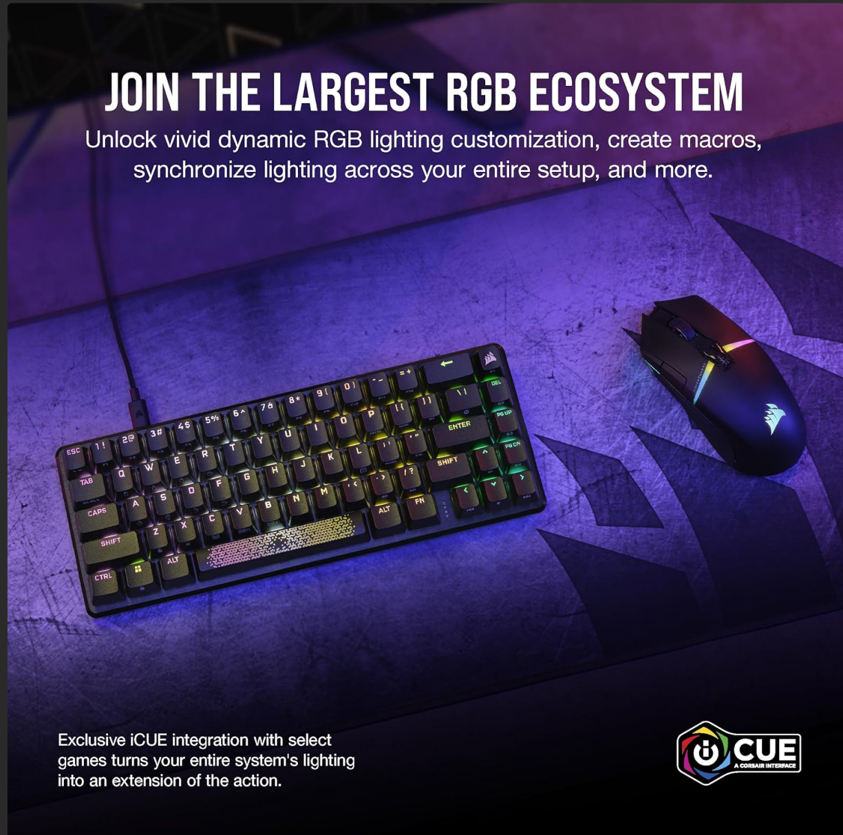
Image: The K65 PRO Mini keyboard displaying vibrant RGB lighting, with a visual representation of the iCUE software interface in the background.