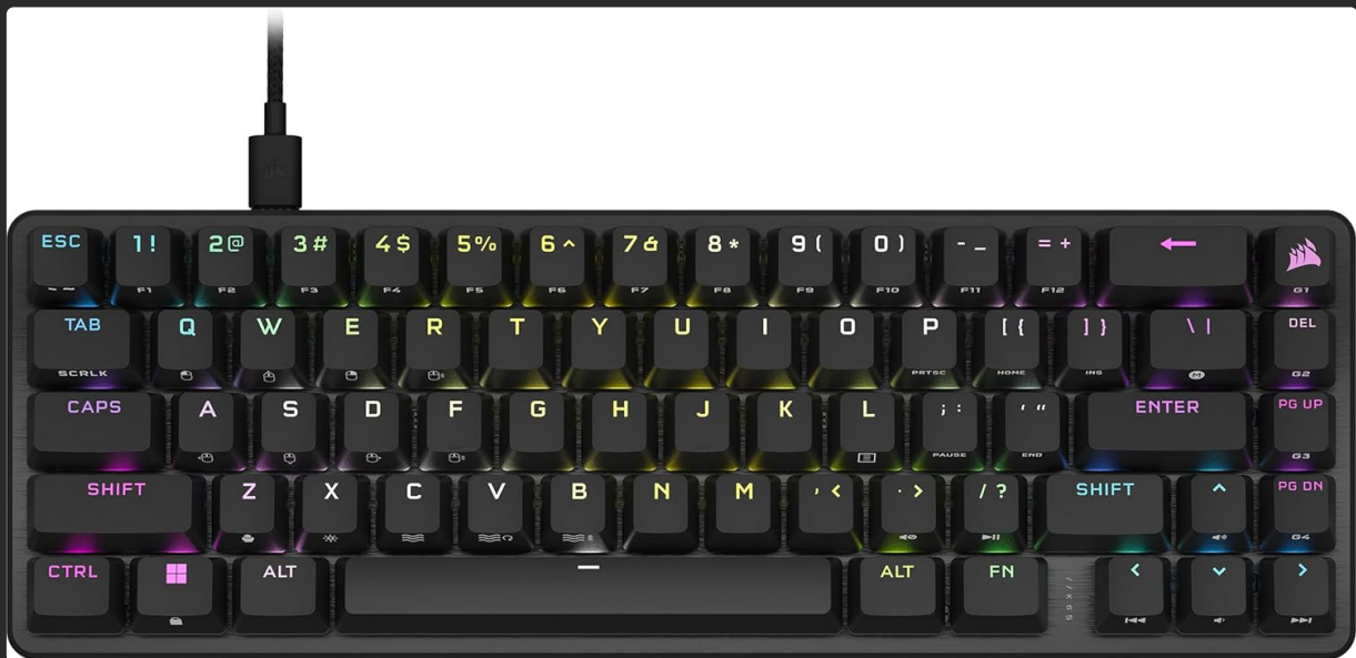
Image: Top-down view of the Corsair K65 PRO Mini RGB keyboard, showcasing its compact 65% layout and RGB lighting.

This manual provides detailed instructions for the setup, operation, maintenance, and troubleshooting of your Corsair K65 PRO Mini RGB 65% Optical-Mechanical Wired Gaming Keyboard. Designed for performance in a compact form factor, this keyboard features CORSAIR OPX optical switches, PBT double-shot keycaps, and CORSAIR AXON Hyper-Processing Technology for a responsive and durable gaming experience.