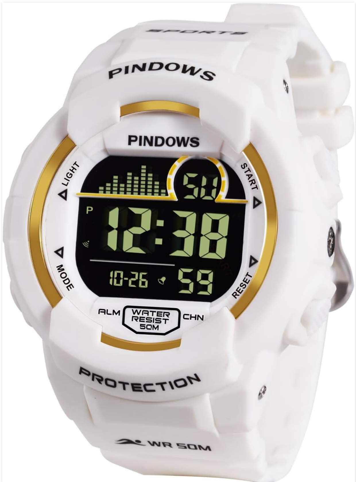
Figure 1: Front view of the PINDOWS PDS-8006B-N6 Sport Watch, highlighting its digital display and button layout.