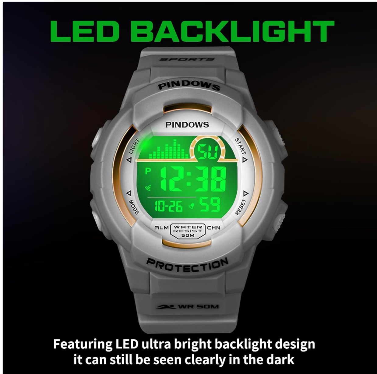
Figure 3: The LED backlight illuminates the display for clear viewing in the dark.