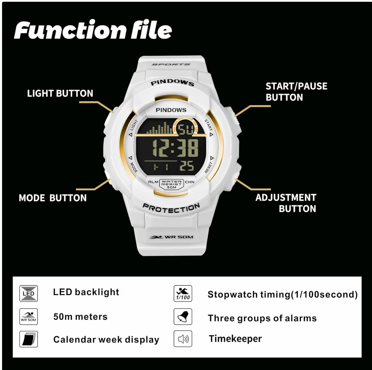
Figure 2: Overview of watch functions and button assignments.