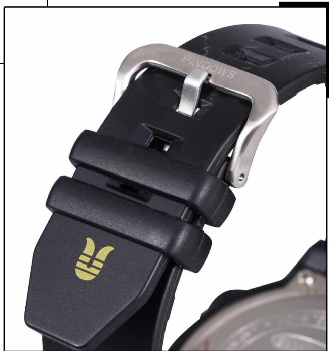
Figure 6: Details of the watch's durable back cover and clasp.