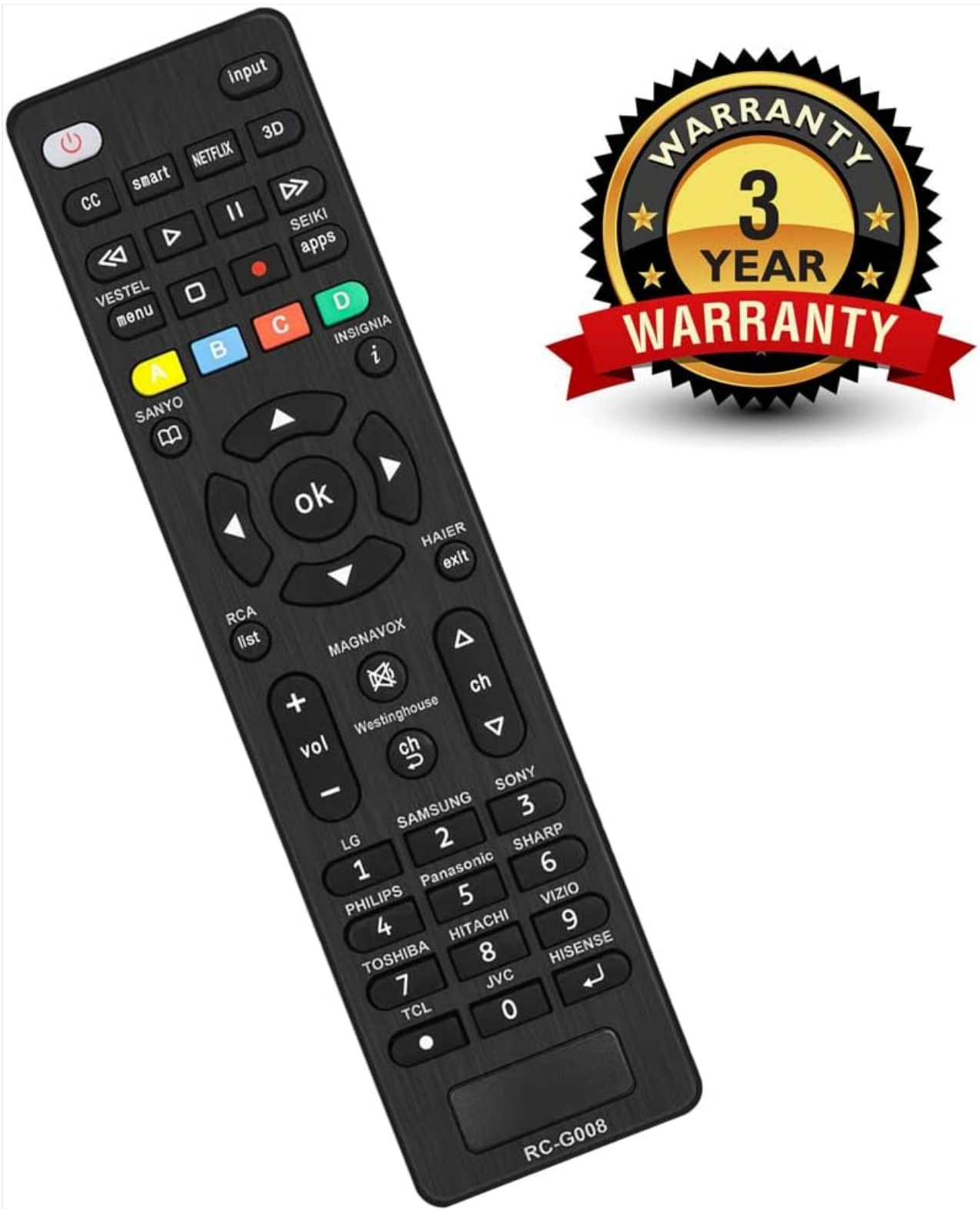
Figure 9.1: 3-Year Quality Warranty

If you encounter any quality problems or require assistance with setting up your remote control, please do not hesitate to contact Amiroko customer support. Refer to the contact information provided with your purchase or on the official Amiroko website for the most up-to-date support channels.