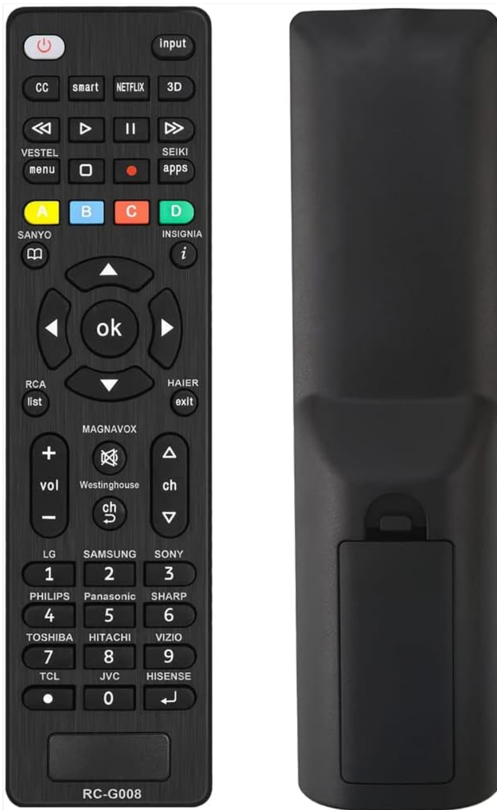
Figure 1.2: Amiroko Universal TV Remote Control (Front and Side View)