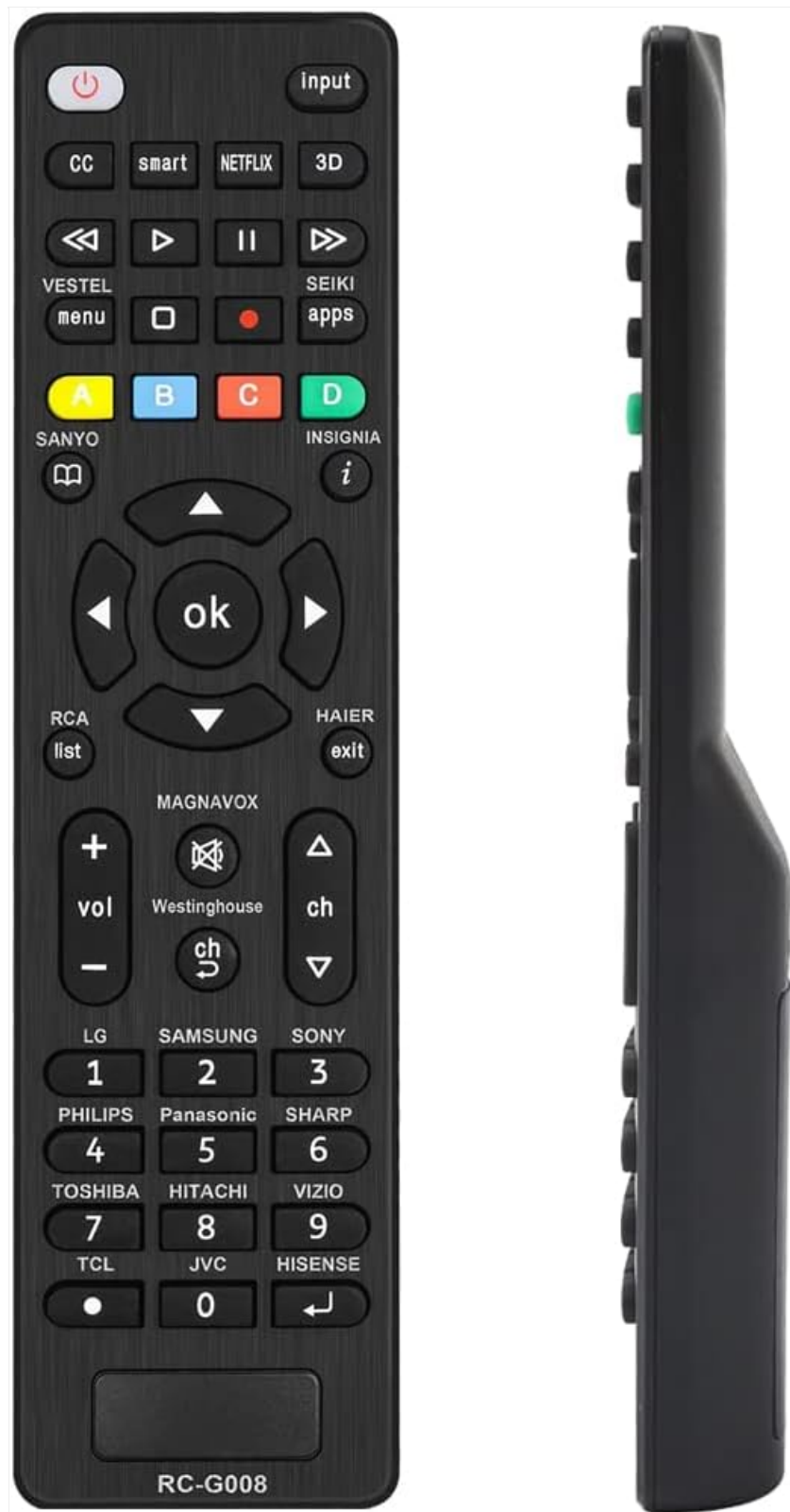
Figure 1.1: Amiroko Universal TV Remote Control (Front View)