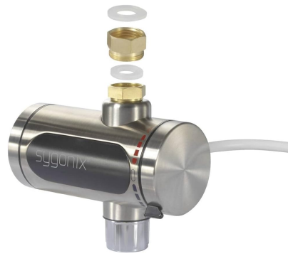
Figure 3: Connection Components

An exploded view illustrating the brass connection fittings and white sealing washers, demonstrating how the water heater connects to the water supply.