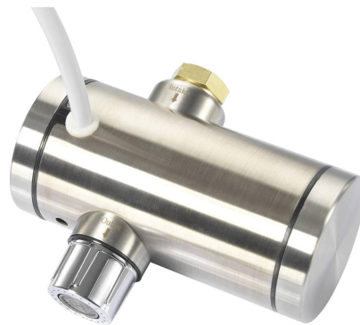
Figure 4: Rear View with Water Flow Indicators

An exploded view illustrating the brass connection fittings and white sealing washers, demonstrating how the water heater connects to the water supply.