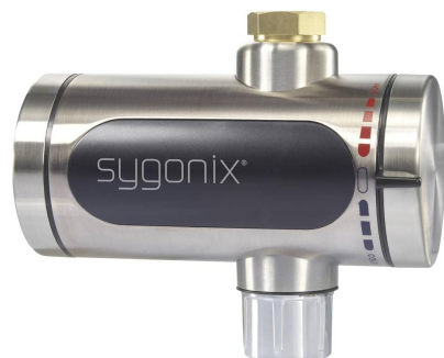
Figure 2: Front View with Temperature Control

This image shows the main body of the Sygonix instant water heater, highlighting the digital LED display which indicates the current water temperature, set here at 39 degrees. The Sygonix logo is prominently displayed.