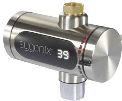
Figure 1: Front View with Digital Display

This image shows the main body of the Sygonix instant water heater, highlighting the digital LED display which indicates the current water temperature, set here at 39 degrees. The Sygonix logo is prominently displayed.