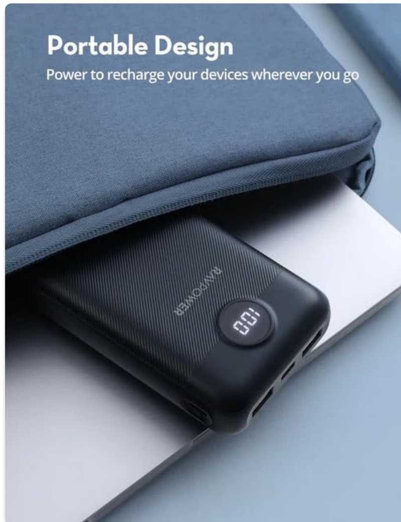
Image: An angled view of the power bank, clearly showing its USB-A and USB-C ports, along with the digital battery indicator.