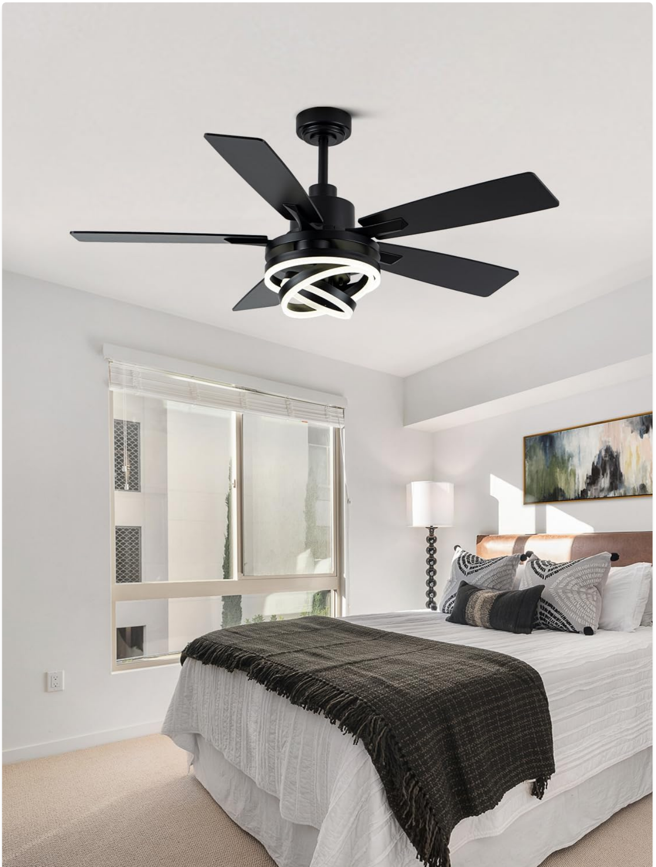
Figure 4.3: Reversible DC motor for year-round comfort and 6-speed settings.