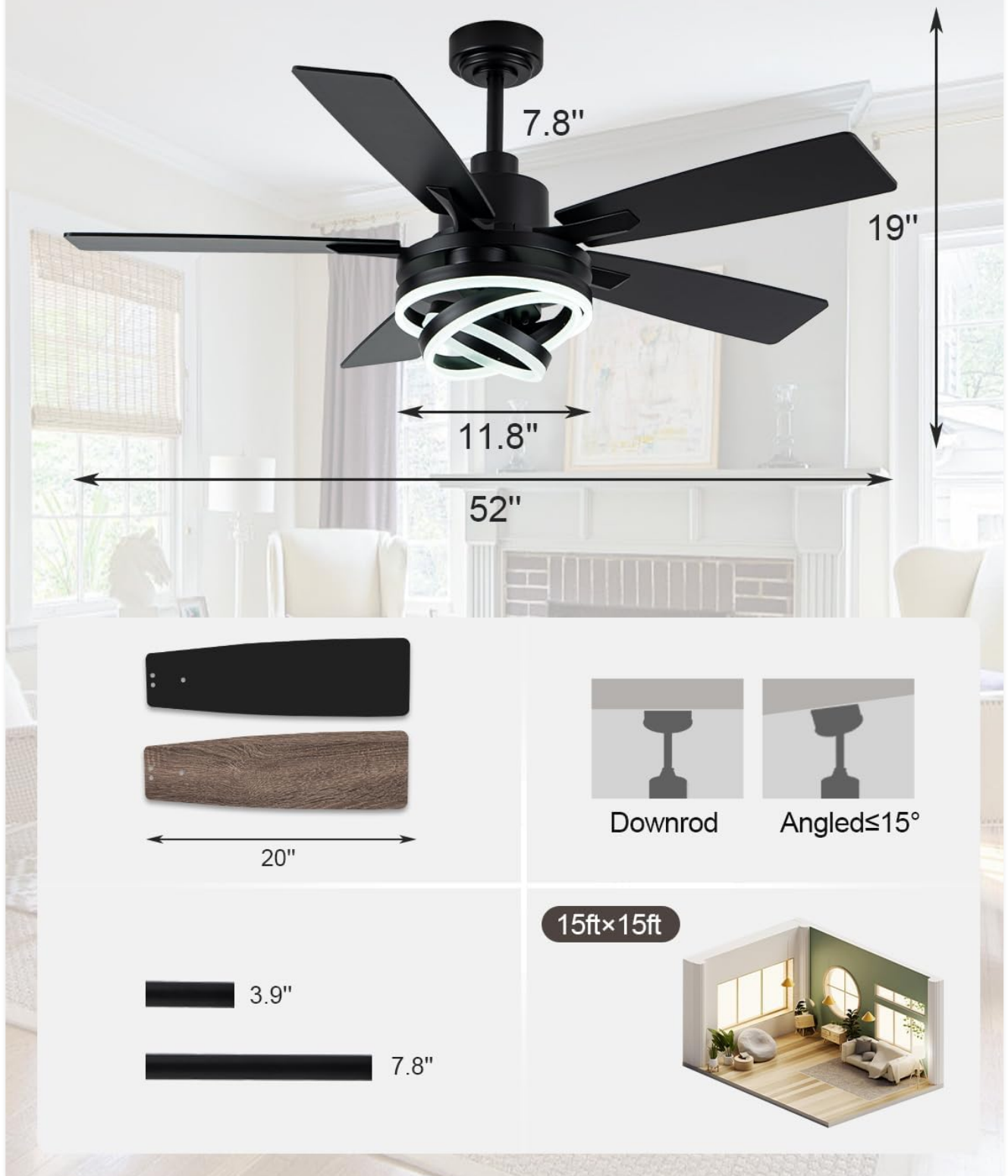
Figure 7.1: Key dimensions of the 52-inch ceiling fan.