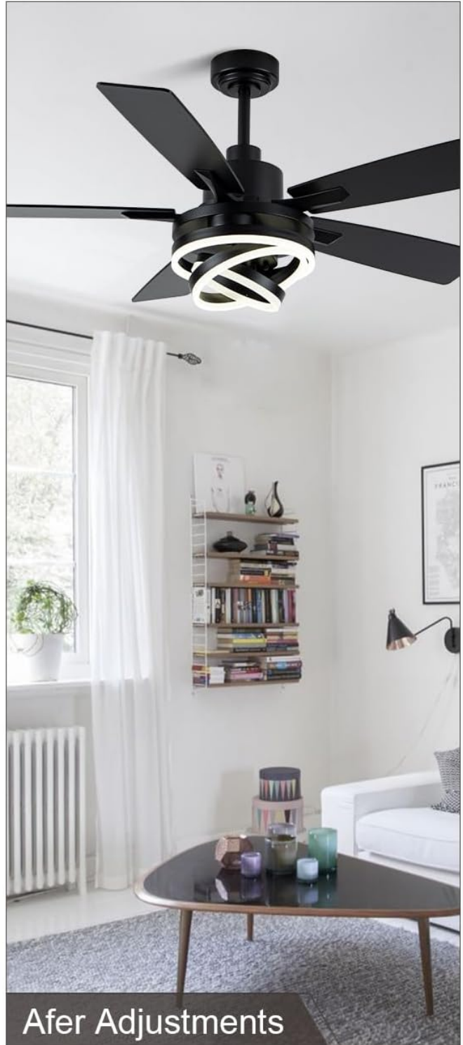
Figure 3.2: The light ring can be adjusted to different configurations during installation.

The fan includes adjustable downrods for flexible installation heights. The reversible blades offer two aesthetic options: a sleek black finish or a warm wood grain finish, which can be chosen during assembly.