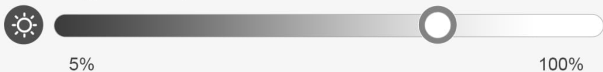
Figure 4.2: Adjustable light color temperatures and brightness levels.