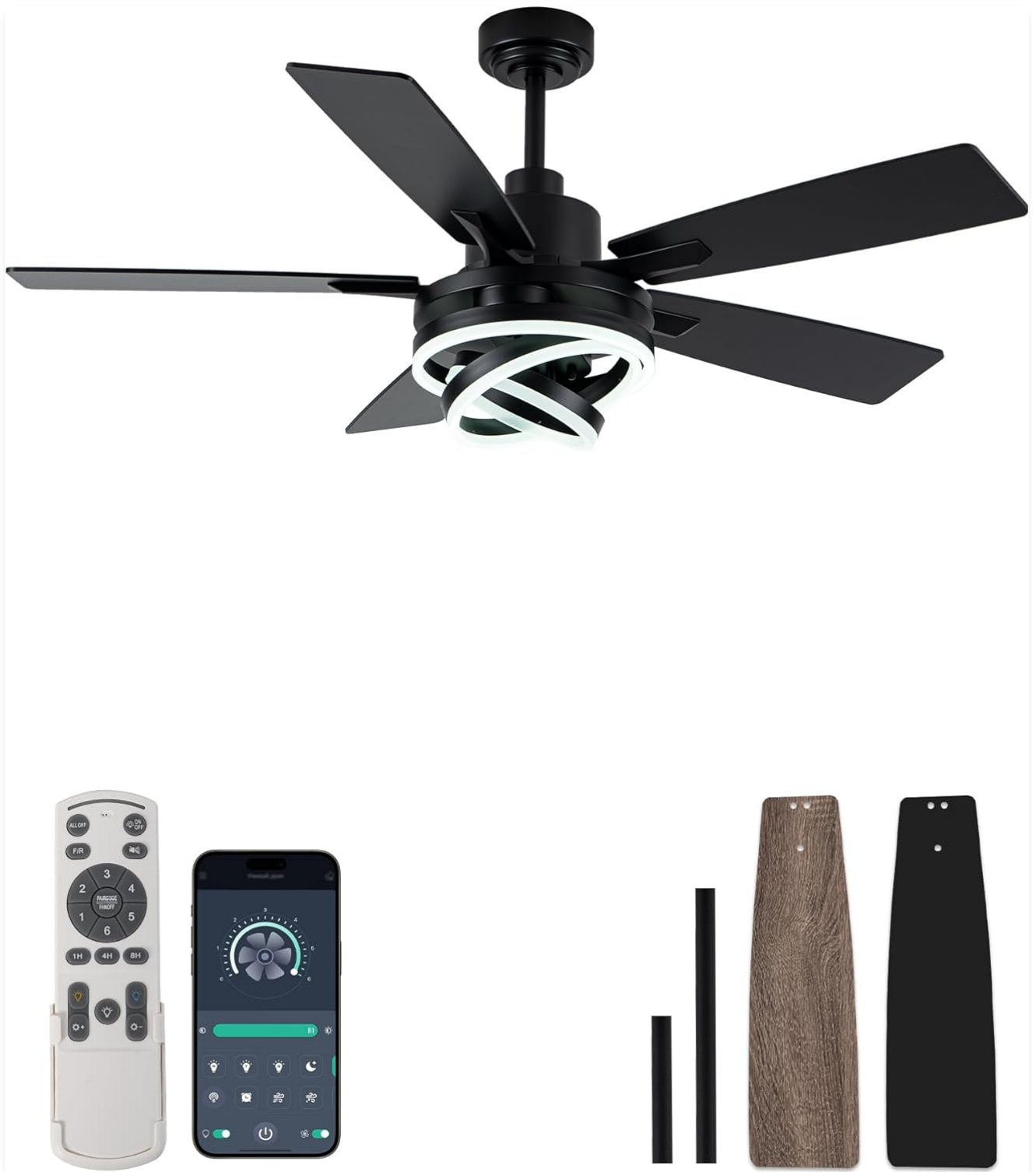
Figure 1.1: Bella Depot 52" Modern Black Chandelier Ceiling Fan with its unique light ring design.