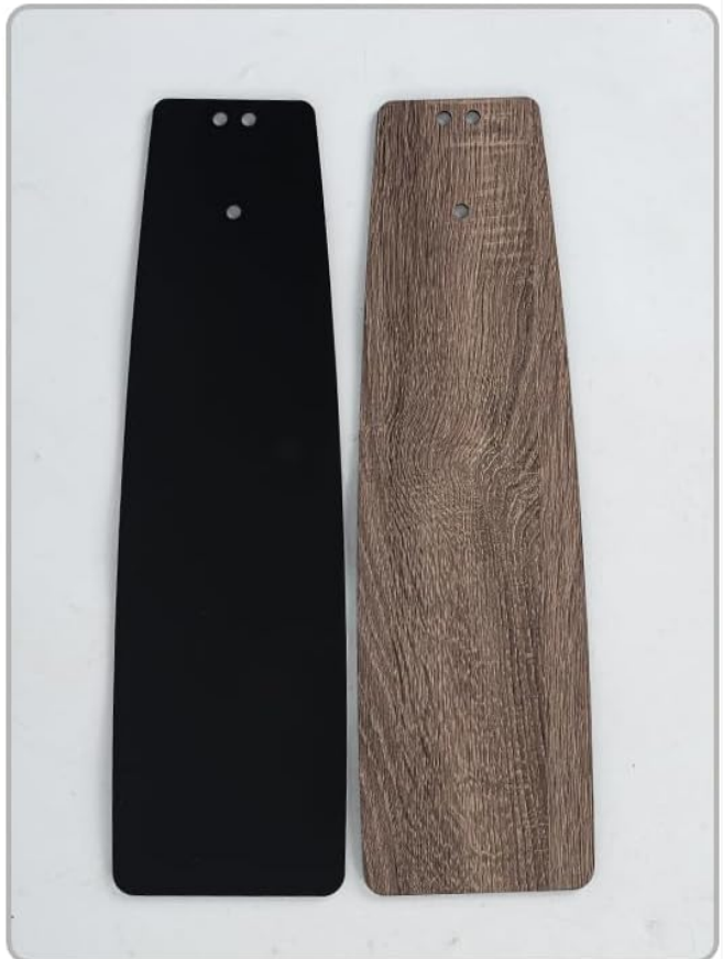
Figure 3.1: Key components include the motor housing, light ring, and reversible fan blades (black and wood grain options).