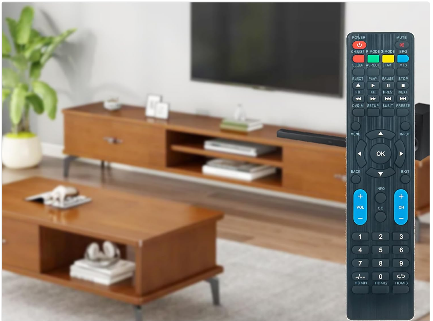
Image 1.1: The ZdalaMit Replacement Remote Control shown in a typical home entertainment environment, highlighting its intended use with an ATYME TV.

The remote is pre-programmed for immediate use with compatible ATYME TV models, ensuring a seamless experience. It is constructed from durable ABS material and offers a reliable operating range.