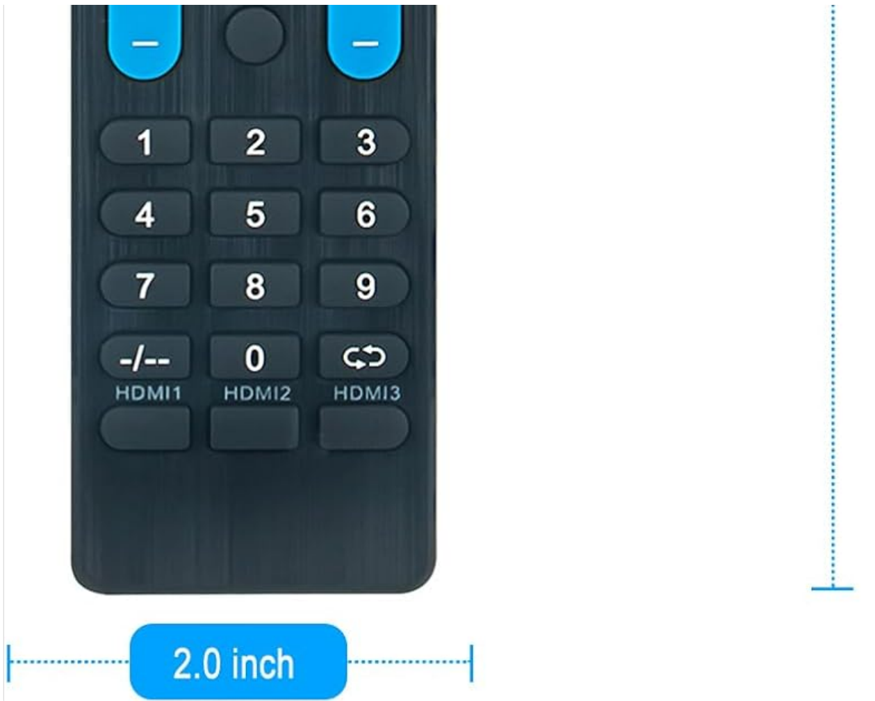
Image 6.1: The remote control displayed with its approximate dimensions: 8.4 inches in length and 2.0 inches in width.