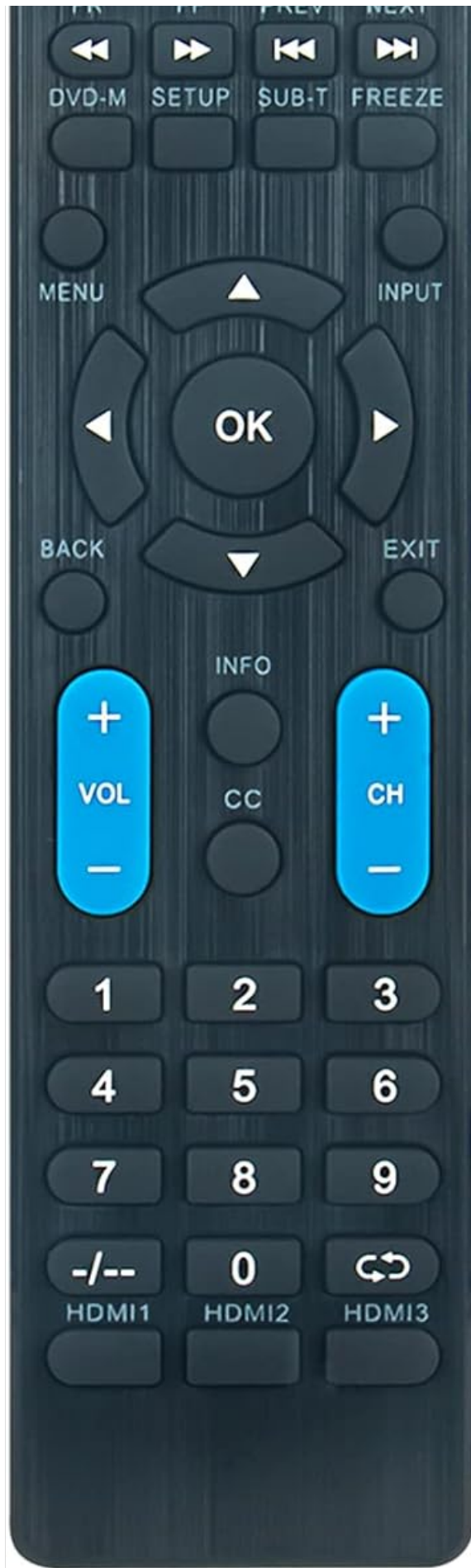
Image 2.1: A clear front view of the ZdalaMit Replacement Remote Control, showing the layout of all buttons. The battery compartment is located on the reverse side.