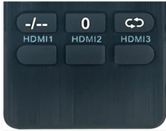
Image 3.1: A detailed view of the remote control, illustrating the position and labeling of each button for easy identification.