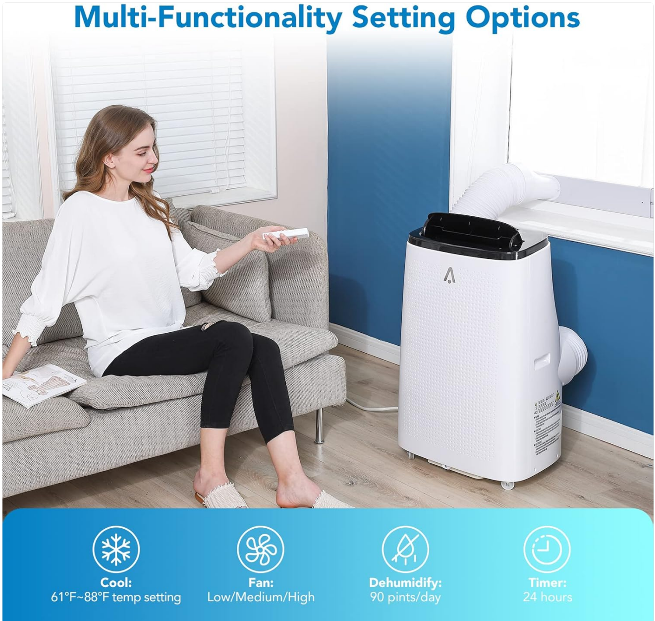
Figure 5.2.1: Visual representation of the Cool, Fan, Dehumidify, and Timer functions.