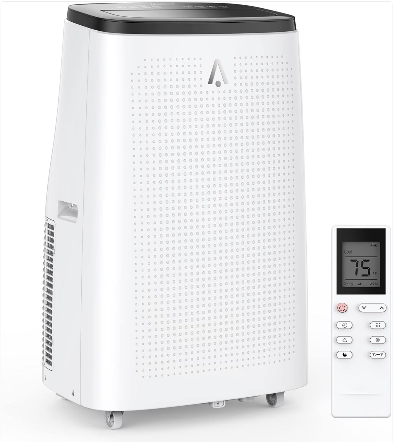
Figure 3.2.1: Garvee Portable Air Conditioner unit and included remote control.