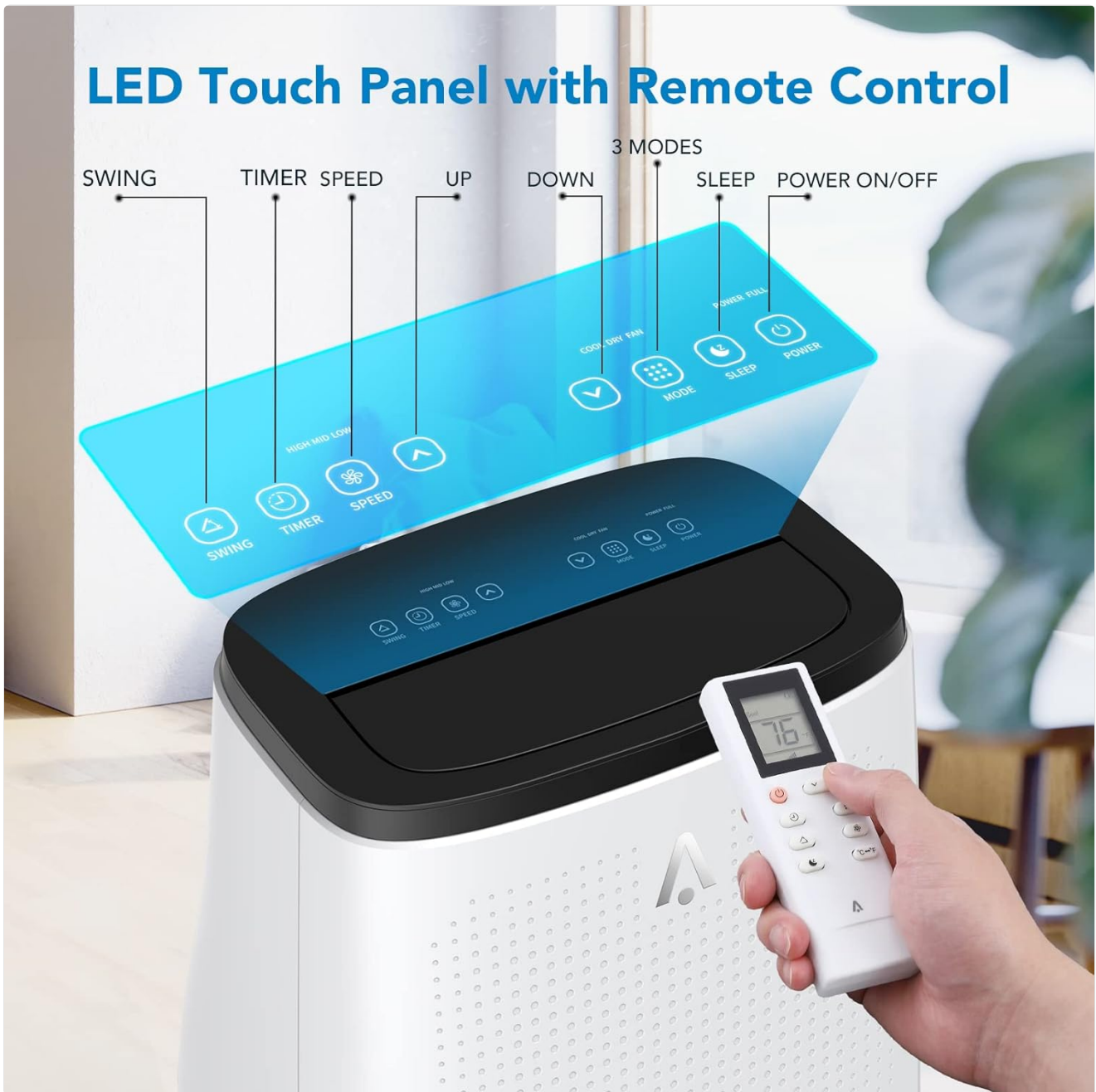
Figure 5.1.1: Overview of the LED touch panel and remote control buttons, including Swing, Timer, Speed, Up/Down temperature, Mode, Sleep, and Power.

The unit can be operated using the LED digital control panel on top of the unit or the included remote control.