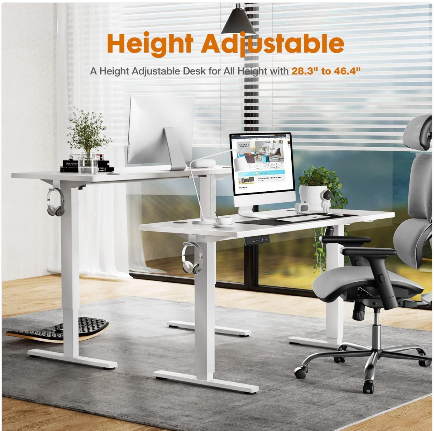
Figure 4.2: The edx Electric Standing Desk's height adjustability, showing two desks set at different heights to accommodate various user preferences and ergonomic needs.