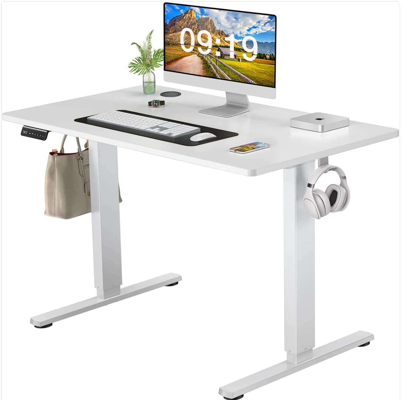
Figure 1.1: The edx Electric Standing Desk, showcasing its spacious white desktop and sturdy white frame, equipped with a monitor, keyboard, and various office accessories. Two integrated hooks are visible, one holding a bag and another holding headphones.