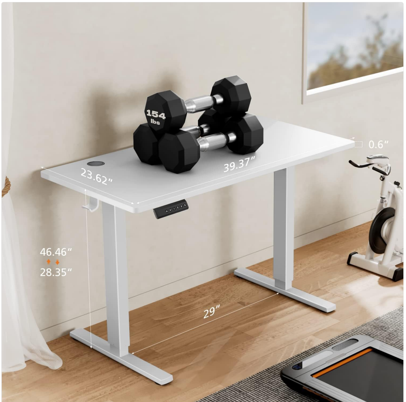
Figure 3.1: Dimensional overview of the edx Electric Standing Desk, highlighting its 40-inch width, 24-inch depth, and adjustable height range from 28.35 inches to 46.46 inches. The image also shows a weight of 154 lbs on the desktop, demonstrating its robust capacity.