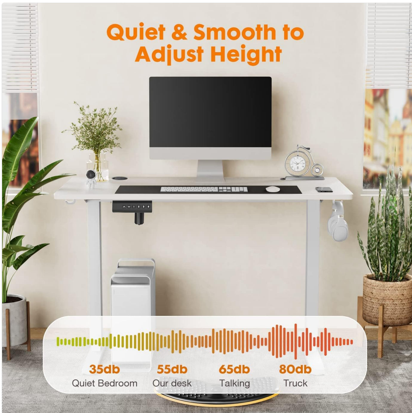
Figure 7.1: Noise level comparison, illustrating the quiet operation of the edx Electric Standing Desk at less than 55dB, comparable to a quiet conversation.