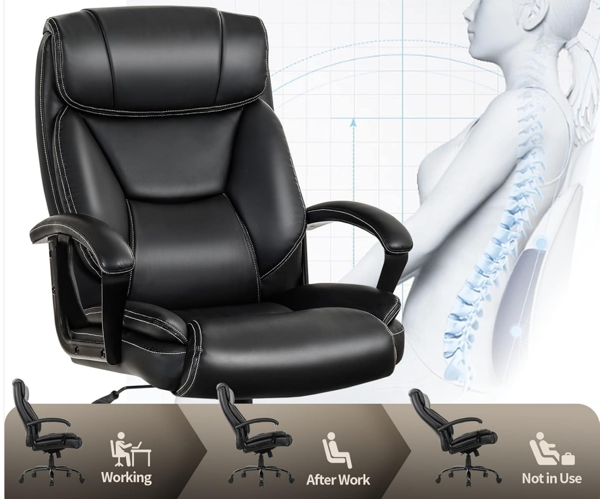
Image 5.2: Controls for 90°-120° rocking mode, tilt angle, and tilt tension.