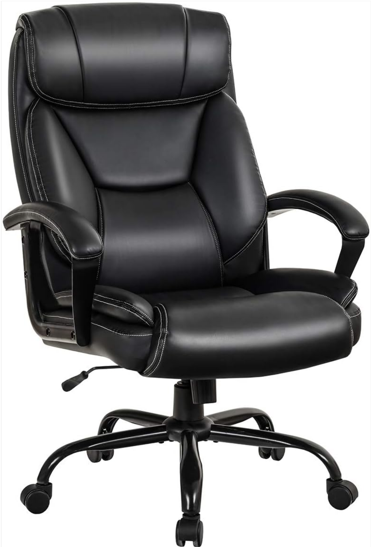
Image 1.1: Overall view of the GIANTEX KZ98709ENDE Ergonomic Swivel Office Chair.