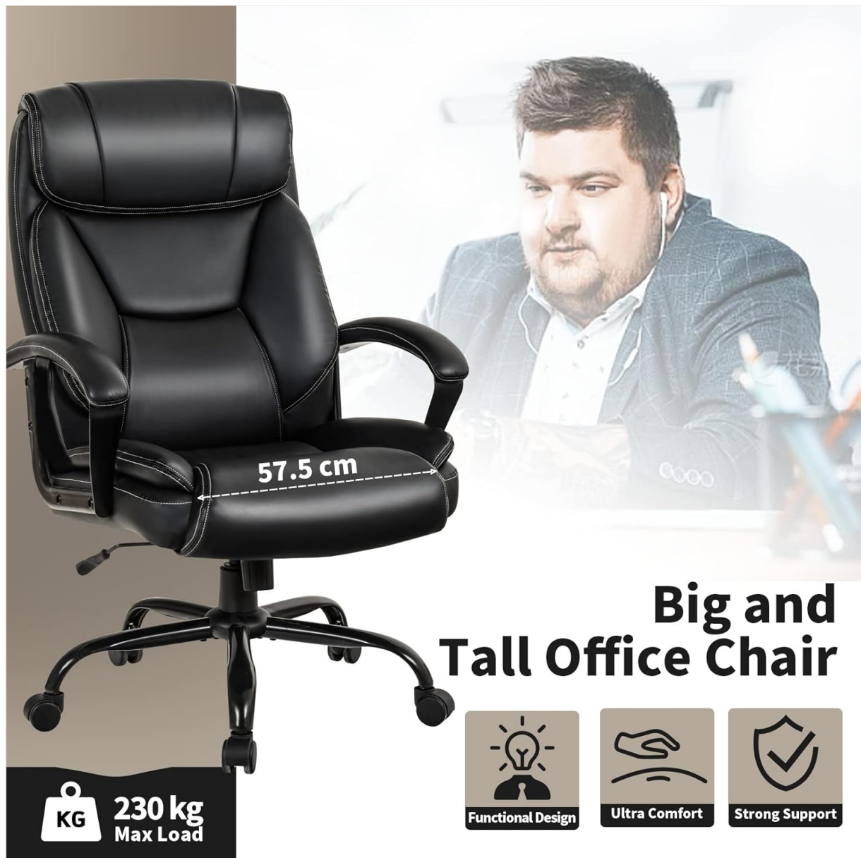
Image 5.3: Visual representation of the chair's ergonomic design and spinal support.