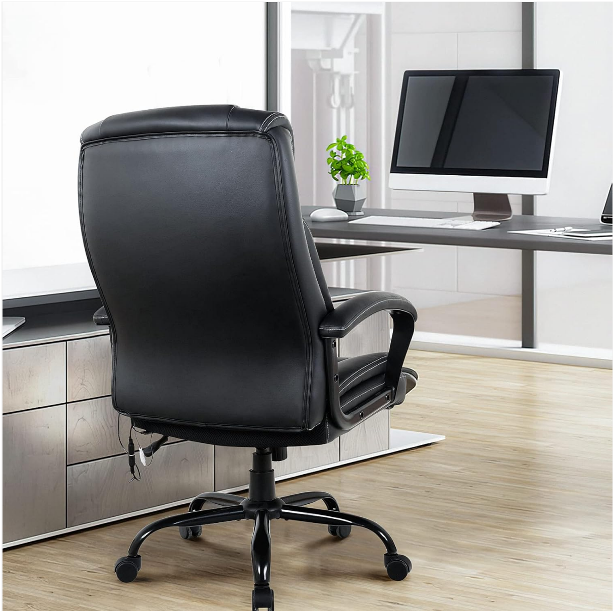
Image 6.1: Close-up of chair details, highlighting the soft padded headrest, curved armrest, waterfall seat, and durable wheels.