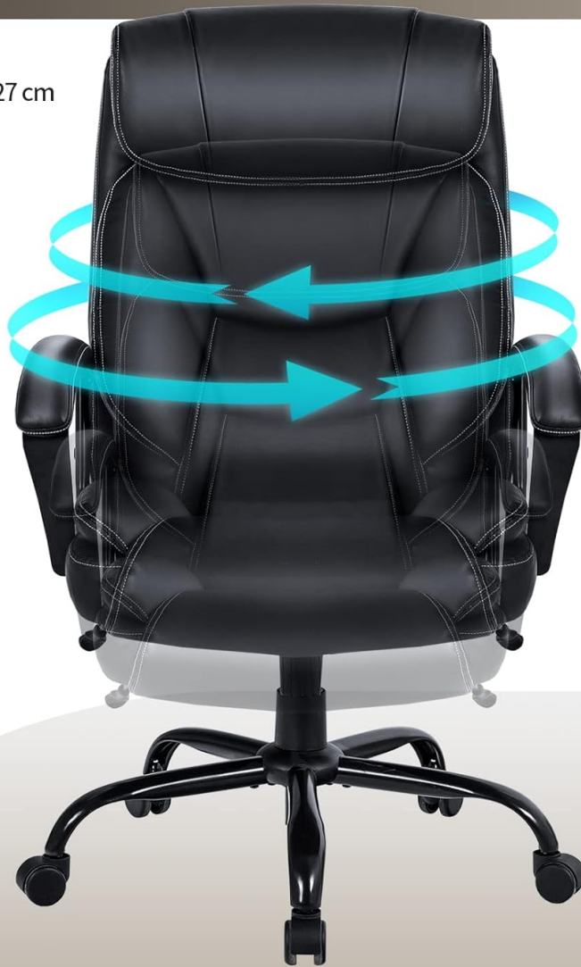
Image 5.1: Illustration of seat height adjustment and 360-degree rotation.