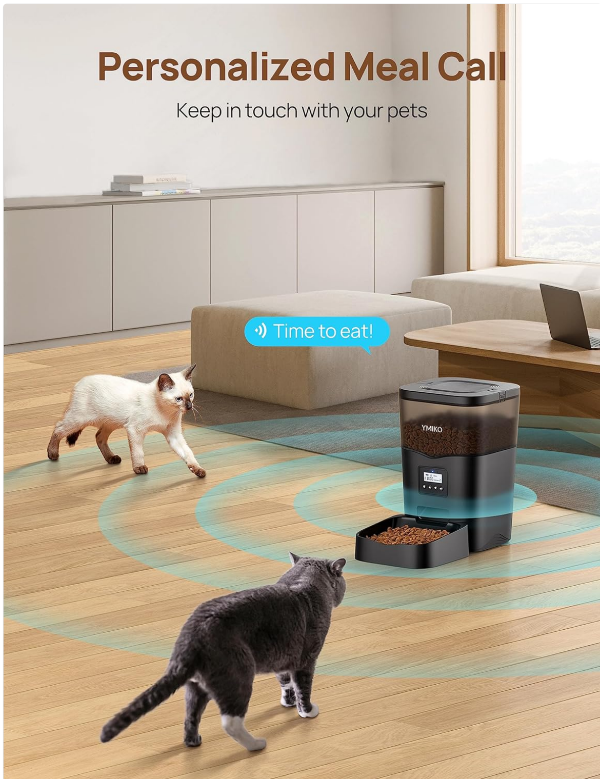
Image: Two cats approaching the Ymiko Automatic Cat Feeder, with a speech bubble indicating a personalized meal call, demonstrating the voice recording feature.