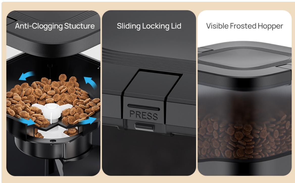
Image: A diagram highlighting the anti-clogging structure within the feeder, the sliding locking lid mechanism, and the visible frosted design of the food hopper.