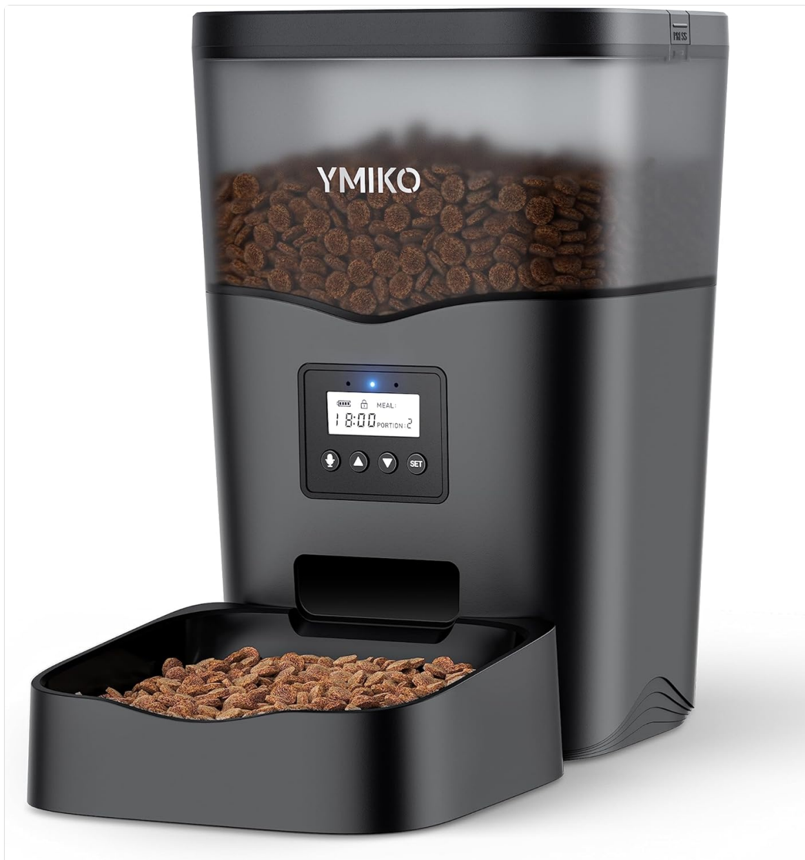
Image: The Ymiko Automatic Cat Feeder, a black unit with a translucent food hopper filled with kibble, and a black food bowl attached at the bottom.