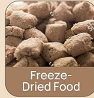
Freeze- Dried Food