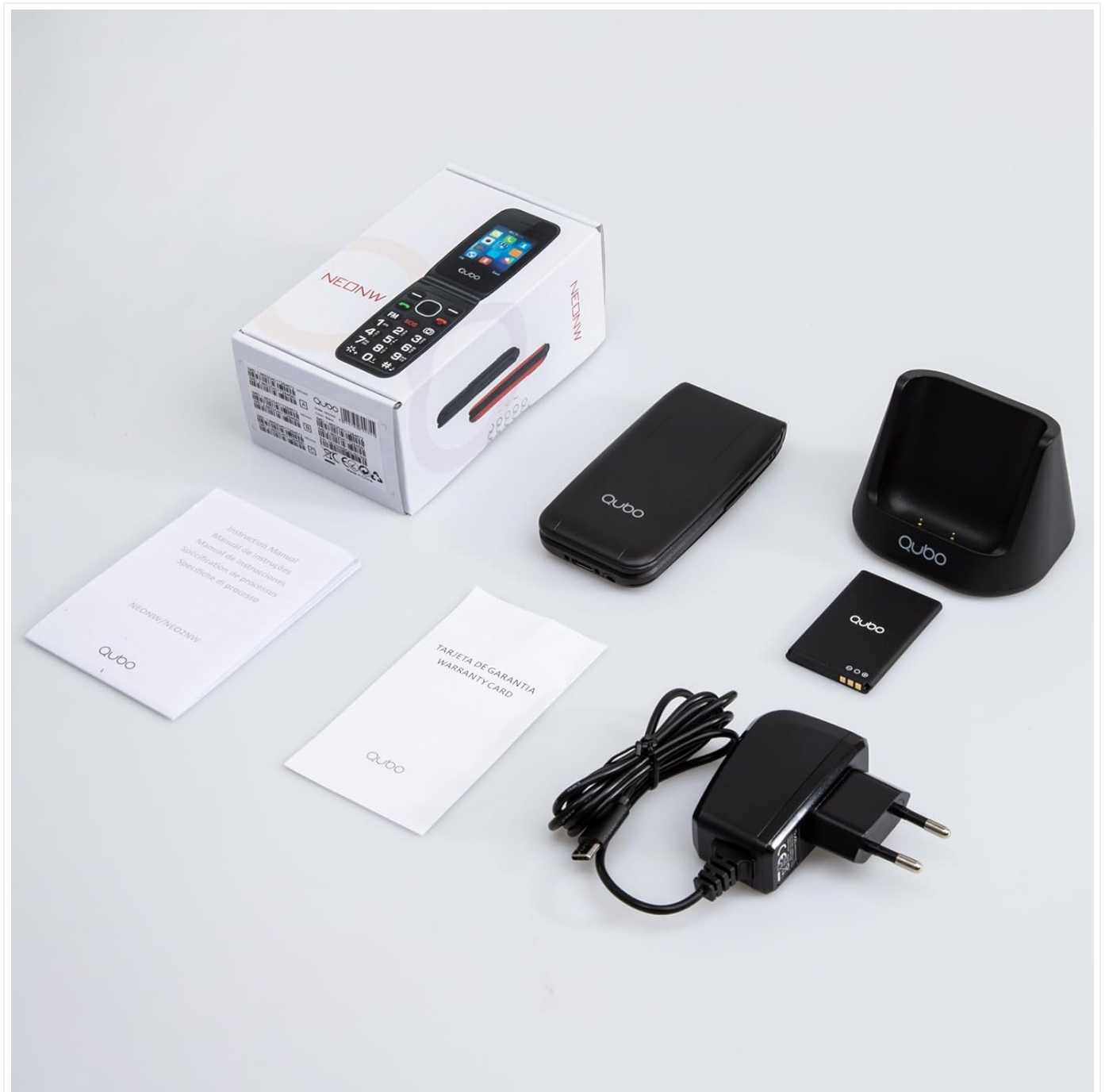
Image: An overview of the box contents, including the Qubo NEO2NW phone, its charging dock, a USB cable, a power adapter, the battery, and printed user manuals.

Carefully unpack your Qubo NEO2NW phone and ensure all components are present.