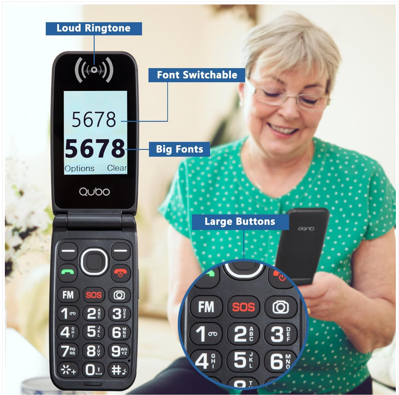
Image: The Qubo NEO2NW phone's screen displaying large, clear fonts and the option to switch font sizes. The image also points out the loud ringtone capability and the large, tactile buttons on the keypad.

The phone features a 2.4-inch screen with options for large fonts for better readability.