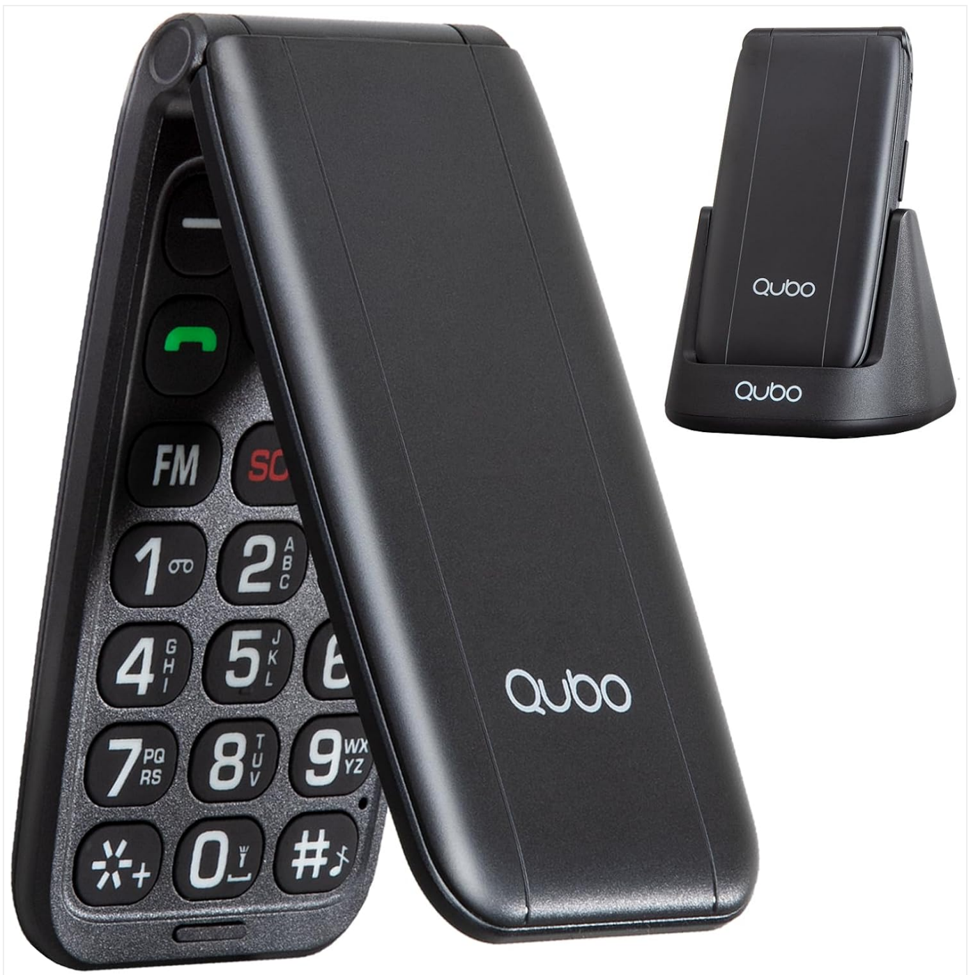
Image: The Qubo NEO2NW flip phone in its open position, displaying its large, easy-to-read keypad and clear screen. A charging dock is visible in the background, indicating its charging method.