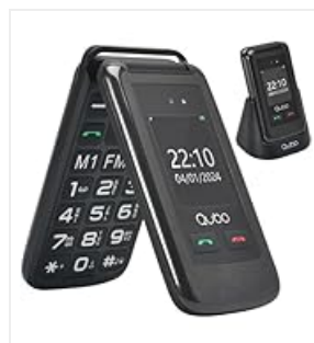
Image: A black flip phone displaying the digital time '22:10' on its screen. This image provides multiple views of the phone, highlighting its large keypad and clear display.