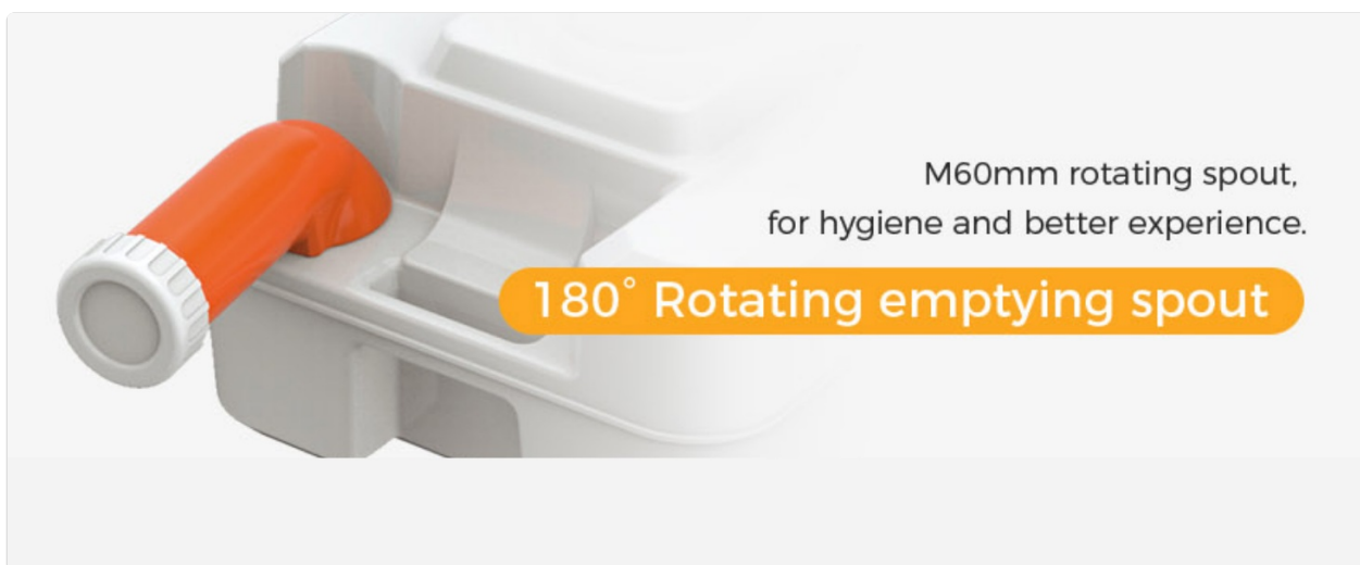
Figure 5.2: The 180° rotating emptying spout for controlled waste disposal.