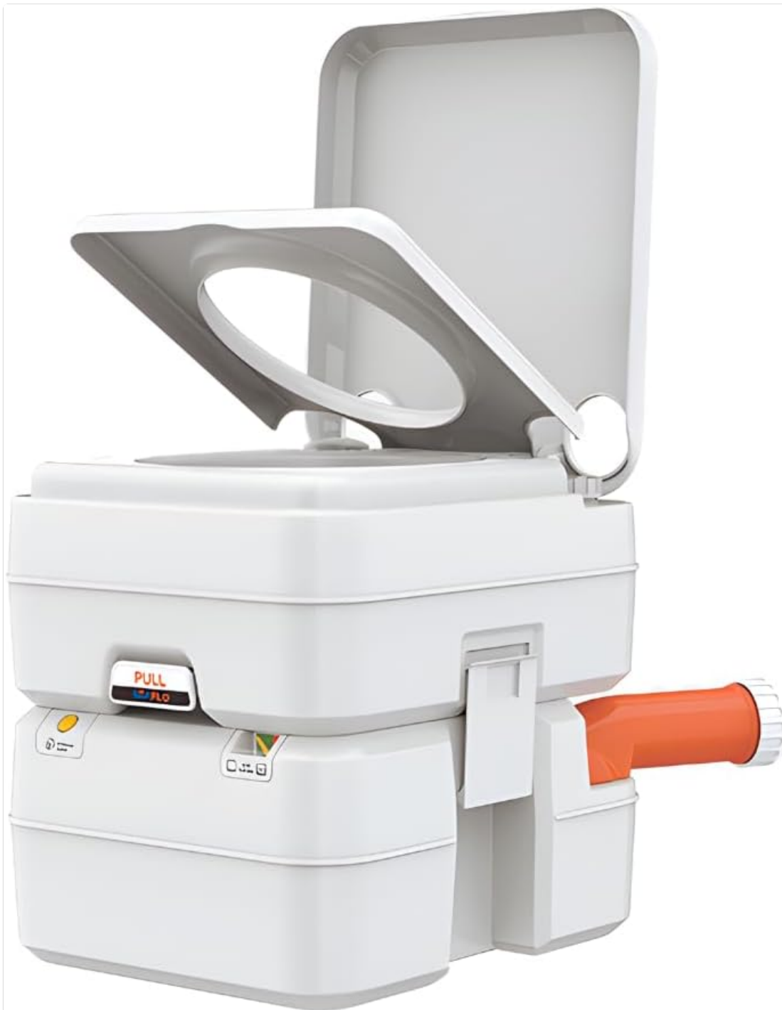
Figure 4.1: Portable toilet with the waste tank slide valve handle in the open position.