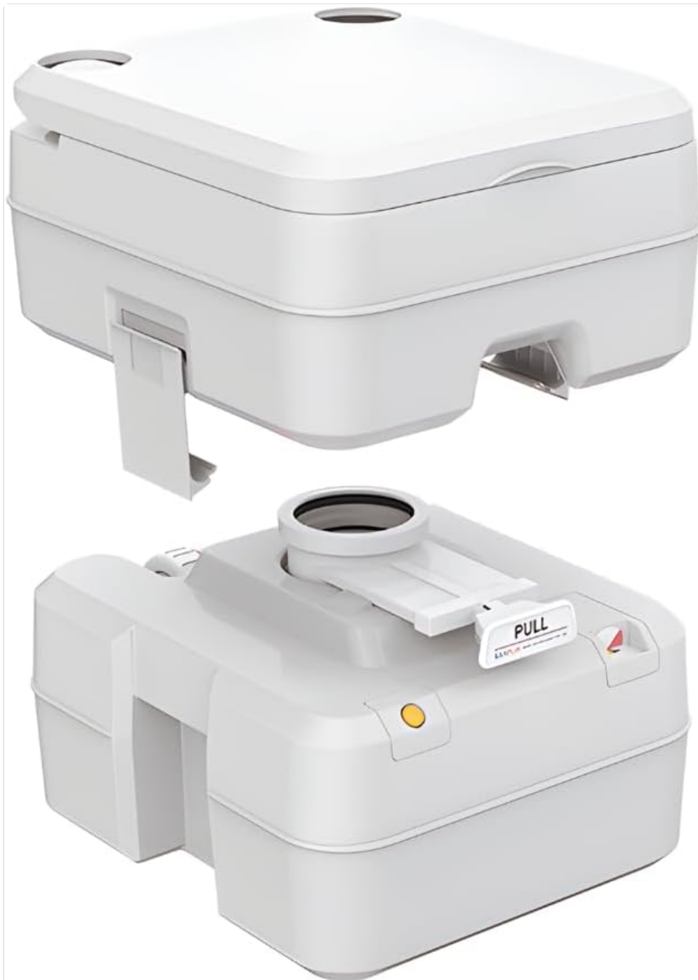
Figure 3.1: The portable toilet with its upper and lower sections separated for filling.