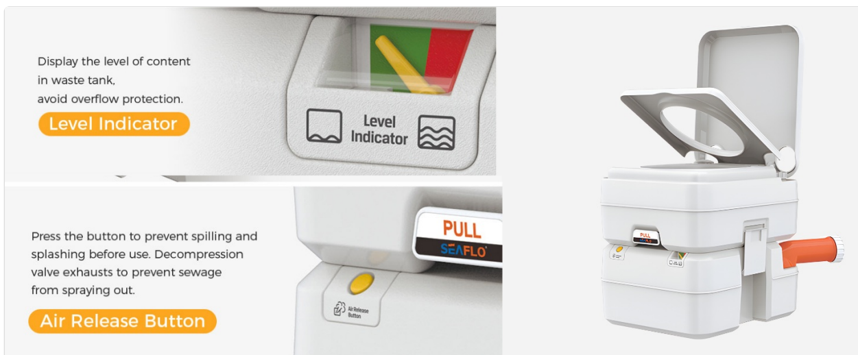
Figure 5.1: Waste level indicator and air release button for safe emptying.