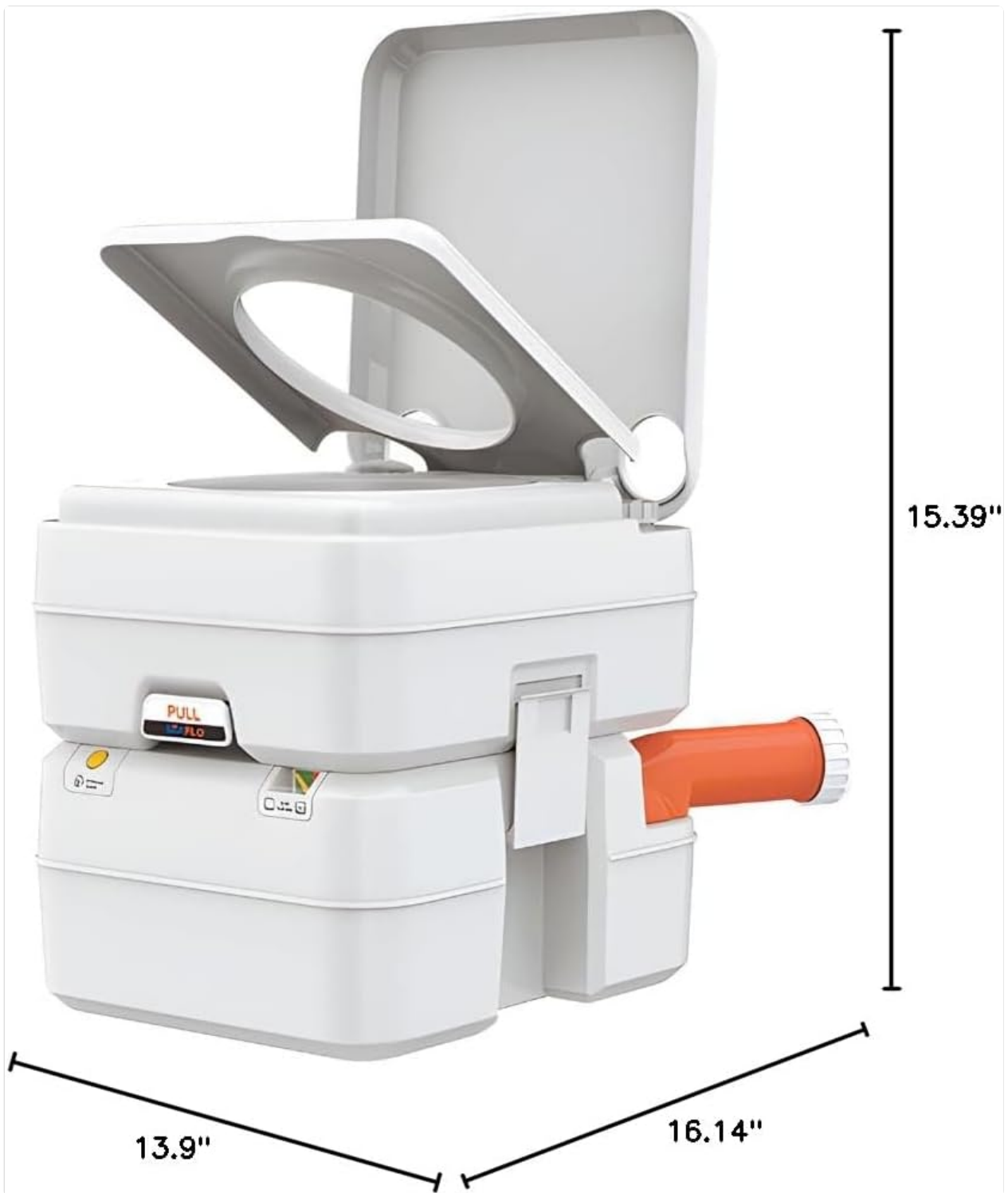
Figure 7.1: Product dimensions.