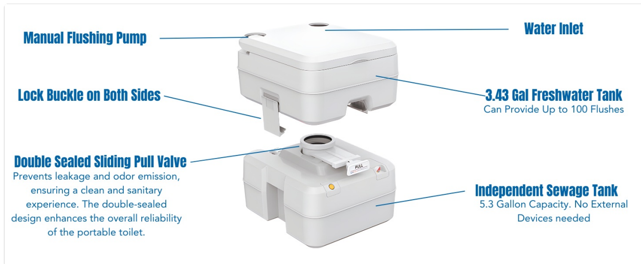
Figure 2.1: Exploded view showing the upper freshwater tank and lower sewage tank with labeled components.

The SEAFLO Portable Toilet is a self-contained unit consisting of two main parts: an upper freshwater tank and a lower waste holding tank. Key features include a manual flushing pump, a waste level indicator, an air release button, and a sealing slide valve to prevent odors.