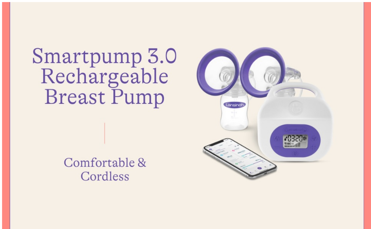
Image: Lansinoh Smartpump 3.0 with bottles and app on phone, highlighting its comfortable and cordless features.

The Lansinoh Smartpump 3.0 Double Electric Breast Pump is designed to support breastfeeding mothers with efficient and comfortable milk expression. This portable and rechargeable pump connects to the Lansinoh Baby App for tracking sessions and offers hospital-strength suction with customizable settings.