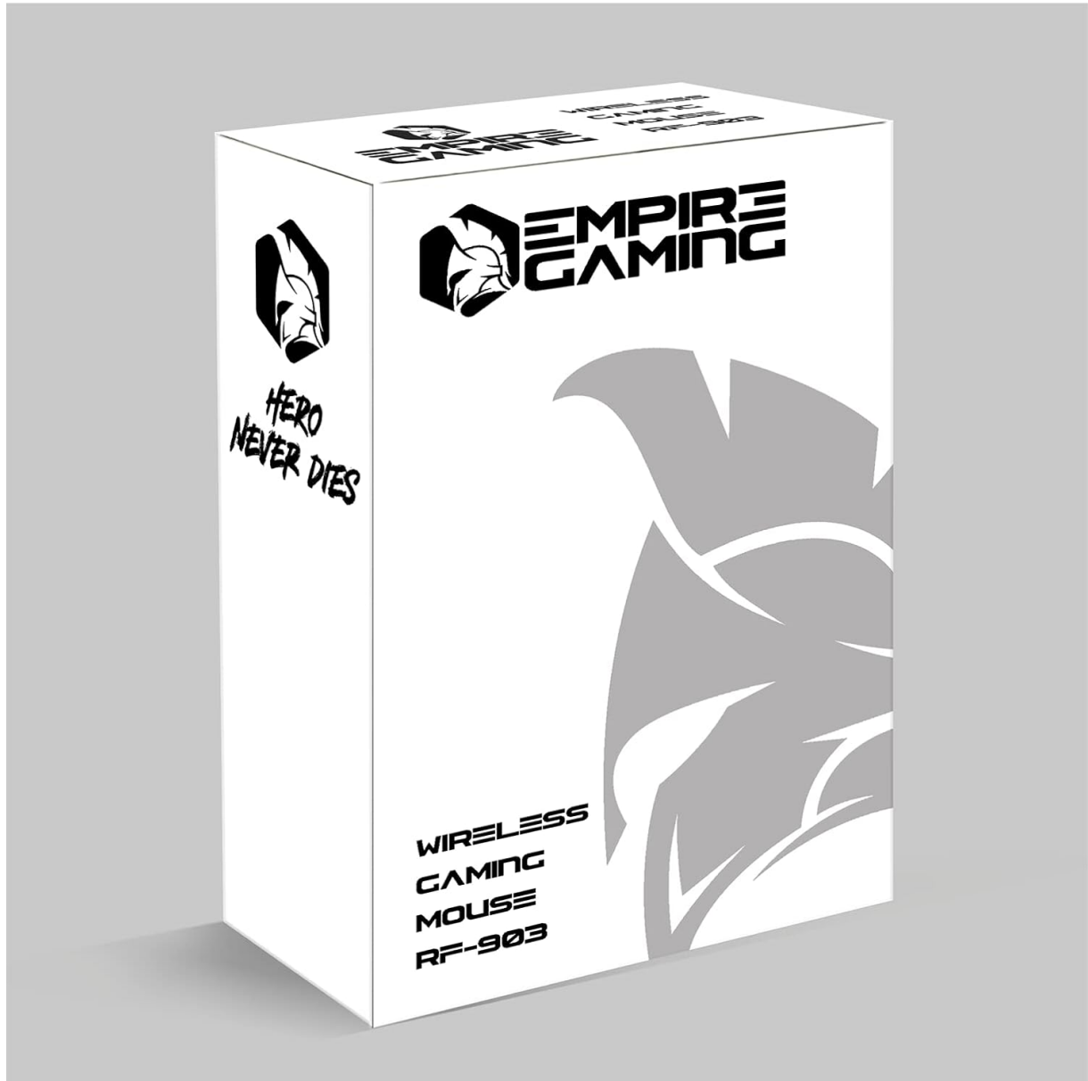
Image 2: The retail packaging for the EMPIRE GAMING RF903 Wireless Gaming Mouse.