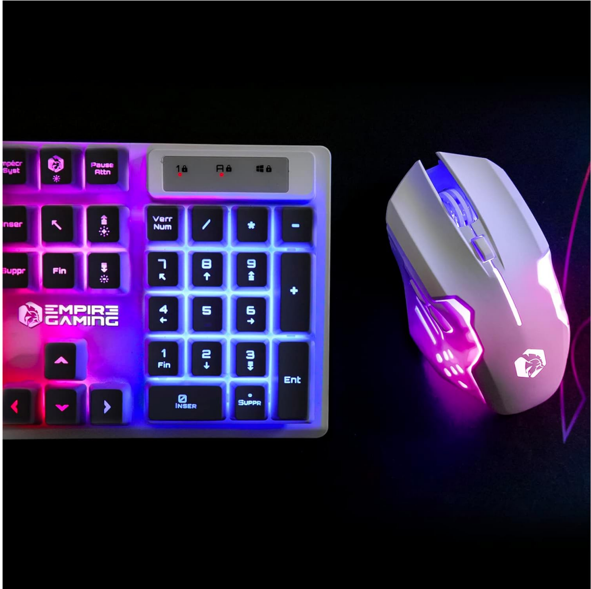
Image 5: The RF903 mouse illuminated with RGB lighting, positioned next to a matching RGB keyboard.

The RF903 features integrated RGB LED backlighting. To enable the lighting, ensure the power switch on the underside of the mouse is set to the "LED" position. The RGB lighting enhances the aesthetic of your gaming setup.