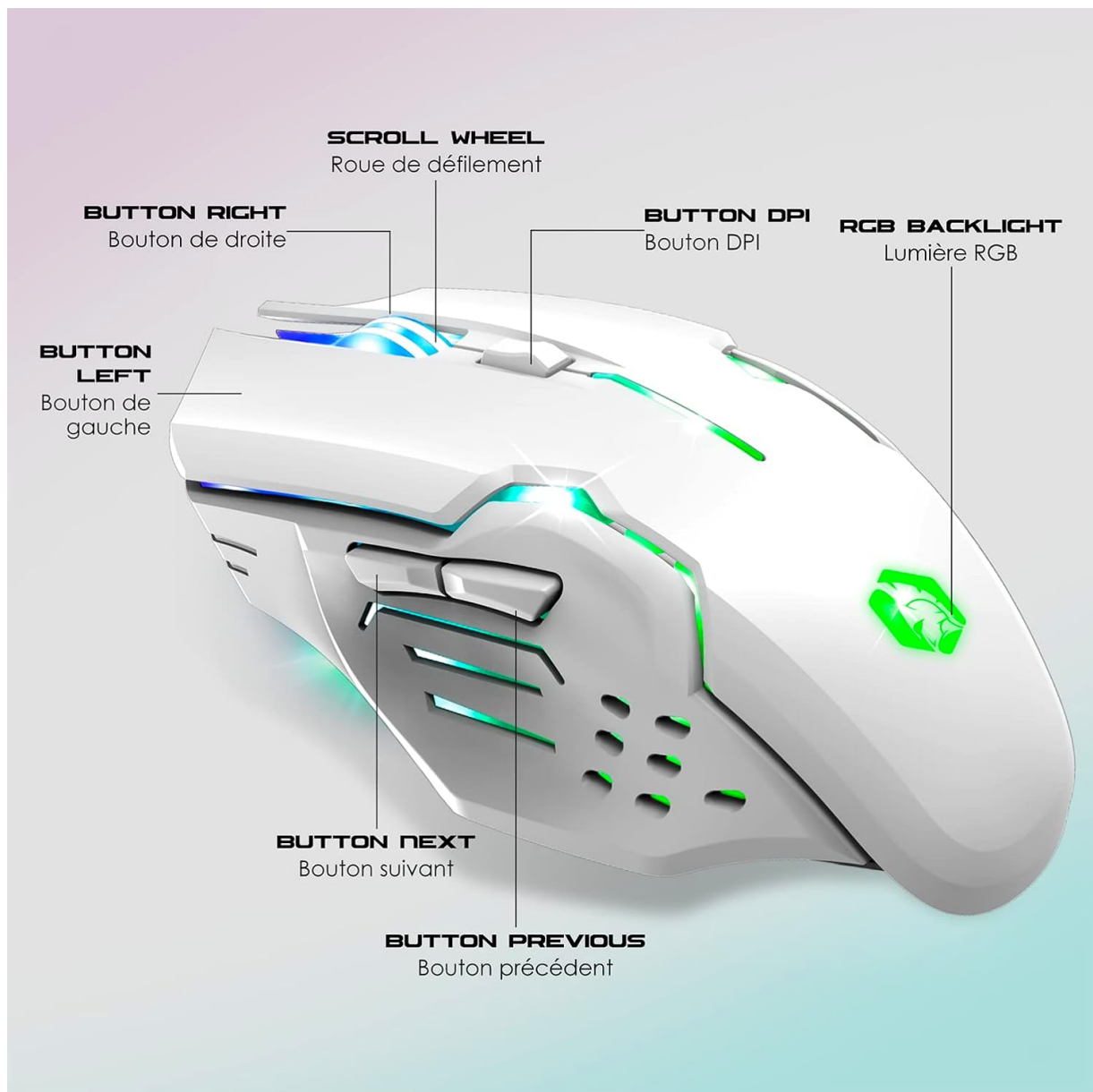
Image 3: Labeled diagram of the RF903 mouse, showing the Left Button, Right Button, Scroll Wheel, DPI Button, RGB Backlight, Next Button, and Previous Button.