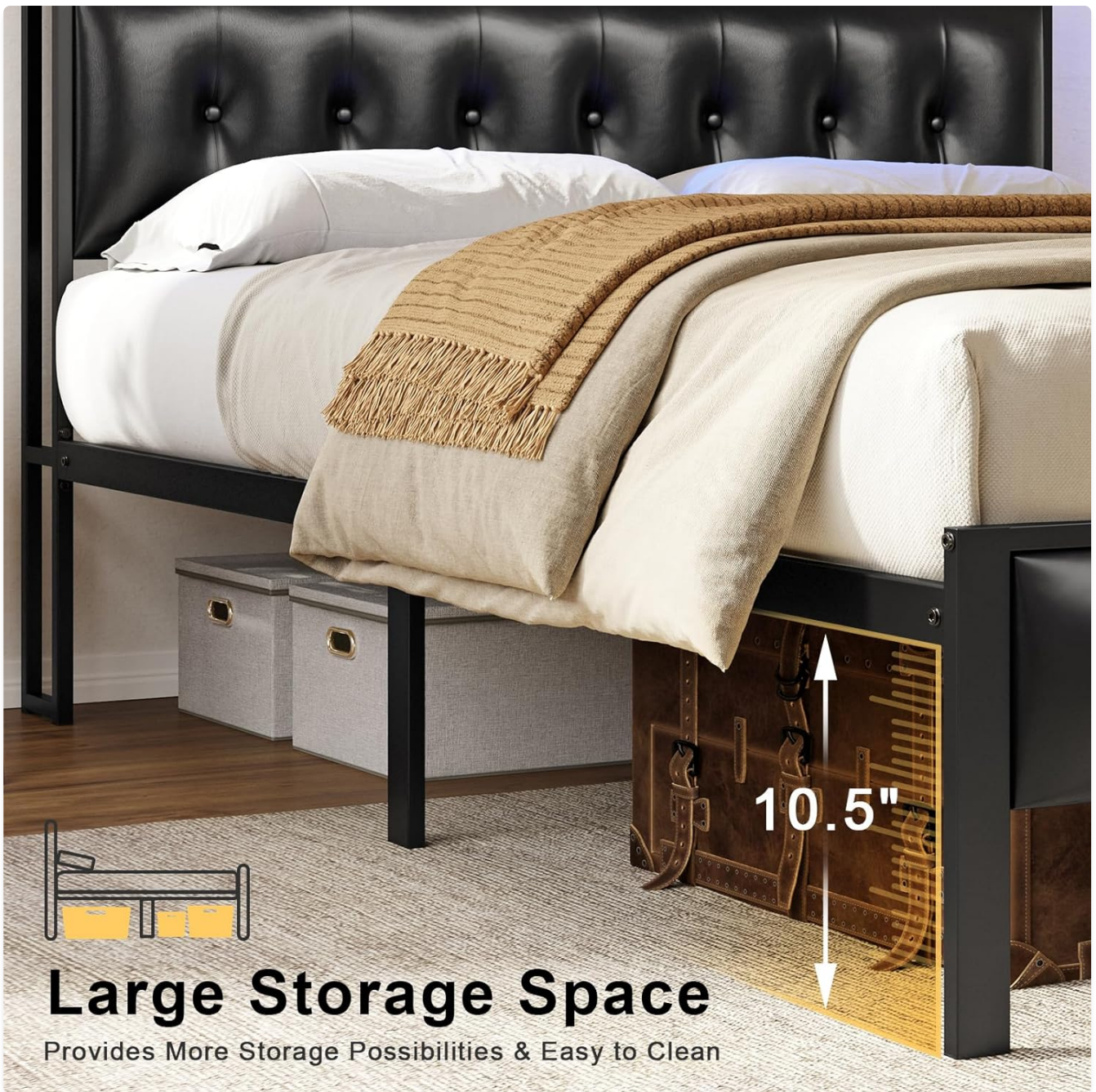
Figure 7: Under-bed storage space.