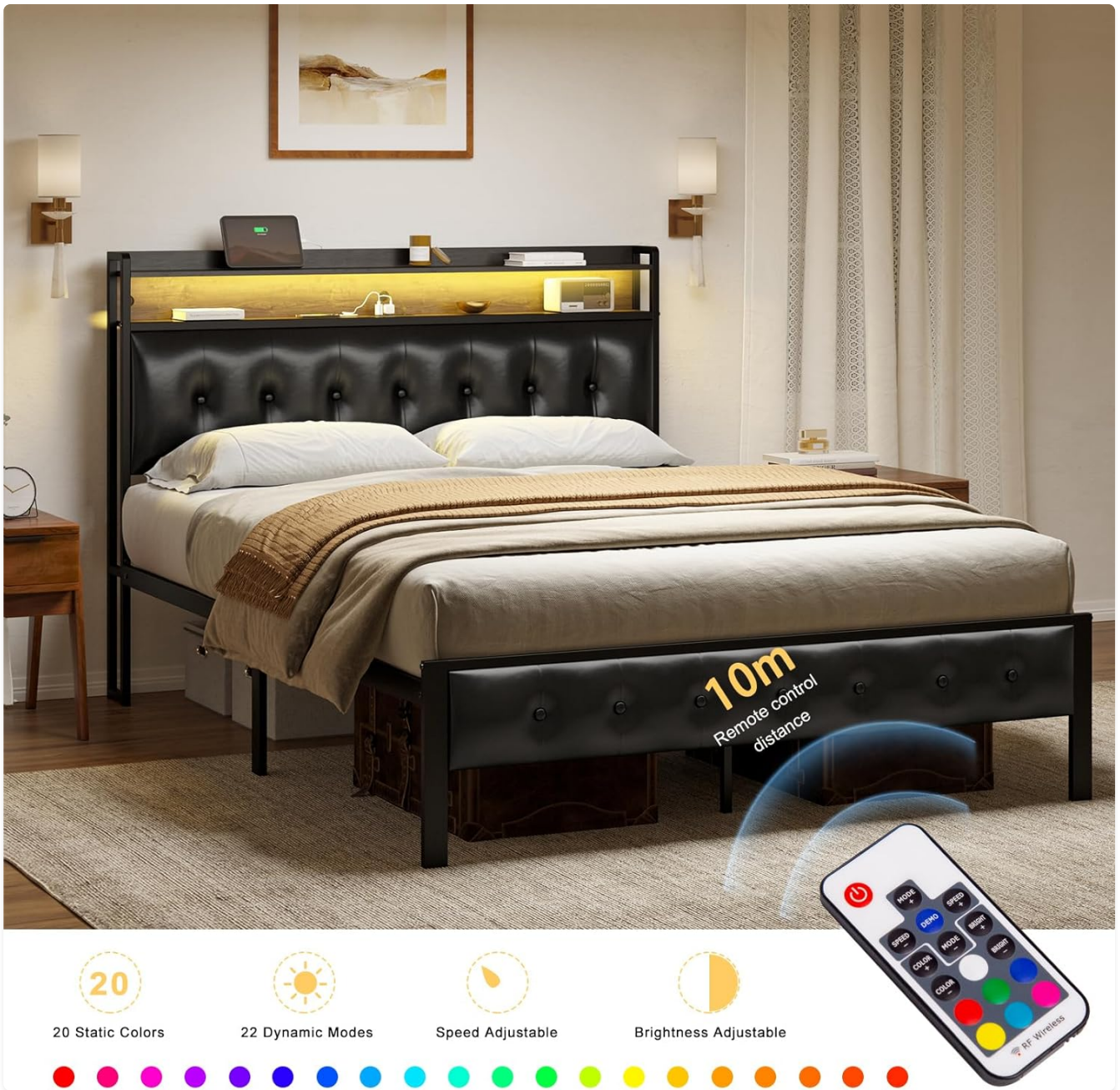
Figure 4: LED lighting features and remote control.