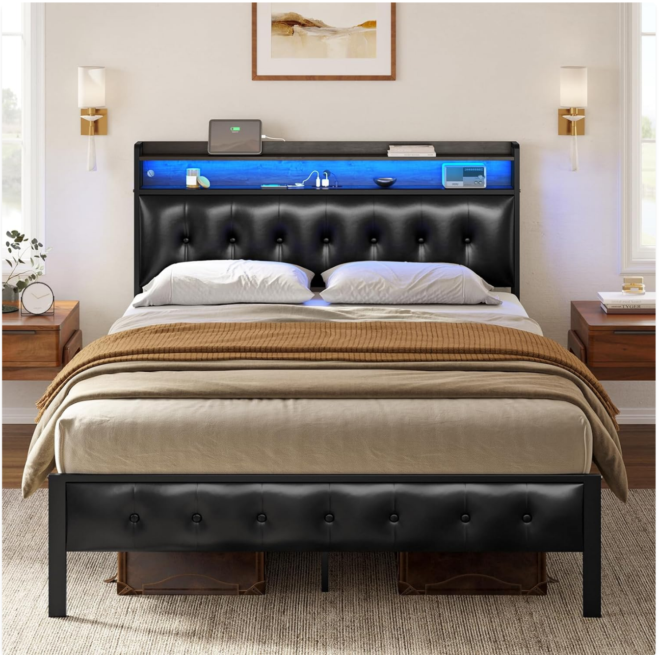
Figure 1: Overall view of the HAUSOURCE Queen Bed Frame with LED lights and charging station.