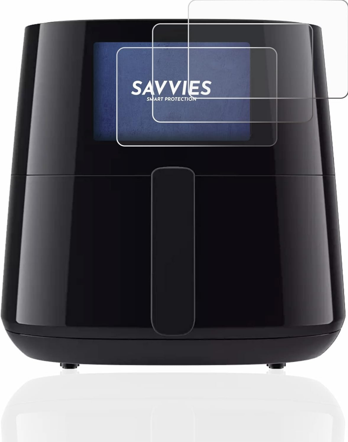
Image: A Philips Essential Airfryer XL HD927X with the Savvies screen protector successfully installed, showing clear visibility.