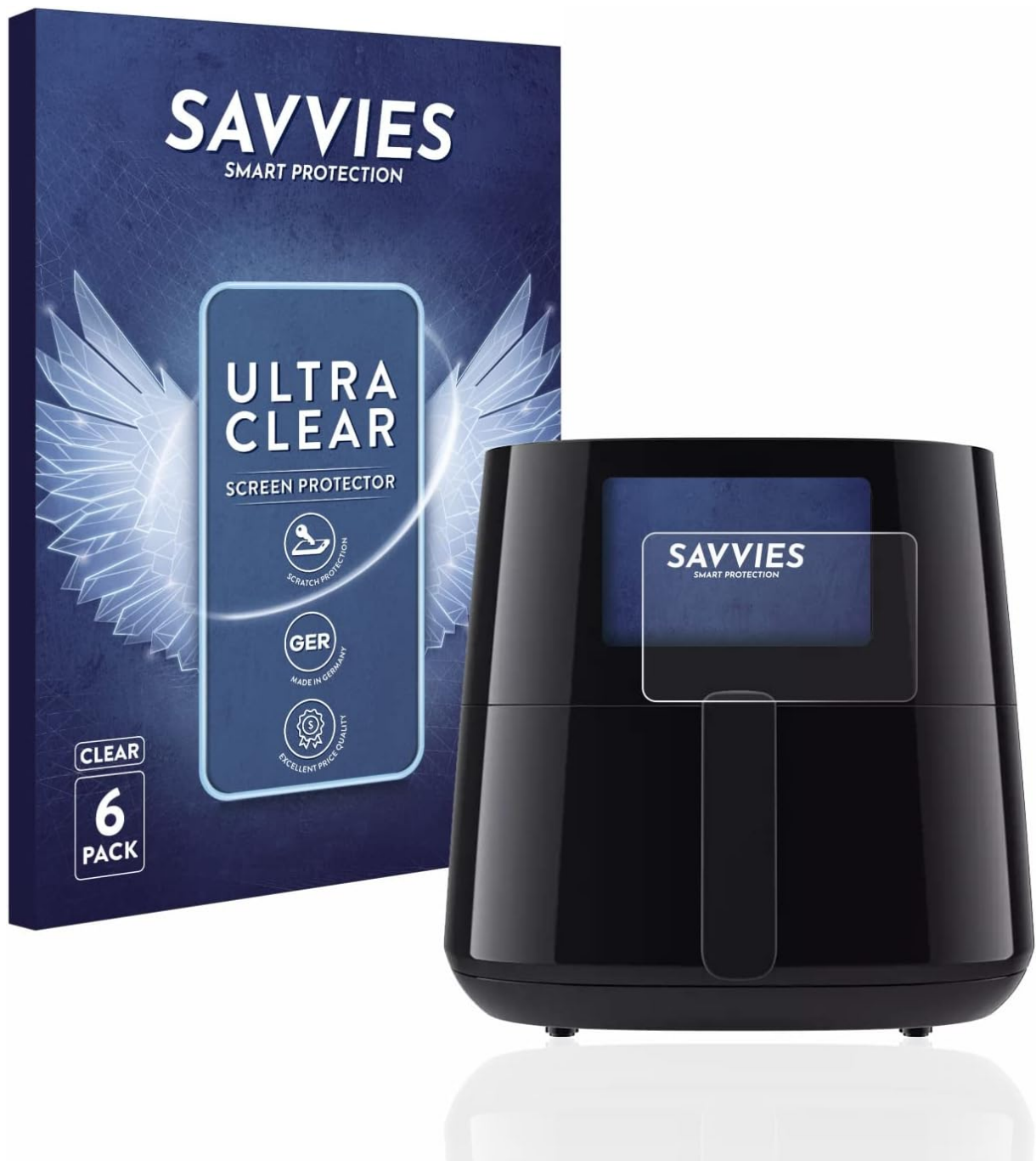
Image: The Savvies UltraClear Screen Protector packaging alongside a Philips Essential Airfryer XL HD927X with the protector installed.