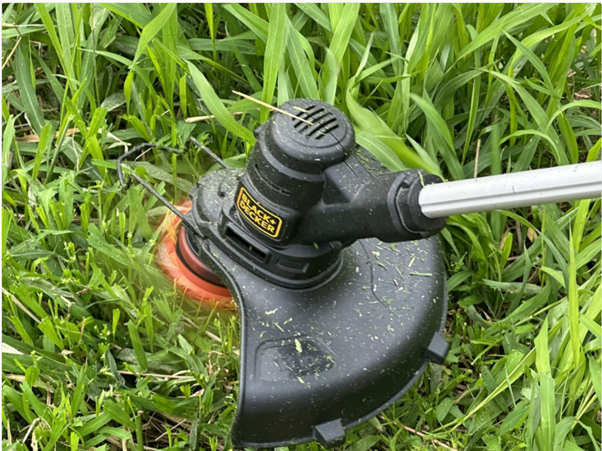
Figure 5: Visual guide for installation step 5.