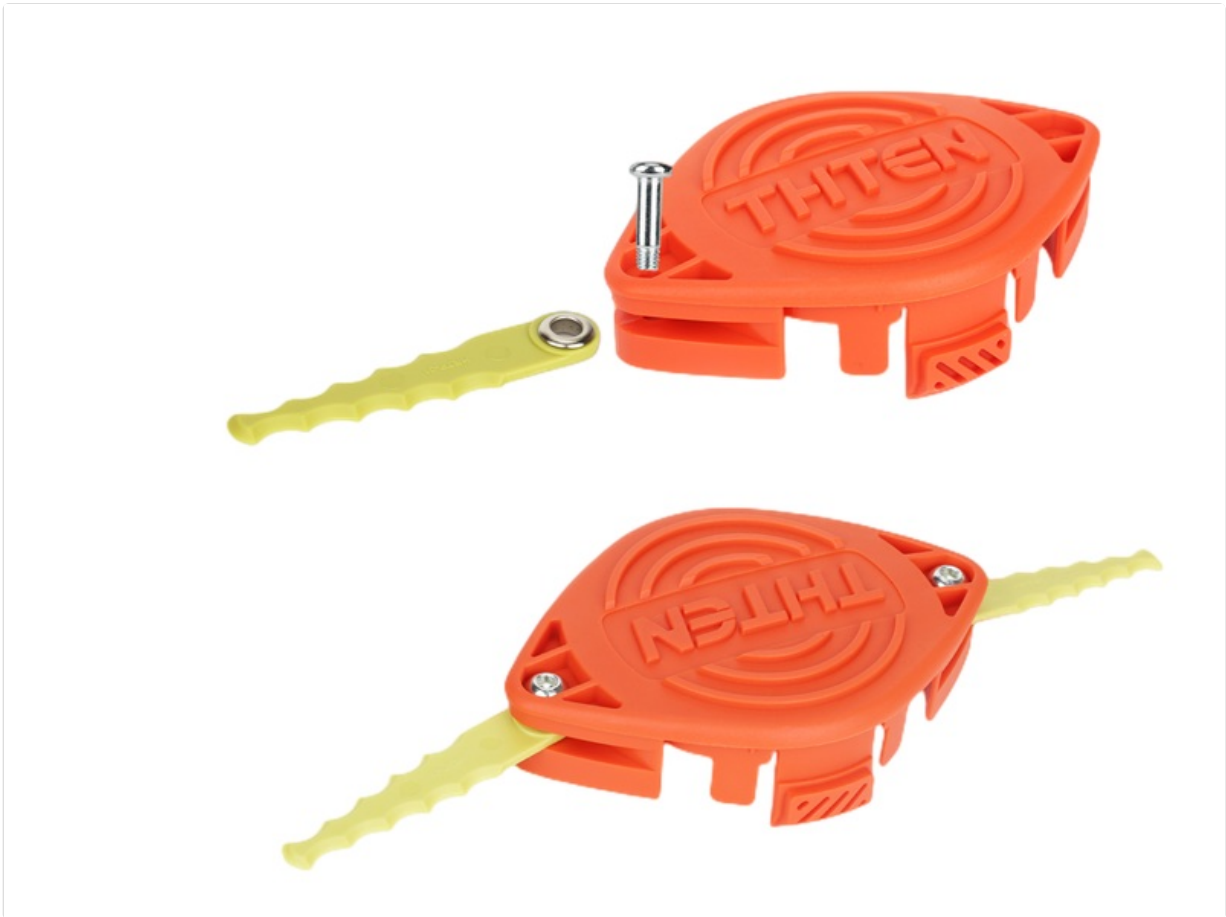
Figure 4: Visual guide for installation steps 1-4.