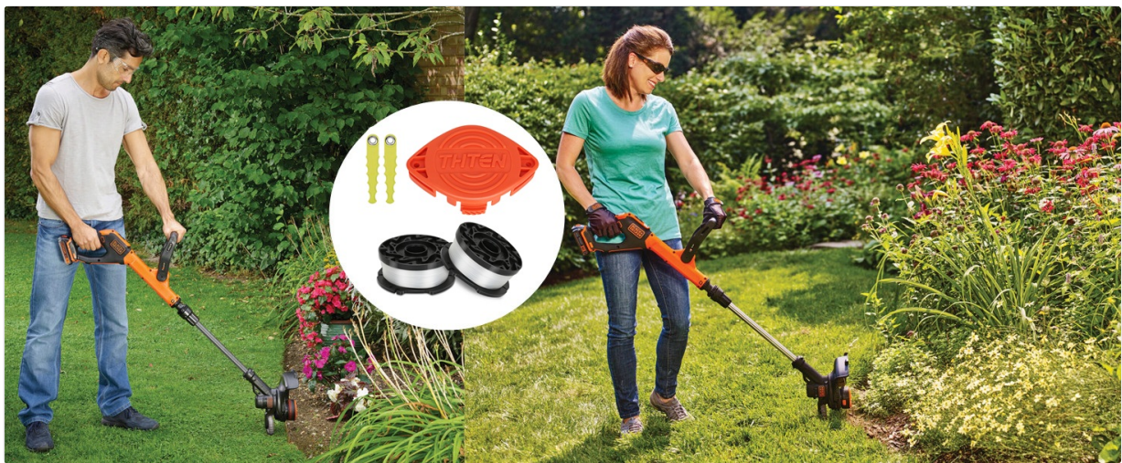
Figure 6: Trimmer in operation with THTEN AF-100 blades.