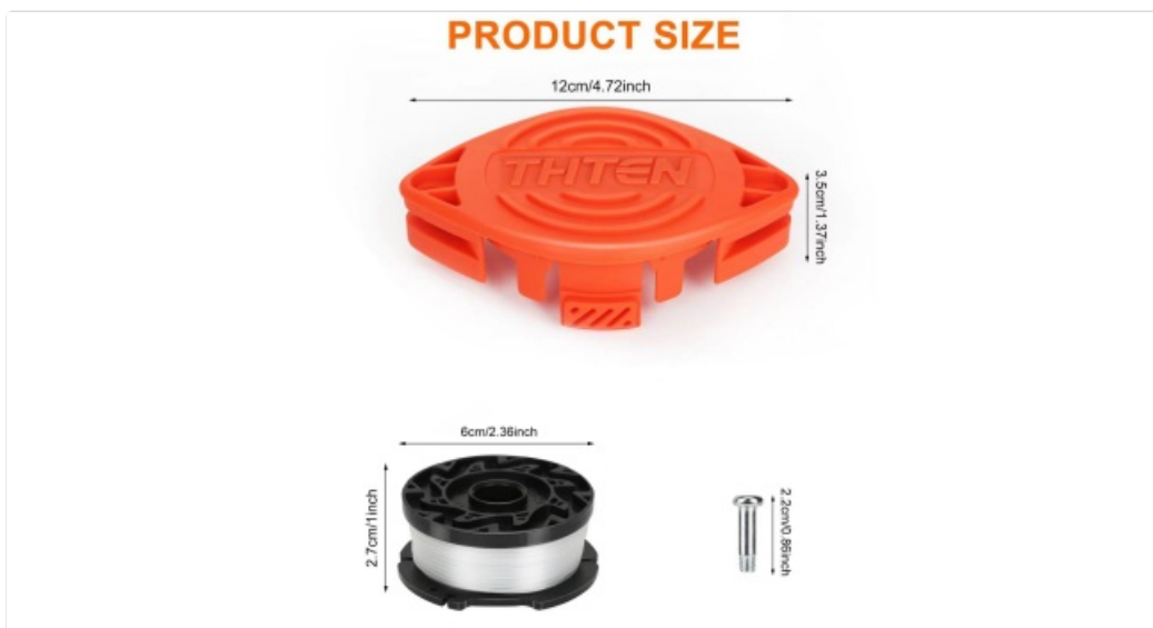
Figure 7: Product dimensions for THTEN AF-100 blades.