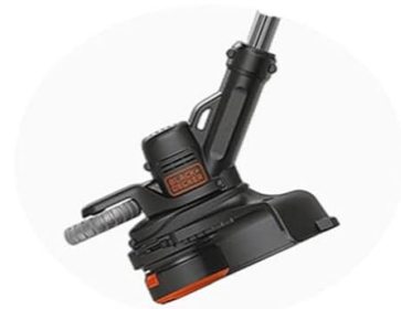
Figure 1: Front view of THTEN AF-100 Trimmer Replacement Blades.