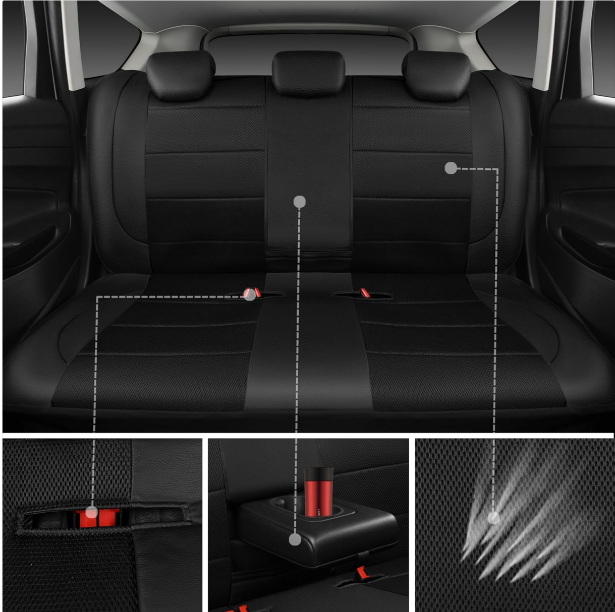
Image 3.1: Key features of the seat cover, including zipper access and breathable material.