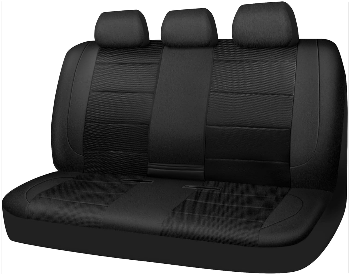
Image 1.1: The CAR PASS Universal Leather Back Seat Cover in black.