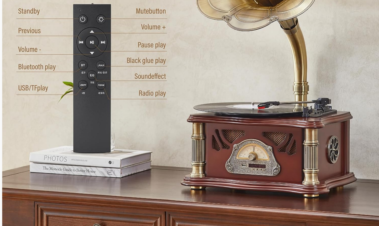
Figure 4: The included remote control for convenient operation.

Remote control is more intelligent When you enjoy a leisurely home life Bringing you a more relaxed adjustment method Convenient and fast