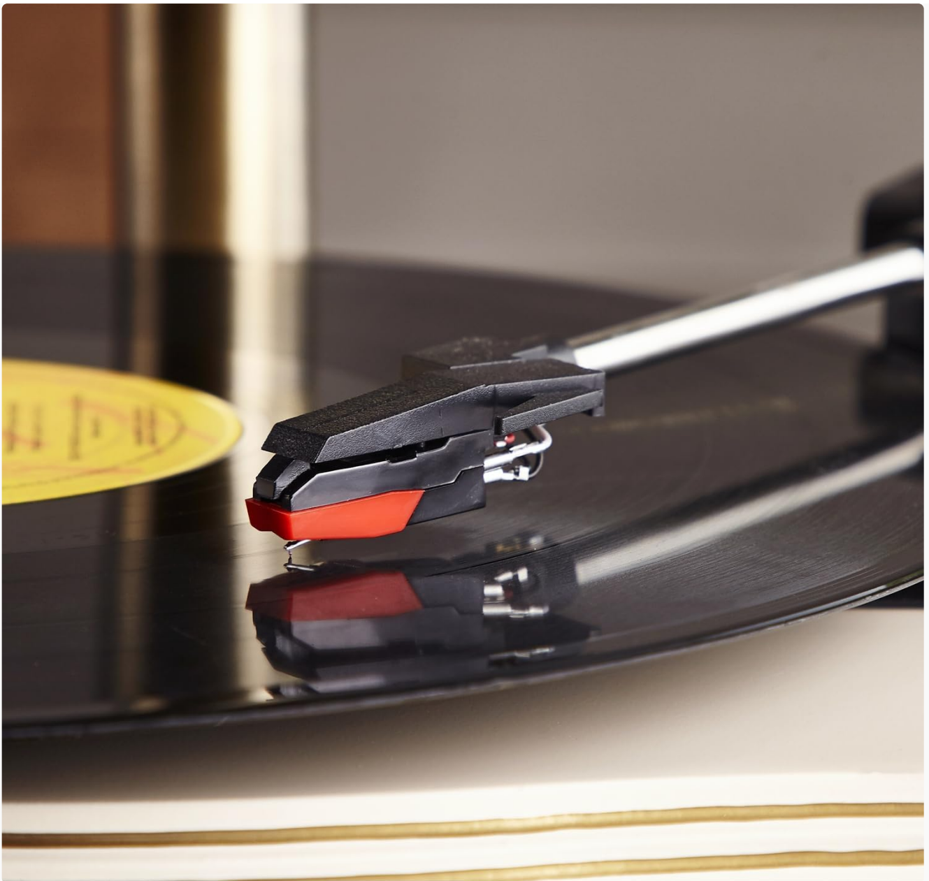
Figure 5: Close-up of the record player's stylus.