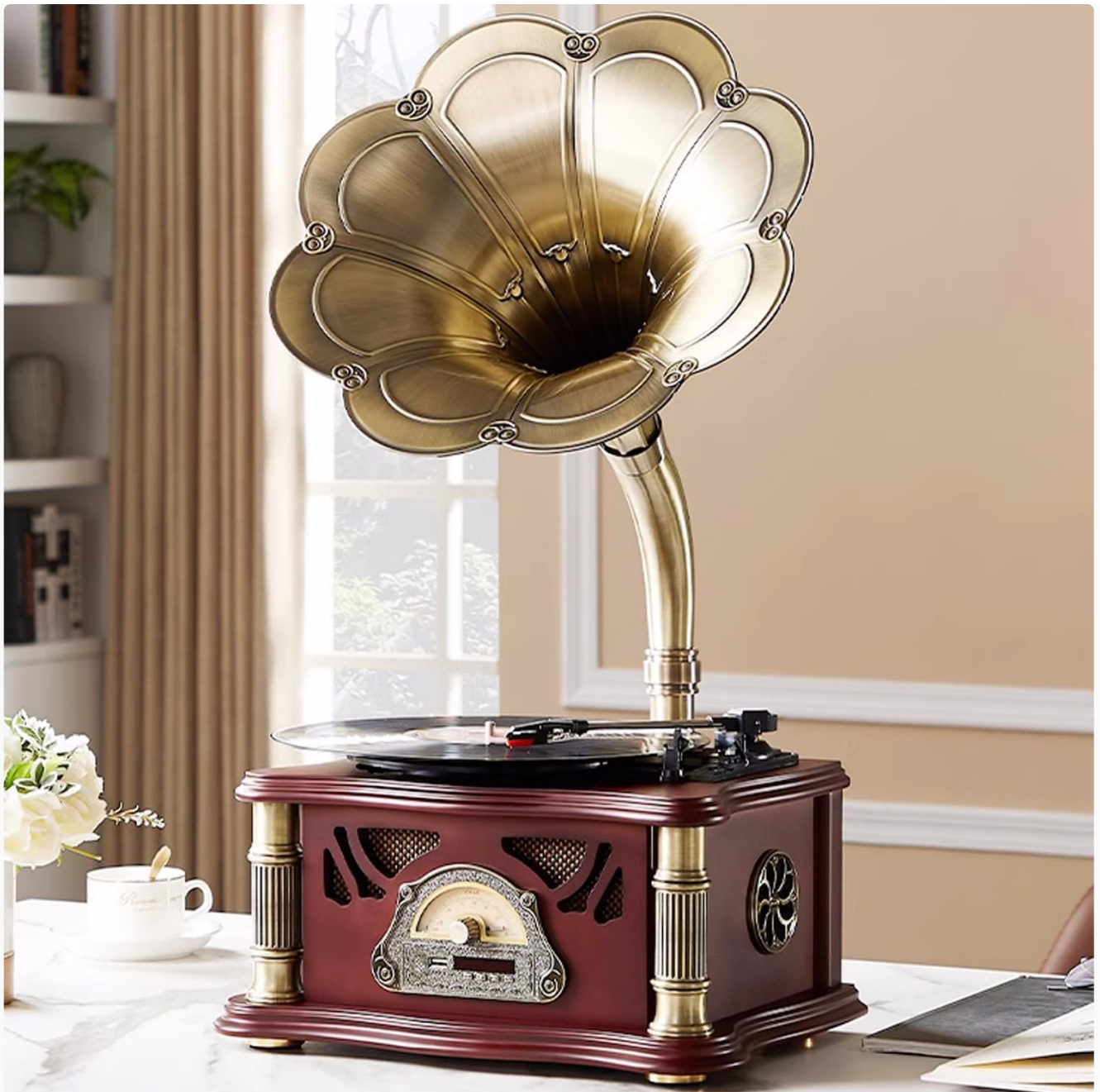
Figure 1: The HZLSBL Vintage Gramophone in a home environment.

Your browser does not support the video tag.