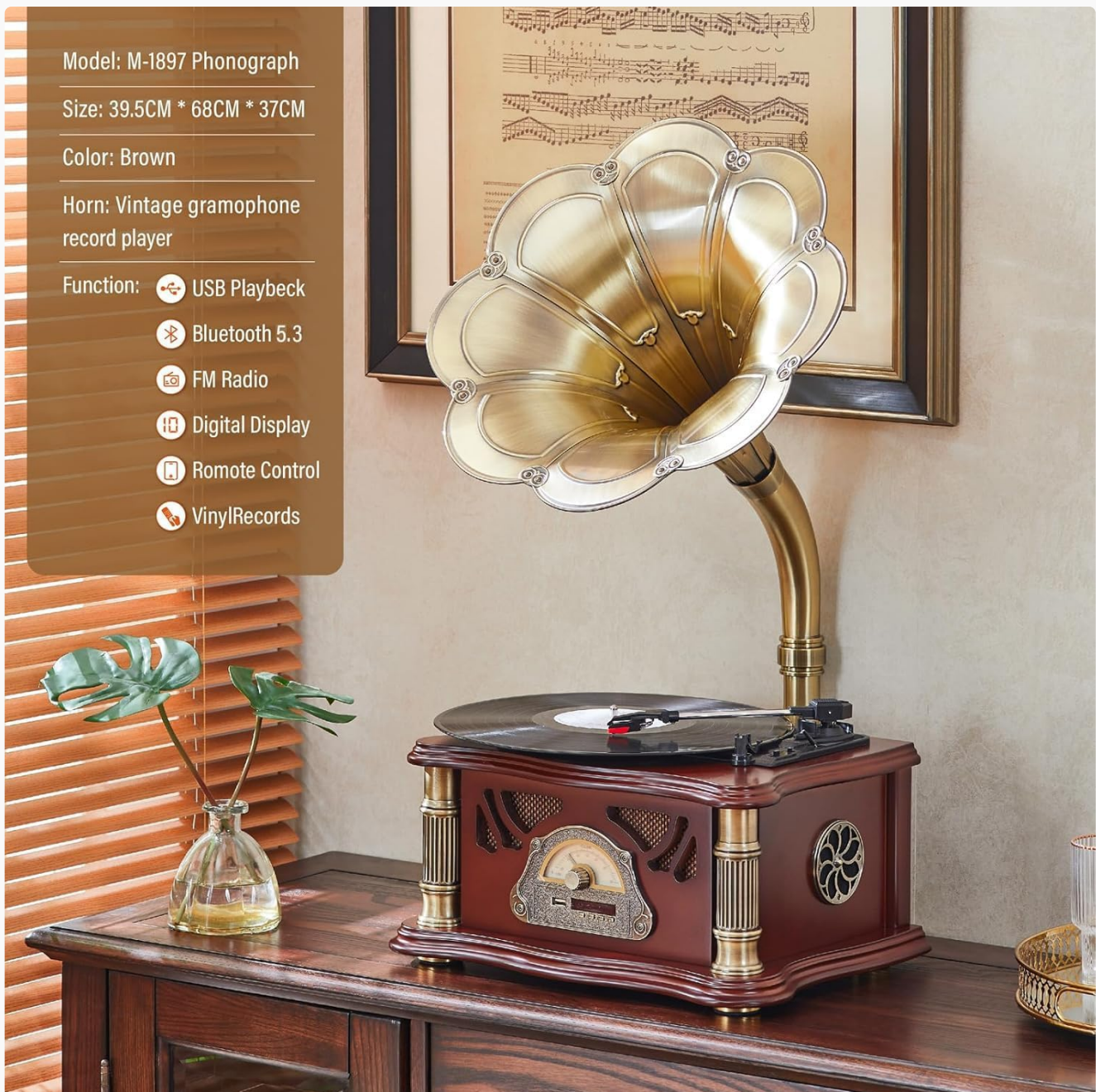
Figure 6: Key features and dimensions of the gramophone.