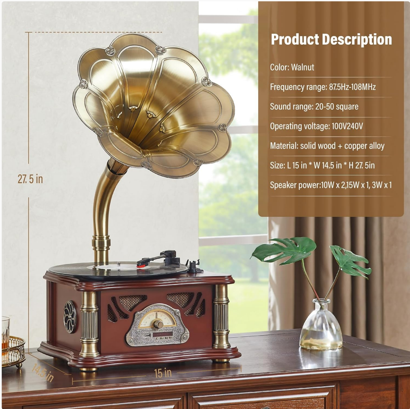
Figure 7: Detailed product specifications.