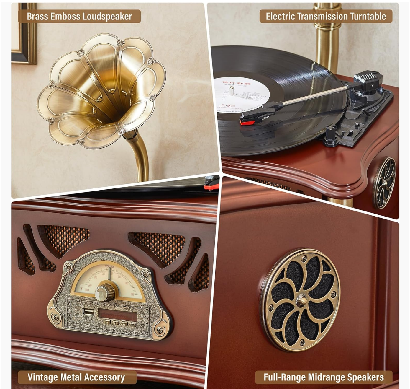
Figure 2: Detailed view of the control panel, turntable, and horn.