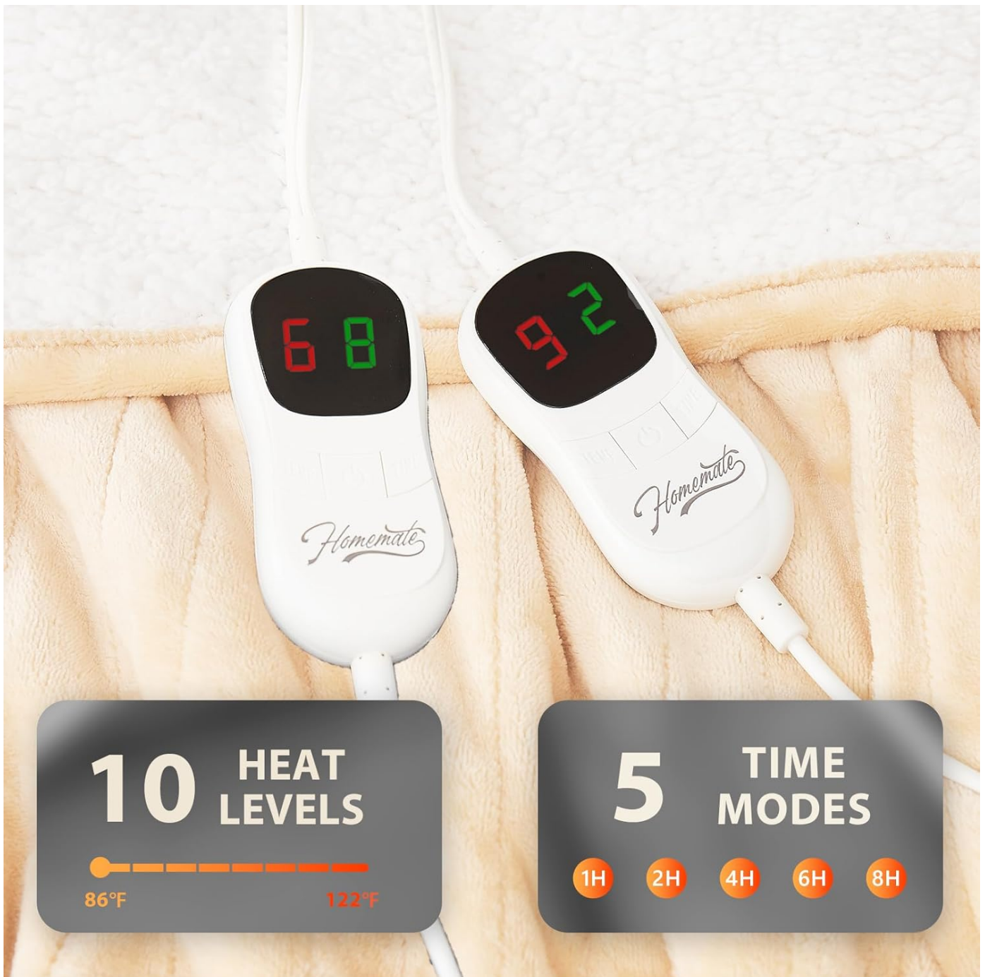
Image: A close-up of the Homemate Electric Blanket controllers, displaying the 10 heat levels and 5 time modes (1H, 2H, 4H, 6H, 8H).

Your browser does not support the video tag.