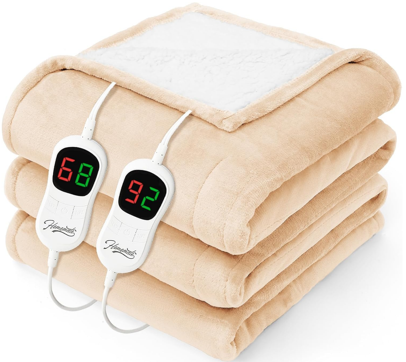
Image: A beige Homemate Electric Blanket folded, showing two controllers connected, ready for setup.