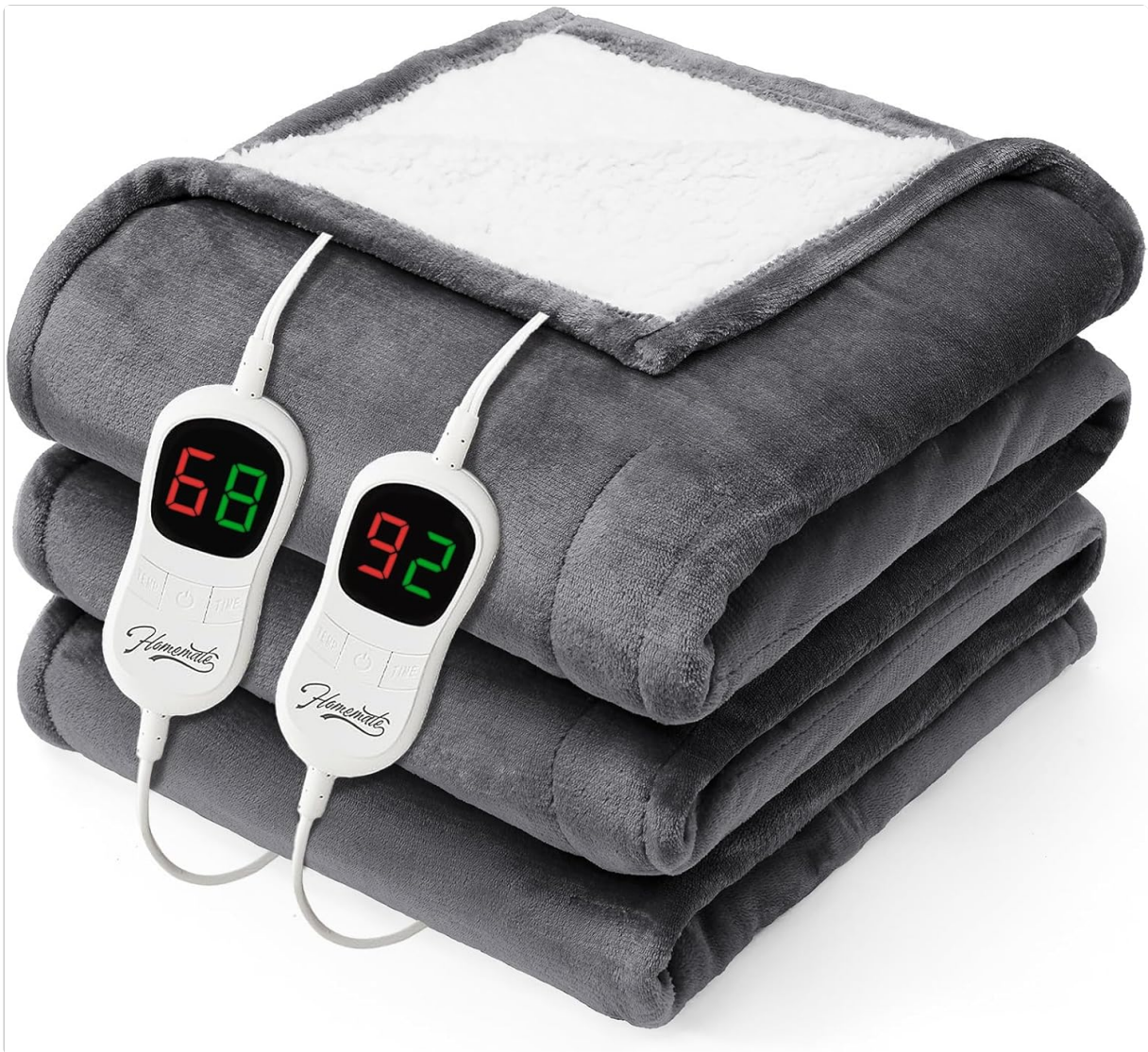
Figure 1: Homemate Heated Electric Blanket (King Size) with dual controllers.