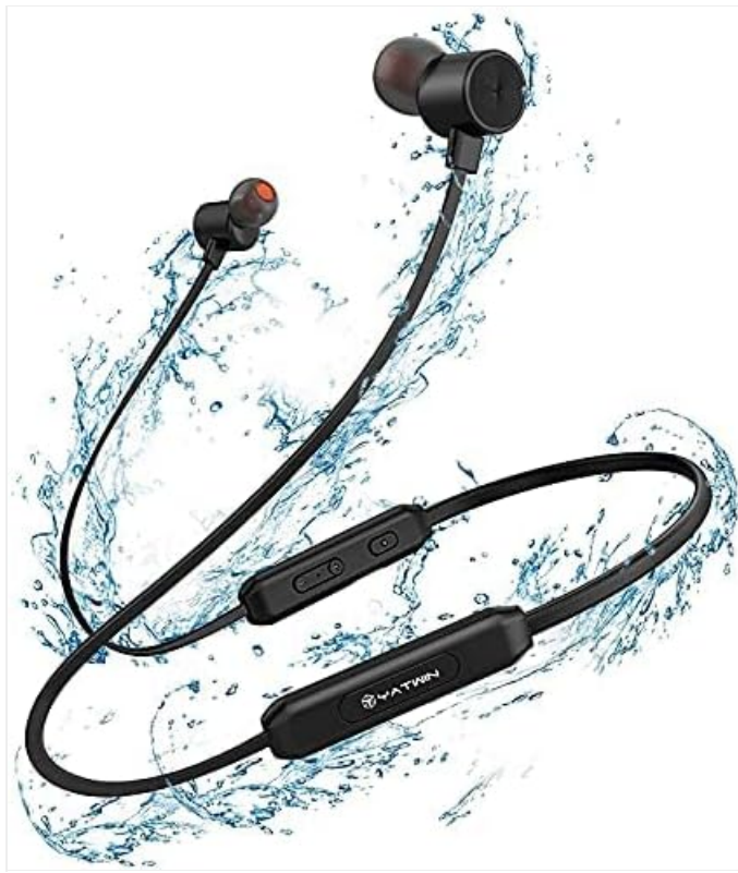
Image Description: The YATWIN Bluetooth Headphones are shown amidst splashes of water, highlighting their IPX7 waterproof rating. The black neckband-style headphones feature in-ear buds with red accents, and the control module is visible on the neckband.