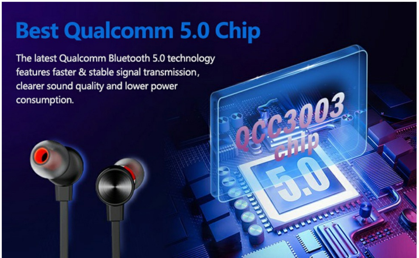
Image Description: A technical diagram showcases the internal components of the YATWIN headphones, specifically highlighting the Qualcomm Bluetooth 5.0 chip. This illustrates the advanced connectivity and sound processing capabilities.

The latest Qualcomm Bluetooth 5.0 technology features faster & stable signal transmission, clearer sound quality and lower power consumption.