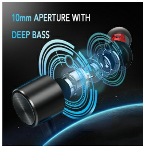
Image Description: A cutaway diagram illustrates the internal structure of the headphone's earbud, highlighting the "10mm Aperture with Deep Bass" feature, indicating the driver size responsible for rich audio output.