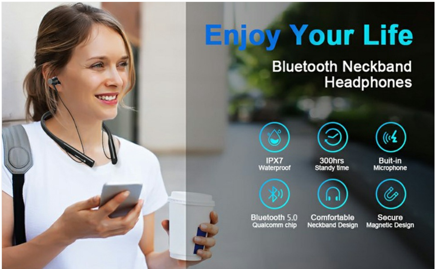
Image Description: A woman is shown smiling and enjoying music while wearing the YATWIN Bluetooth Headphones. Surrounding her are icons representing key features: IPX7 Waterproof, 300 hours Standby Time, Built-in Microphone, Bluetooth 5.0 Qualcomm chip, Comfortable Neckband Design, and Secure Magnetic Design.