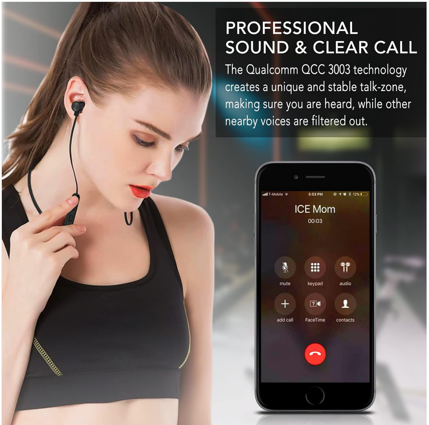
Image Description: A woman is shown on a phone call, wearing the YATWIN Bluetooth Headphones. A smartphone screen displaying a call interface is visible, illustrating the clear call quality provided by the built-in microphone.

The Qualcomm QCC 3003 technology creates a unique and stable talk-zone, making sure you are heard, while other nearby voices are filtered out.