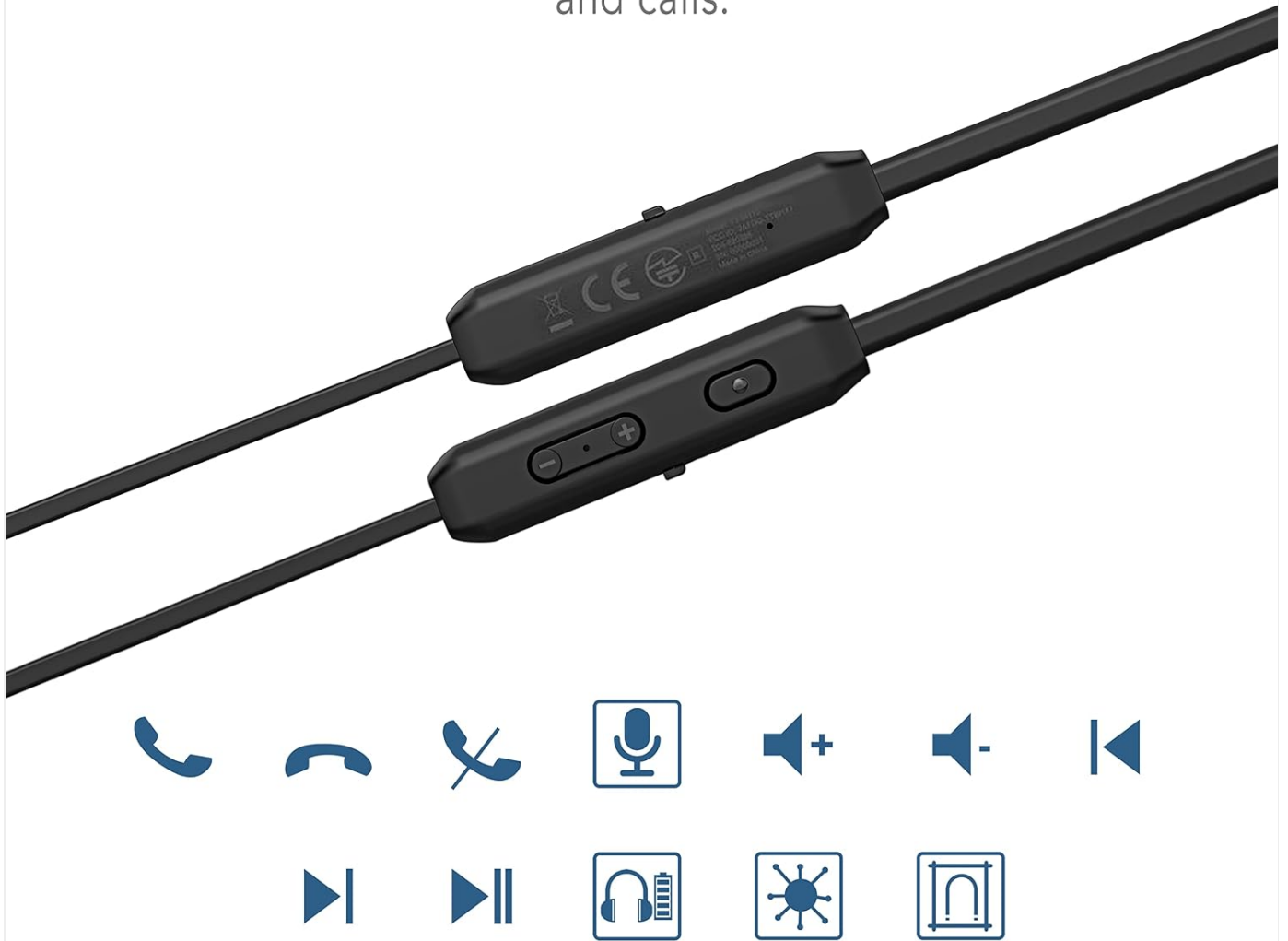
Image Description: A close-up view of the inline 3-button remote control on the YATWIN Bluetooth Headphones. The buttons are clearly visible, indicating easy control over music playback and calls.

Use the 3-buttons remote to effortlessly control your music and calls.