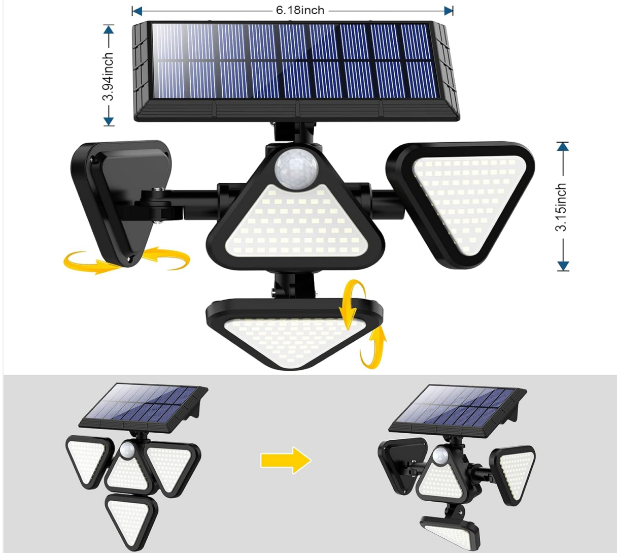
Image: The ZOOKKI Solar Motion Light, Model BS-C4, showcasing its four adjustable LED heads and integrated solar panel.

The solar panel cannot be rotated when leaning on the wall