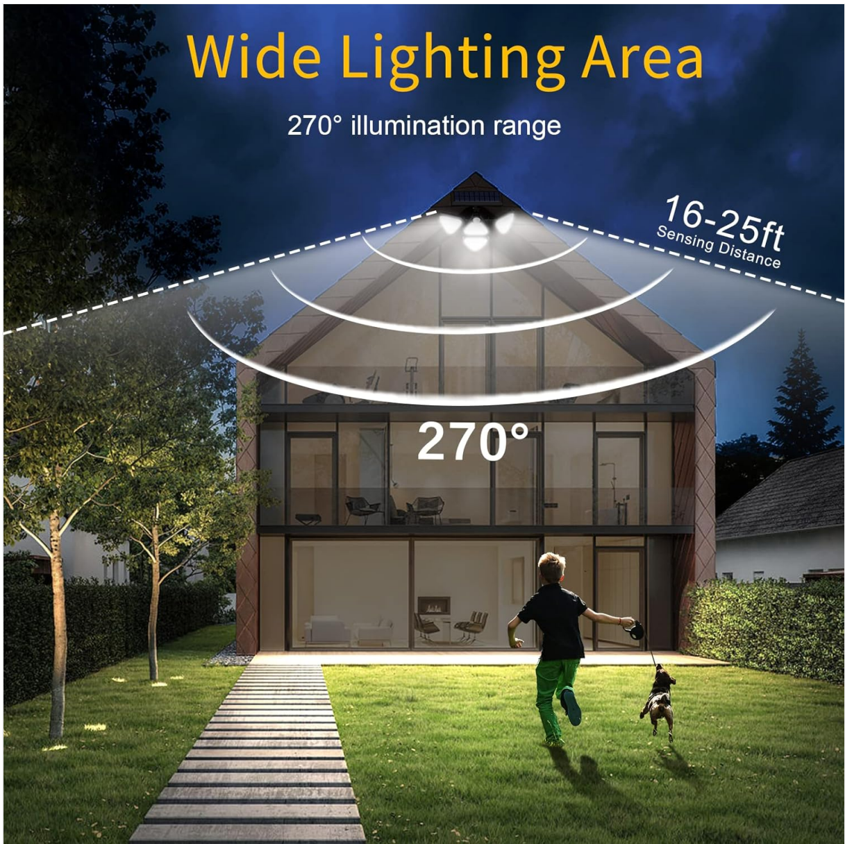
Image: Illustration demonstrating the 270° wide-angle illumination provided by the adjustable light heads, covering a sensing distance of 16-25 feet.