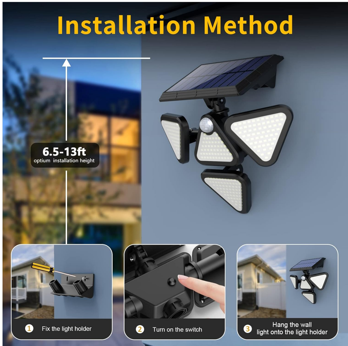
Image: Visual guide for installation: 1) Fix the light holder, 2) Turn on the switch, 3) Hang the wall light onto the light holder.

7. Adjust Light Heads: Adjust the four light heads to direct illumination to your desired areas.