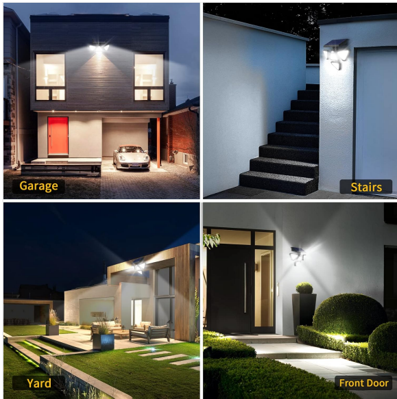
Image: The solar light effectively illuminates areas such as a garage, outdoor stairs, a backyard, and a front door entrance, enhancing security and visibility.