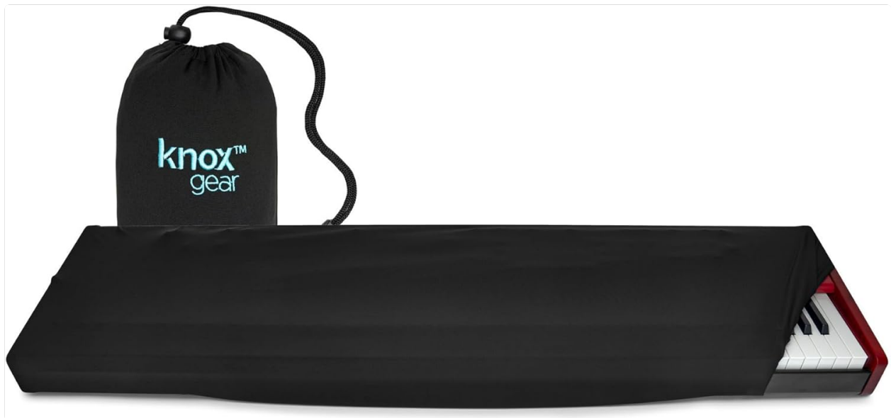
Image: The Knox Gear 88-Key Keyboard Stretchy Spandex Dust Cover in black, designed to protect the keyboard from dust.

Regularly wipe down the keys and control surfaces to prevent dust and grime buildup. The included Knox Gear 88-Key Keyboard Stretchy Spandex Dust Cover should be used when the keyboard is not in use to protect it from dust and spills.