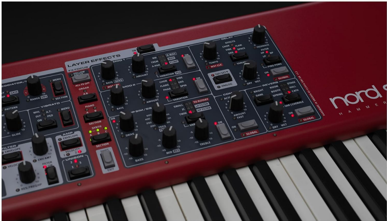
Image: Close-up view of the Layer Effects section on the Nord Stage 4, showing various controls and LED indicators.