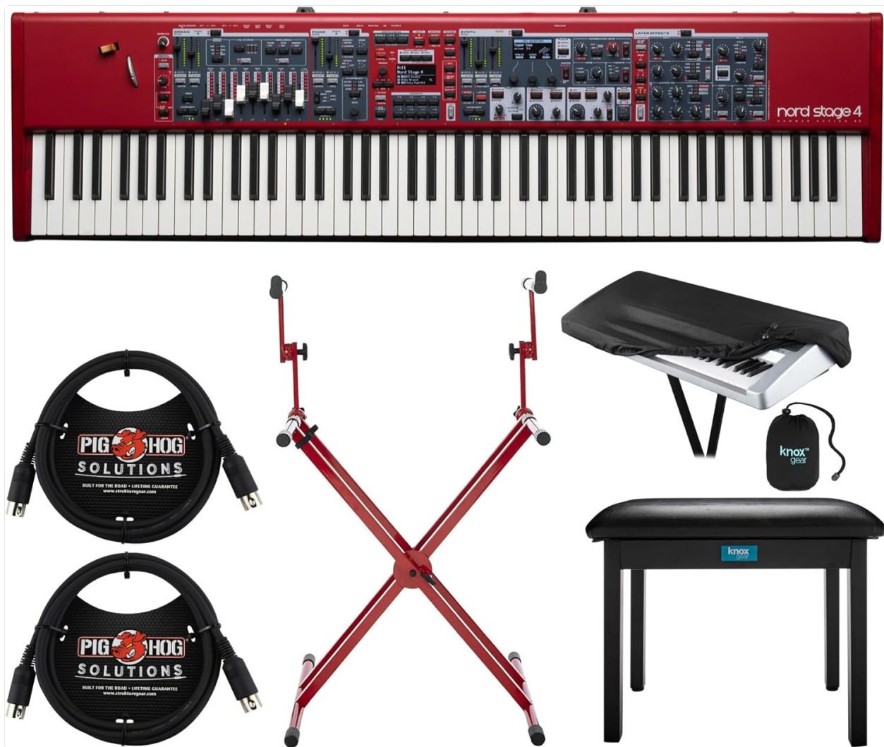
Image: Complete Nord Stage 4 88-Key Keyboard bundle, including the keyboard, stand, bench, MIDI cables, and dust cover.