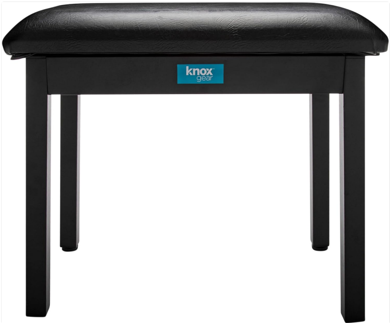
Image: The Knox Gear Furniture Style Flip-Top Piano Bench in black, providing comfortable seating for playing. Utilize the cable management clips on the stand to keep your setup tidy and prevent accidental disconnections.