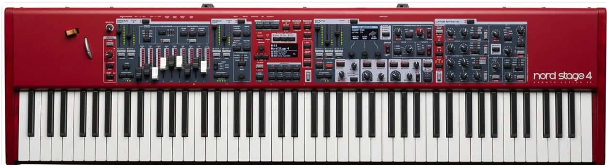
Image: Front view of the Nord Stage 4 88-Key Fully-Weighted Keyboard, showcasing its control panel and 88 keys. The Layer Scene feature allows for quick transitions between two different sound configurations, enhancing performance versatility.

The Nord Stage 4 features a redesigned panel for intuitive control. Dedicated LED faders provide visual feedback for each layer, simplifying sound creation and live performance adjustments. The new Preset Library offers a vast collection of pre-configured Piano, Synth, and Organ sounds for immediate use.