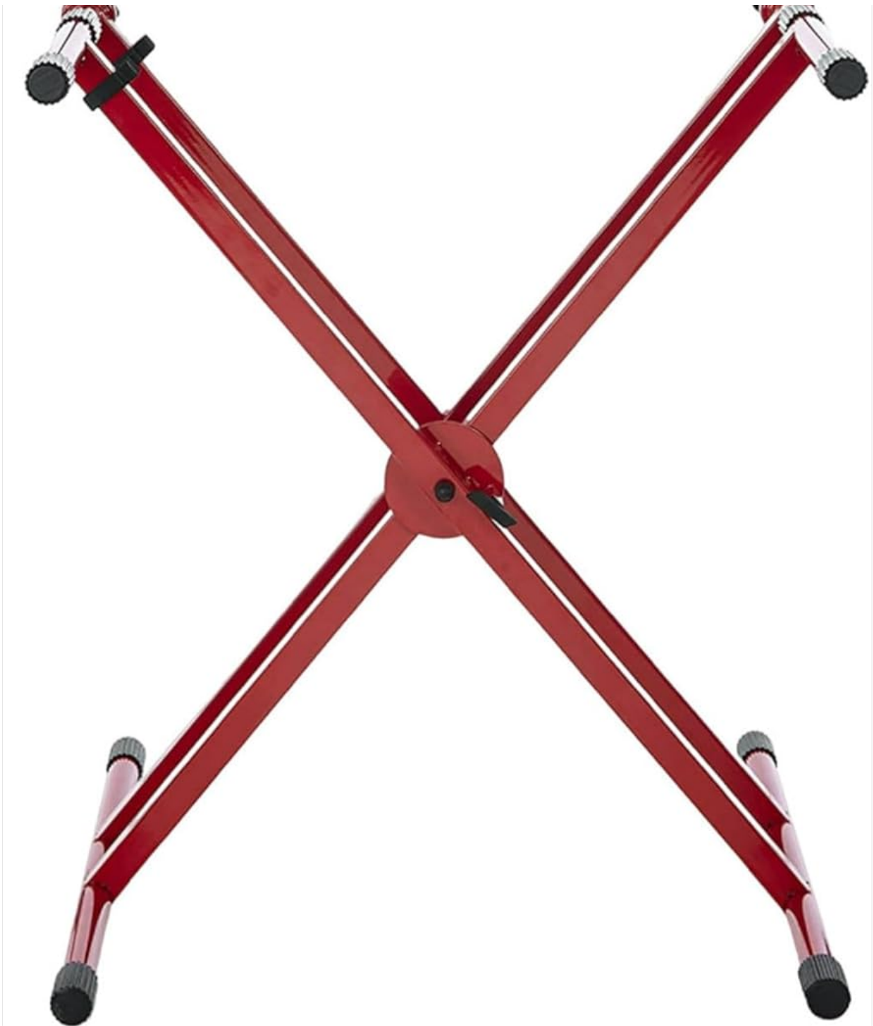
Image: The GFW-KEY-5100XRED Deluxe Two Tier X Frame Stable Keyboard Stand in bright red finish. This stand features rubberized gripping feet and a secure quick height adjustment system.

The keyboard stand features rubberized gripping feet to prevent shifting and sliding during use. Utilize the quick-pull height adjustment system to set the stand to your desired height for comfortable playing, whether sitting or standing. The mechanism locks securely into place. If using a second keyboard, the two-tier design provides an additional stable space with a Gator teeth-locking mechanism.