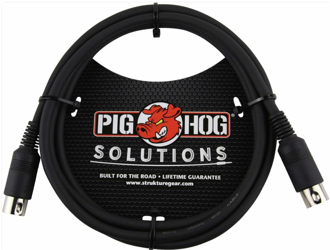
Image: A 6-foot MIDI cable, essential for connecting the keyboard to other MIDI-compatible devices. Assemble the Knox Gear Furniture Style Flip-Top Piano Bench as per its instructions and position it comfortably in front of the keyboard.