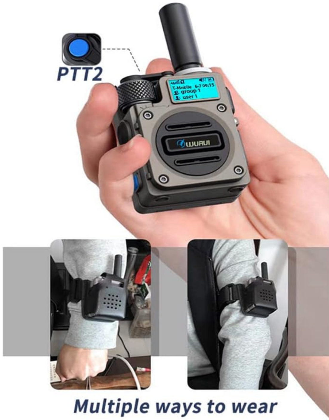
Figure 4: Portable Operation and Wearing Options. This image shows the TXQ G6 being held for communication and various ways to wear it, including on the wrist and attached to a backpack strap.