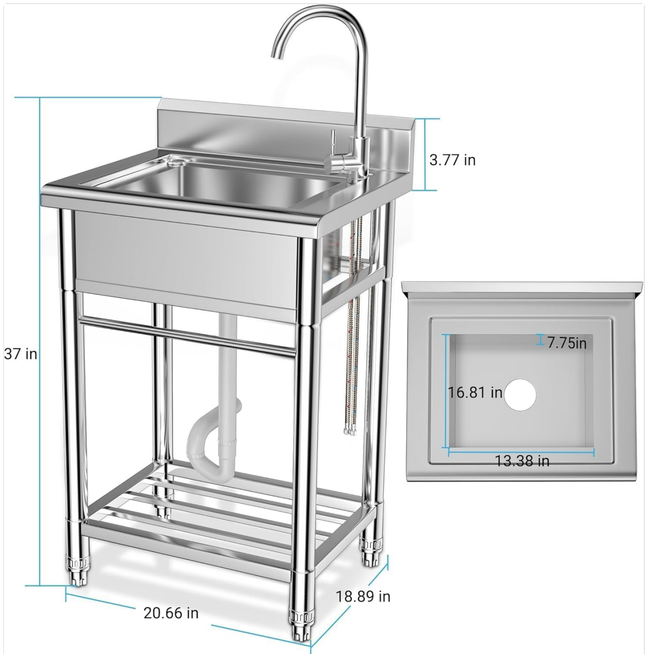
Image: Detailed dimensional drawing of the Lafati utility sink.