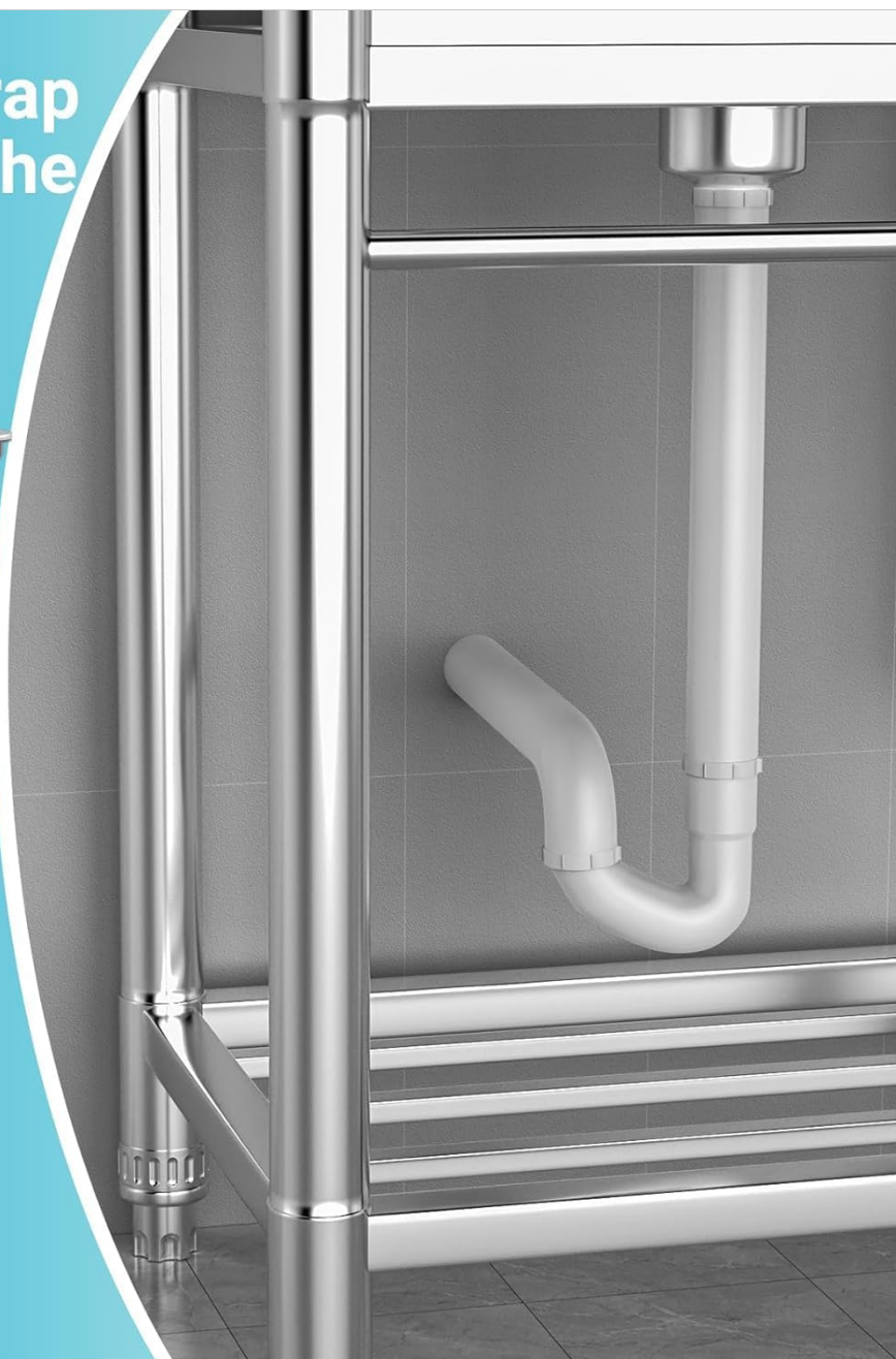
Image: Detailed diagram illustrating the components and assembly of the standard P-trap drainage system.