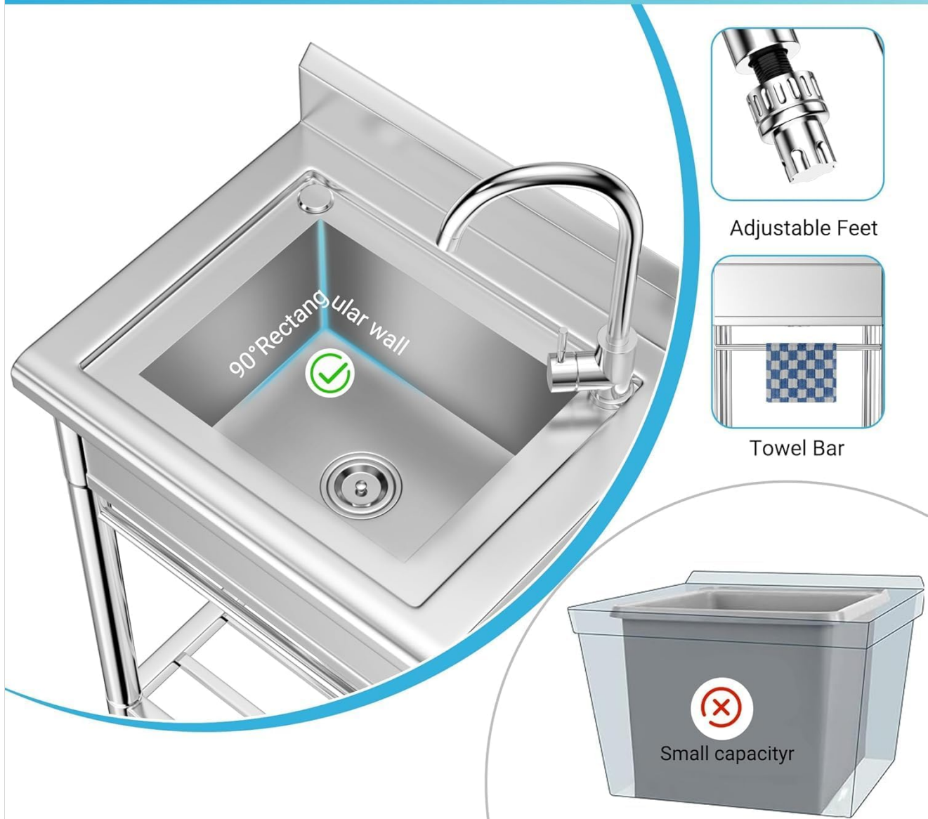
Image: Features of the sink including the 90-degree rectangular bowl, adjustable feet for leveling, and a convenient towel bar.