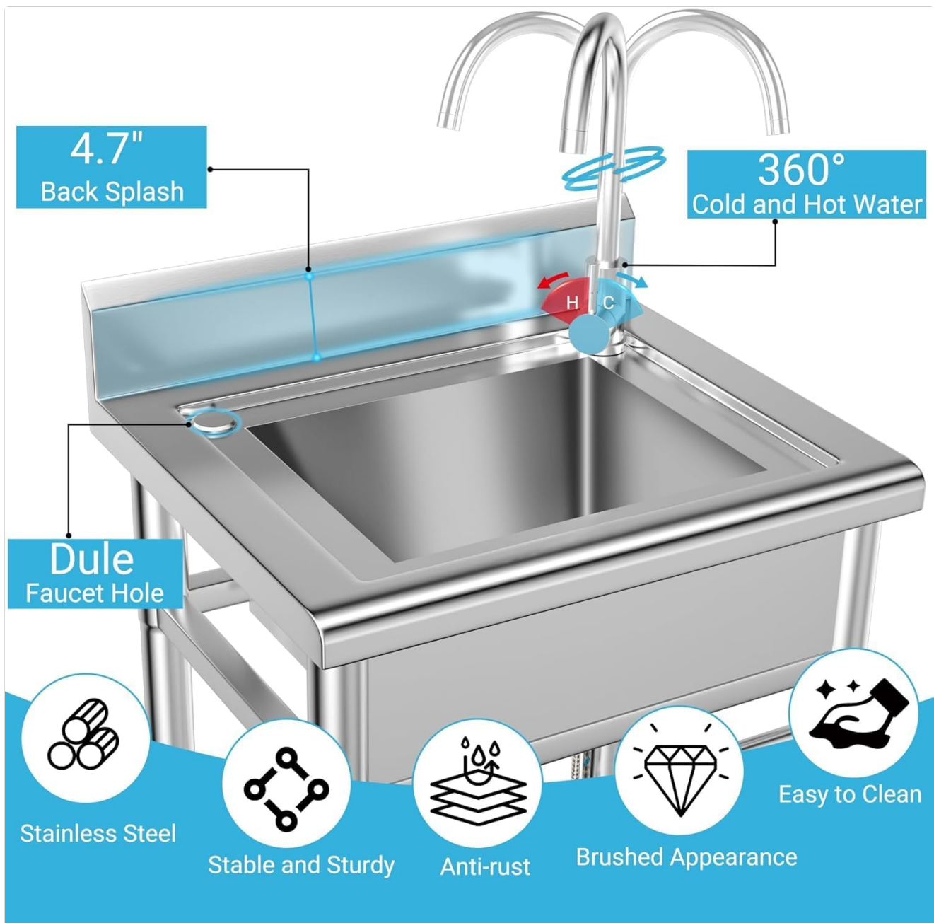
Image: Overview of the sink's features, including the 4.7-inch backsplash and 360-degree swivel faucet for hot and cold water.