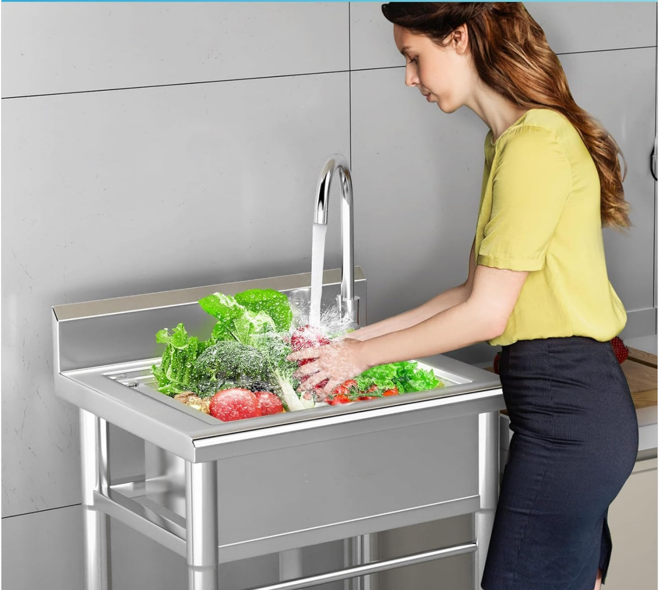
Image: A person demonstrating the use of the stainless steel utility sink for washing vegetables.