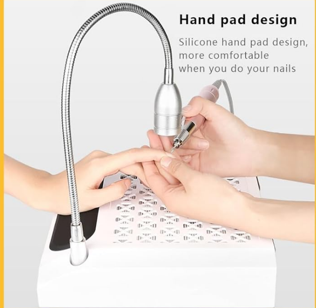
Figure 1: Key features of the 4-in-1 Manicure Machine, including the powerful motor, dust filter, adjustable LED light, and hand pad.

Silicone hand pad design, more comfortable when you do your nails