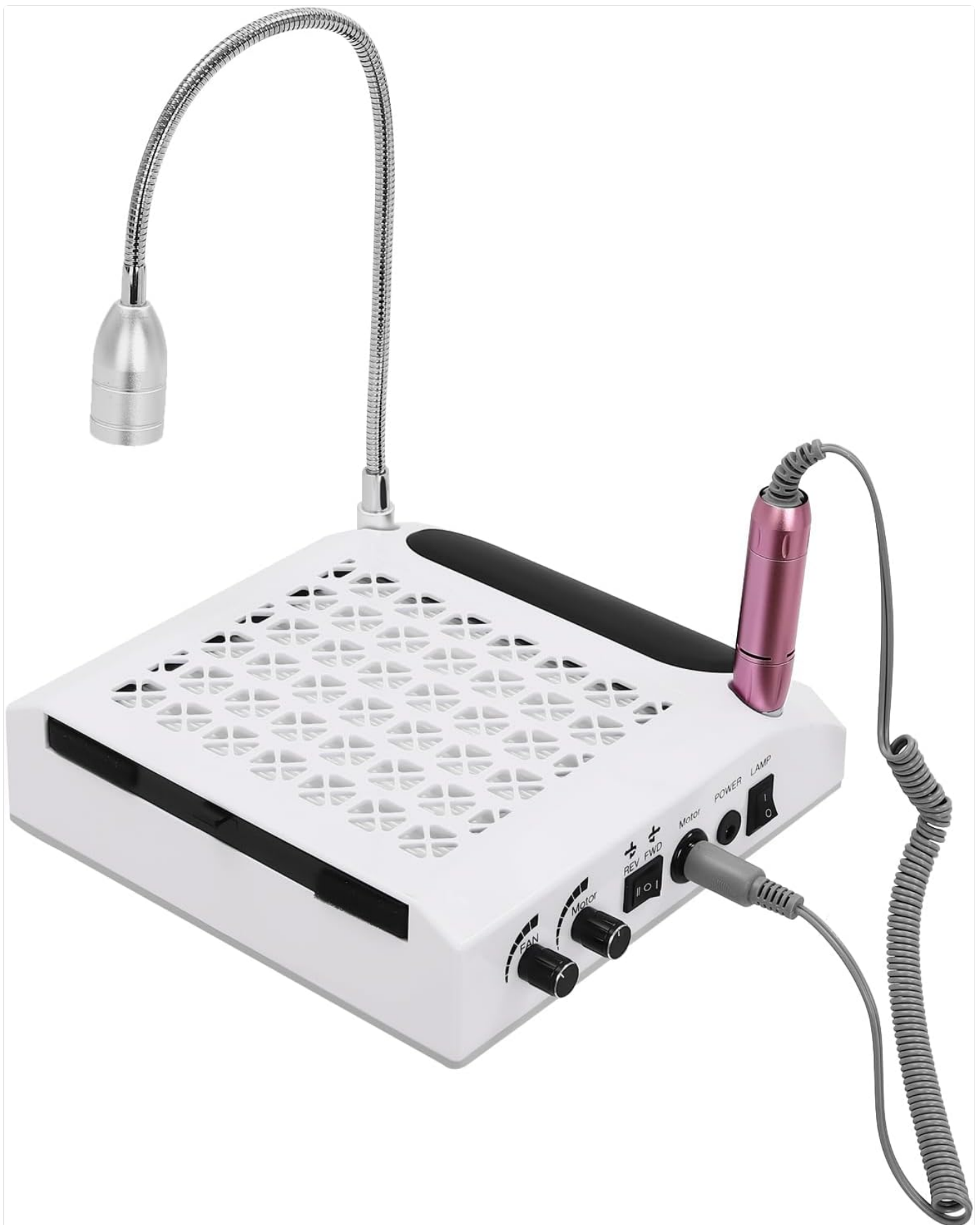
Figure 4: Assembled 4-in-1 Manicure Machine.