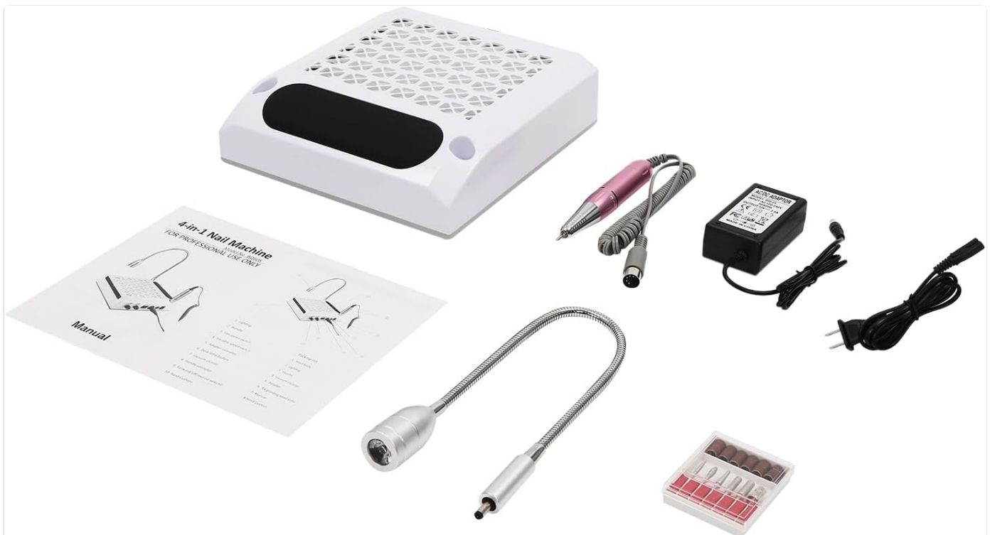
Figure 3: Contents included in the product package.