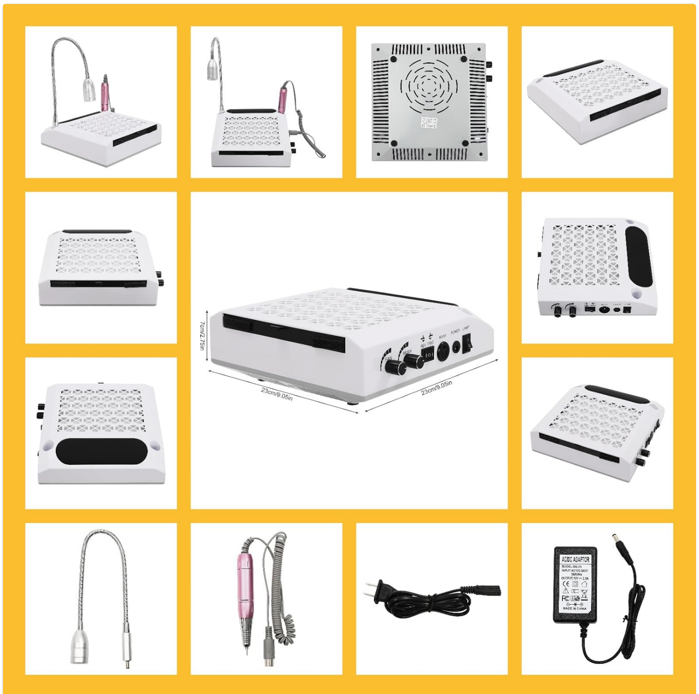
Figure 7: Various views and dimensions of the product.