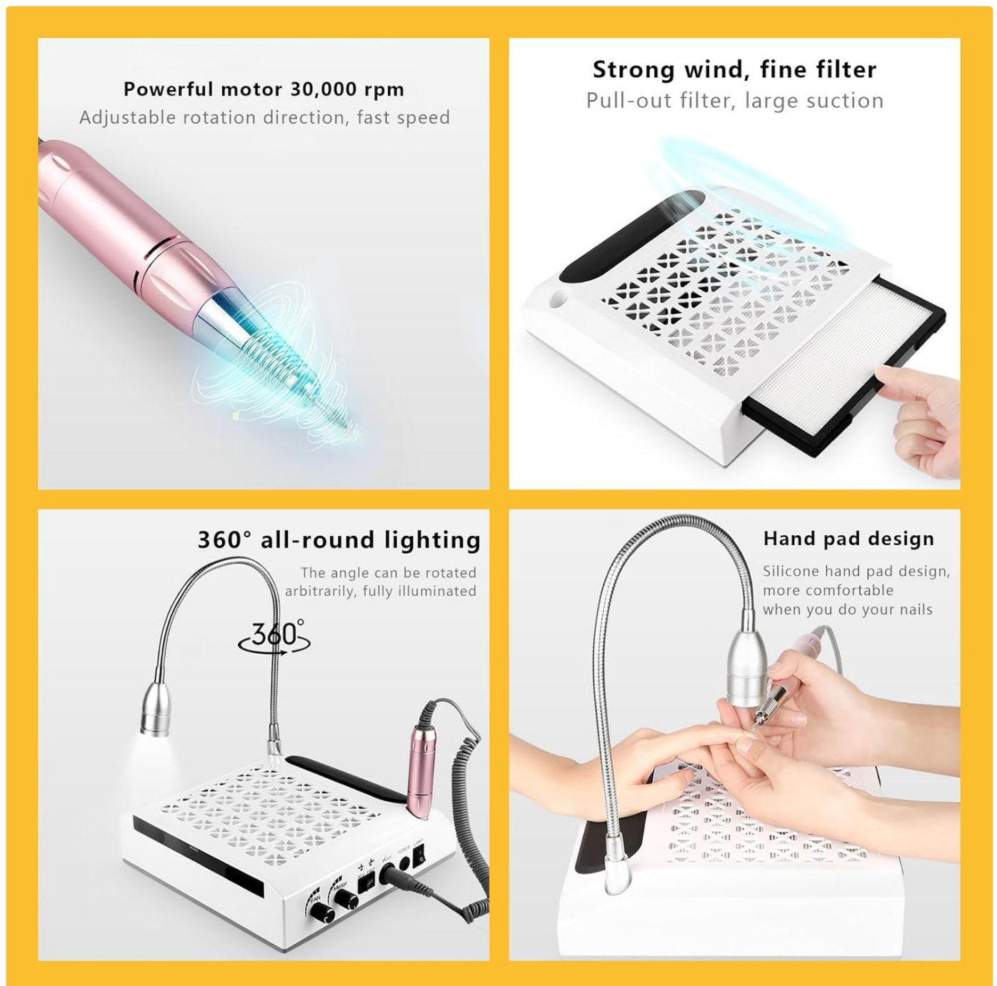
Figure 6: The pull-out filter for easy maintenance.