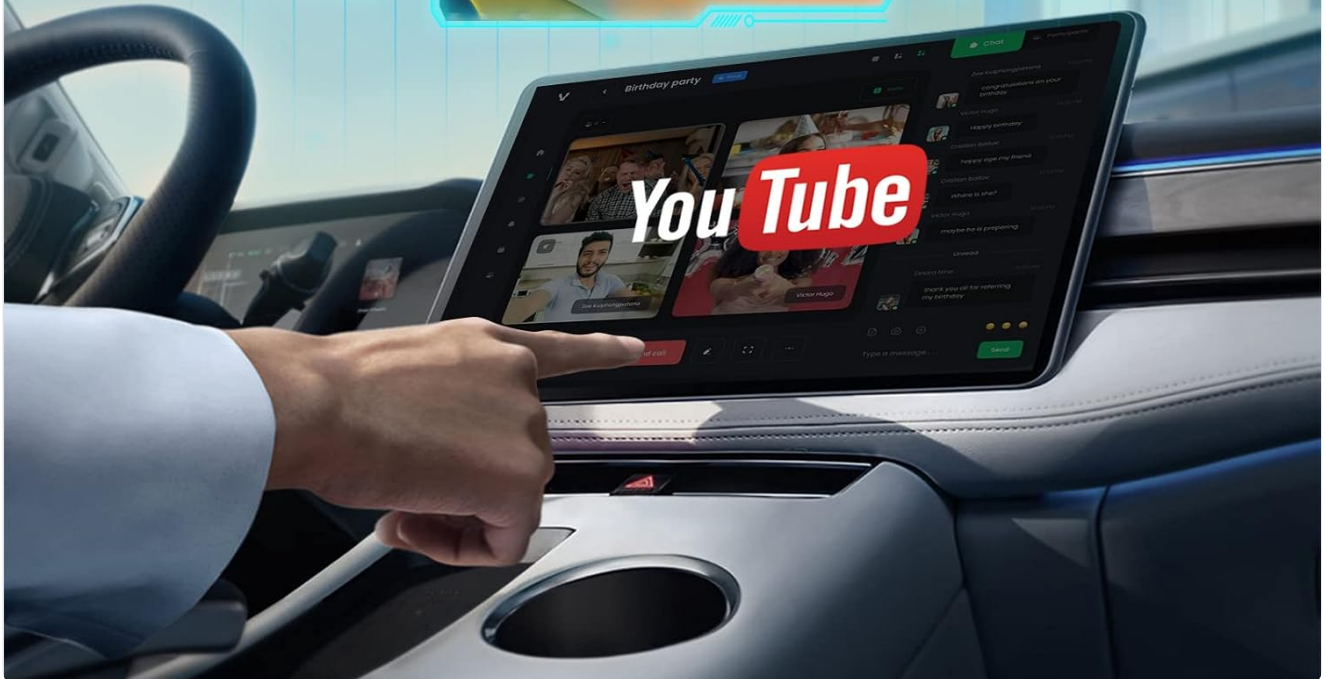
Illustration showing the three main systems supported by the device: Android Auto, Wireless CarPlay, and the Android 11 System, offering diverse functionalities.