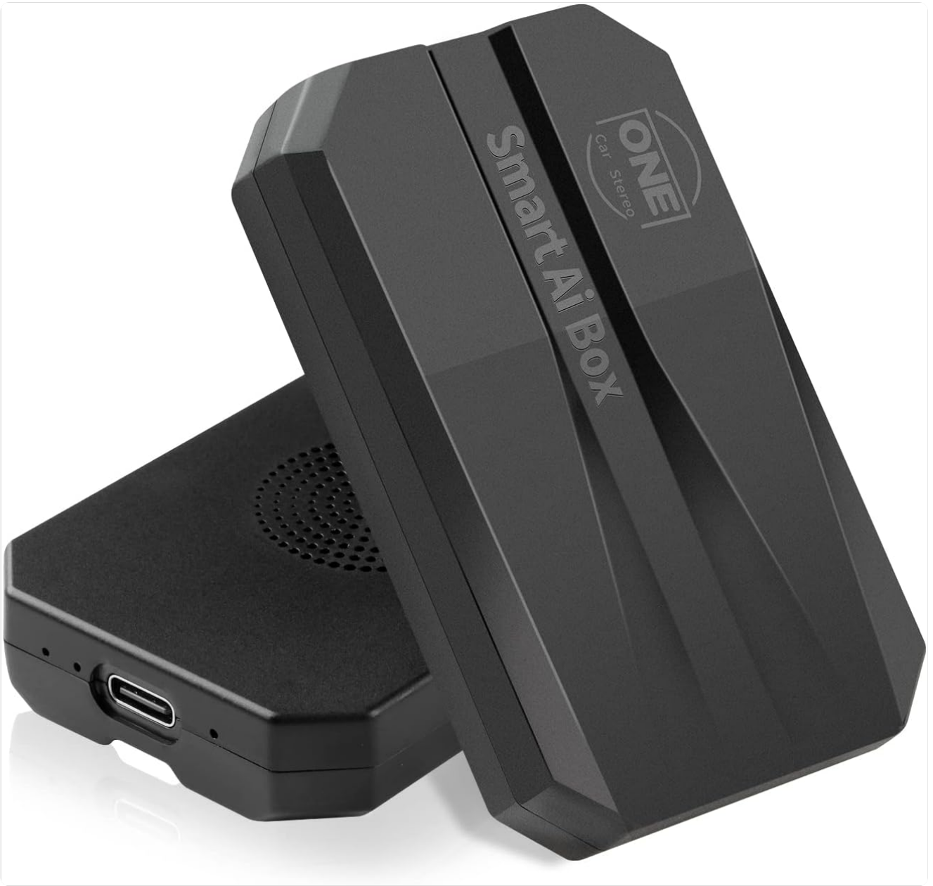
The OneCarStereo Smart AI Box Elite, a compact device designed to enhance your car's multimedia capabilities.