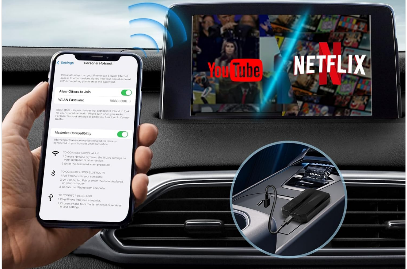
Demonstration of simultaneous Wi-Fi and wireless connectivity, allowing streaming media to the car screen while maintaining phone functions.