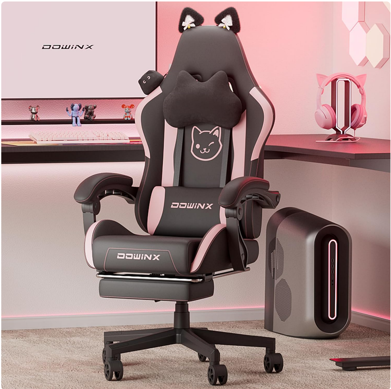
Figure 1: Dowinx Gaming Chair (Black and Pink)

This image displays the overall design of the Dowinx Gaming Chair in black and pink, highlighting its ergonomic shape and unique cat-themed elements.