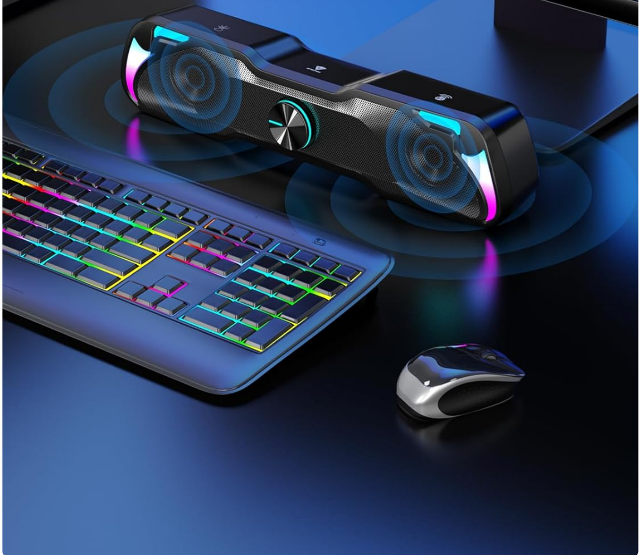
Image: The SPKPAL S135 soundbar positioned on a desk, demonstrating its compact size suitable for desktop setups, alongside a keyboard and mouse.