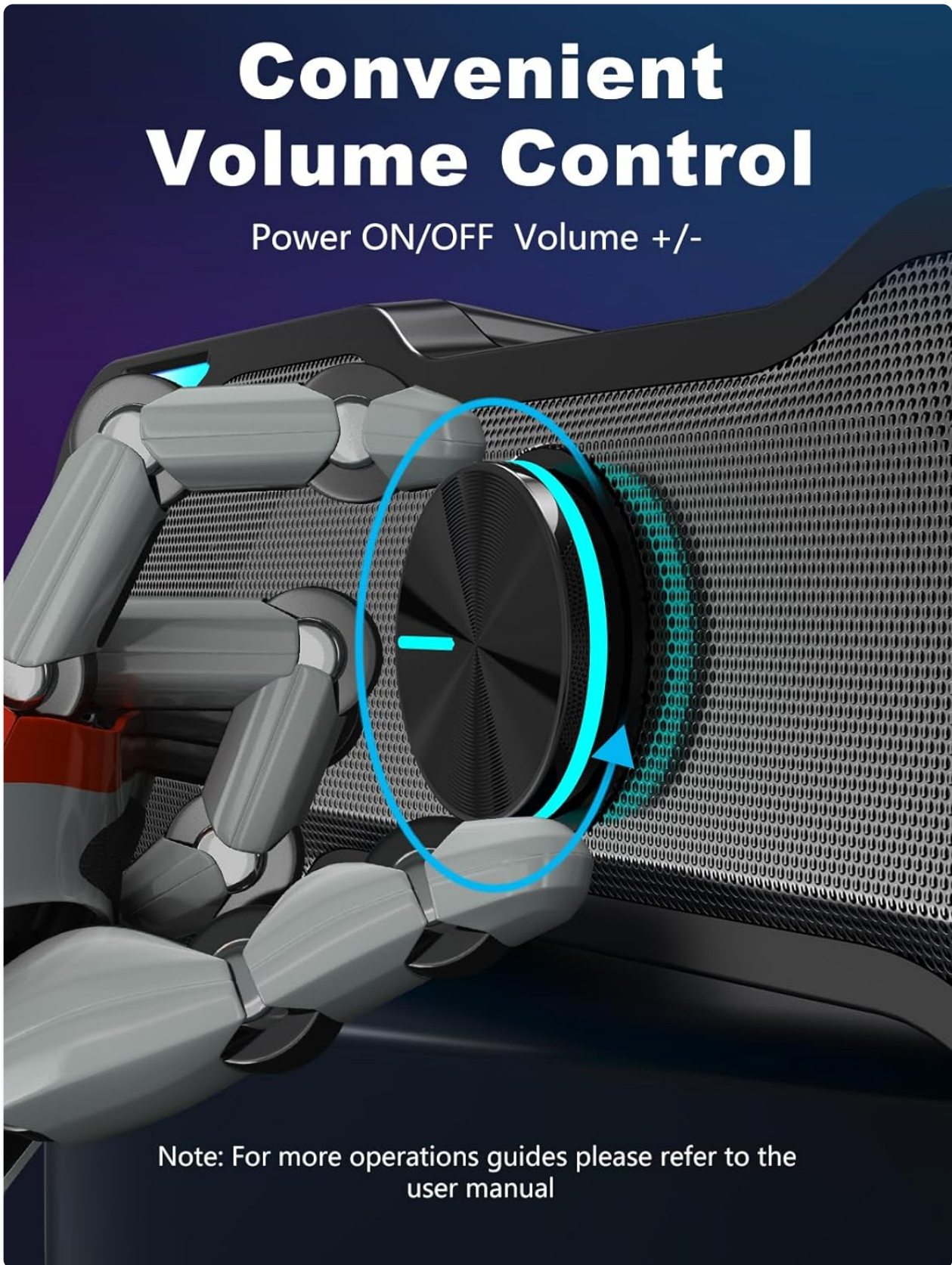
Image: A detailed view of the soundbar's central rotary knob, illustrating its use for convenient power control and volume adjustment.