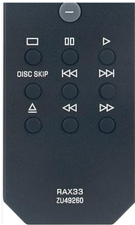
Image 1: Layout of the AULCMEET RAX33 Remote Control. This image displays the full remote control with all its buttons and labels, including power, input selectors, tuning, volume, and playback controls.