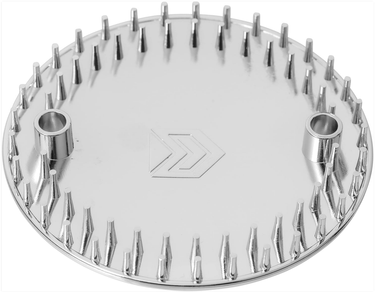
Image: Close-up of the cover being placed into the drain opening.