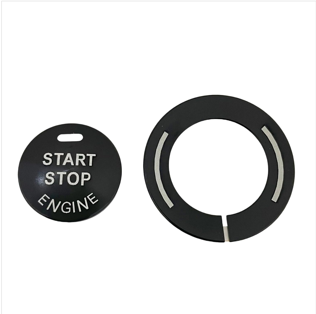
Image: The button cover and outer ring protector, shown separately, ready for installation.