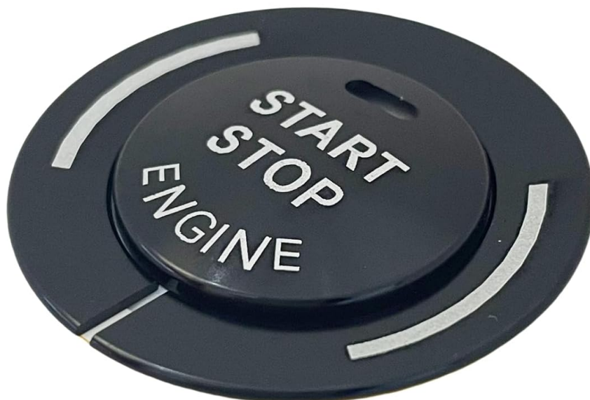
Image: The ALETAI Engine Push Start Stop Button Cover fully assembled, demonstrating its appearance after installation.