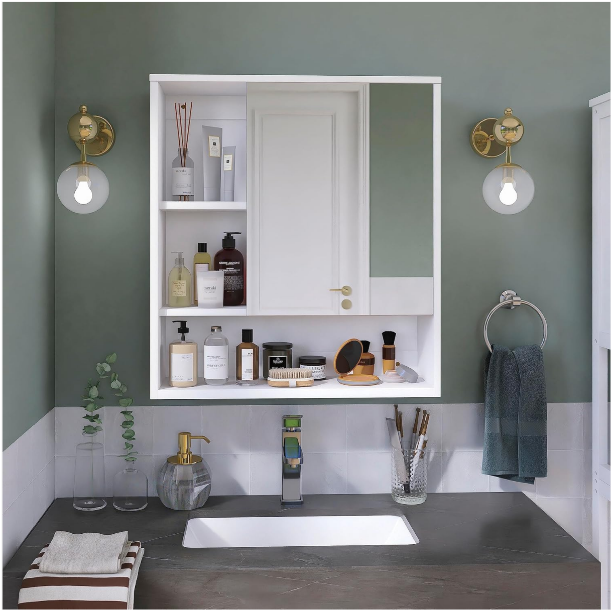
Image: The SMIBUY Bathroom Mirror Cabinet in a bathroom setting, showcasing its design and functionality above a sink.