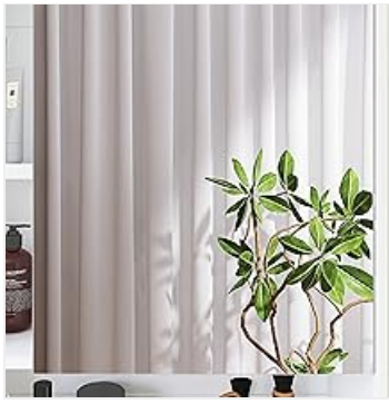
Image: A detailed view of the high-definition mirror, highlighting its clarity.