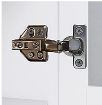
Image: Detail of the premium soft-closing metal hinges used for the mirror door.