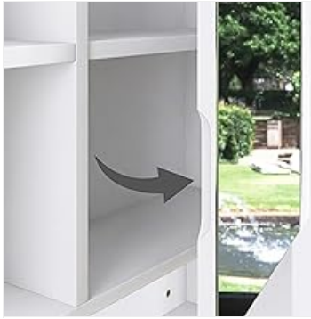
Image: A close-up of the built-in hidden notched door handle, designed for a minimalist look and easy access.