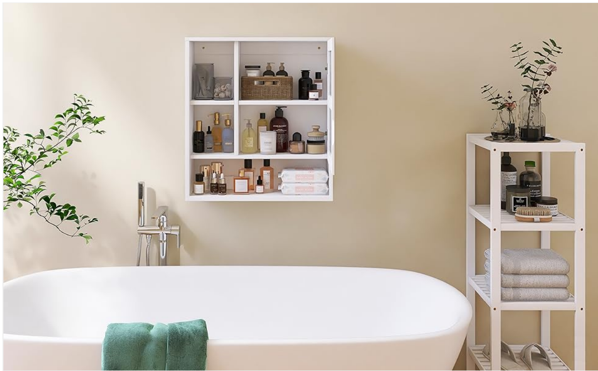
Image: The SMIBUY Bathroom Mirror Cabinet securely mounted on a wall, demonstrating its space-saving design.