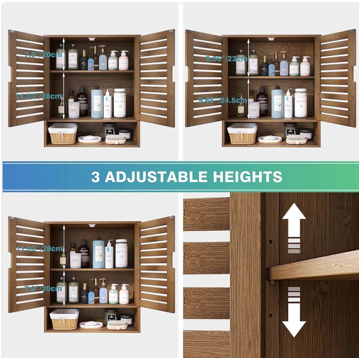
Figure 5: Adjustable shelf heights