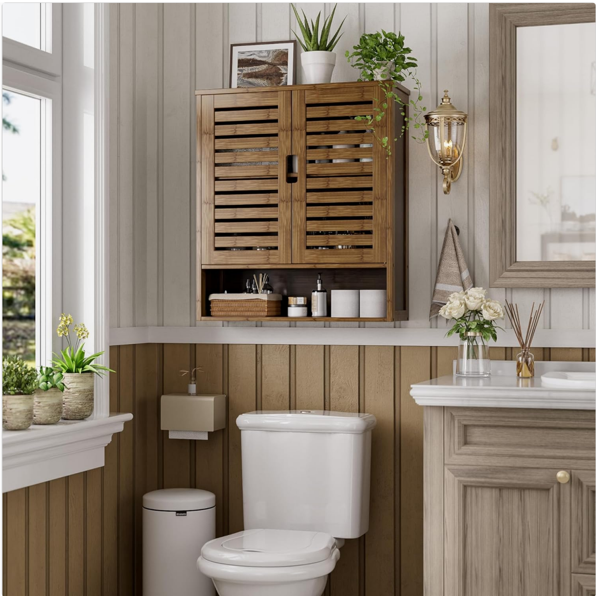
Figure 4: Cabinet installed in a bathroom