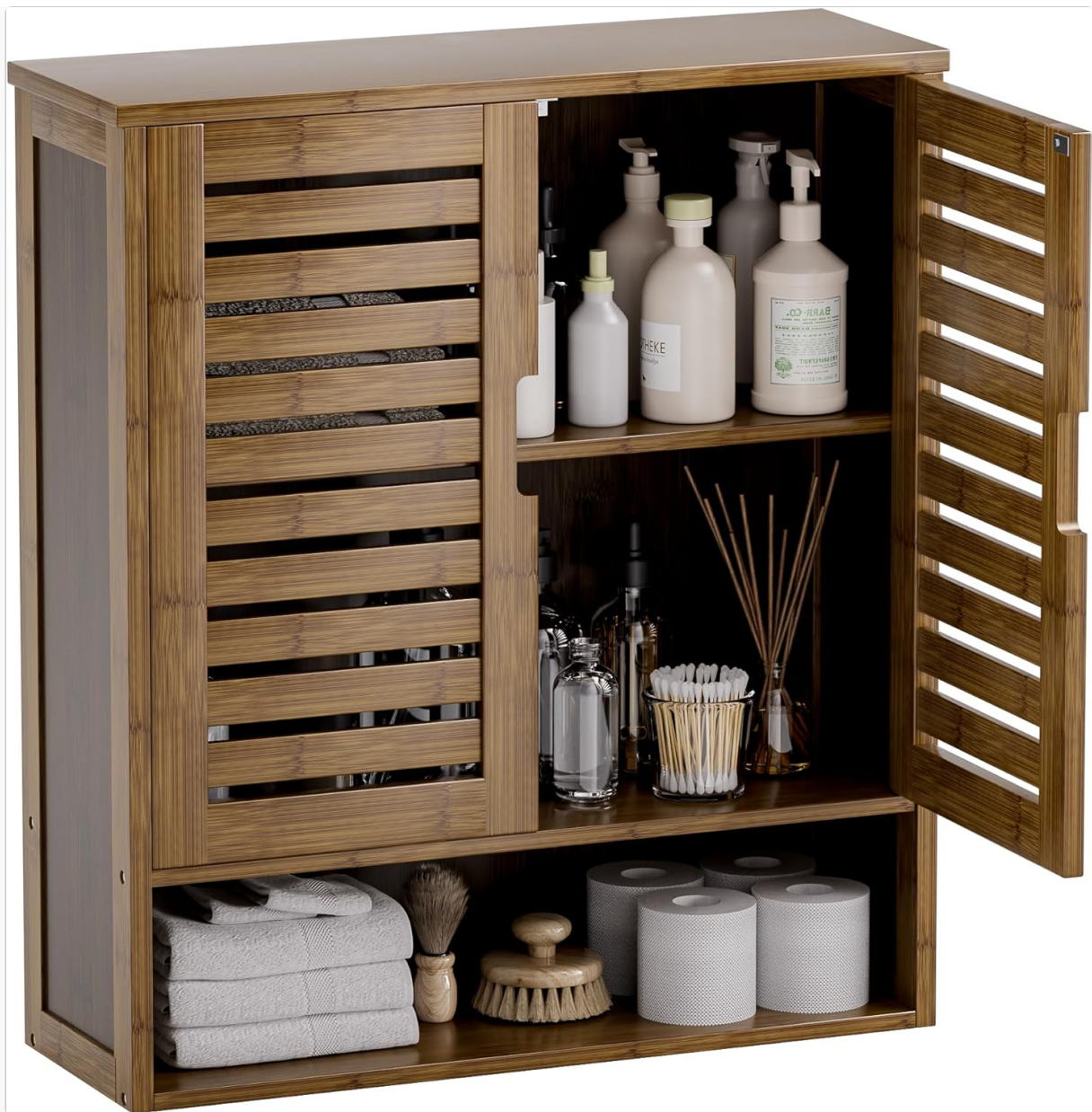
Figure 1: SMIBUY SBBWC-WL001 Wall Mounted Bamboo Bathroom Cabinet (Walnut)