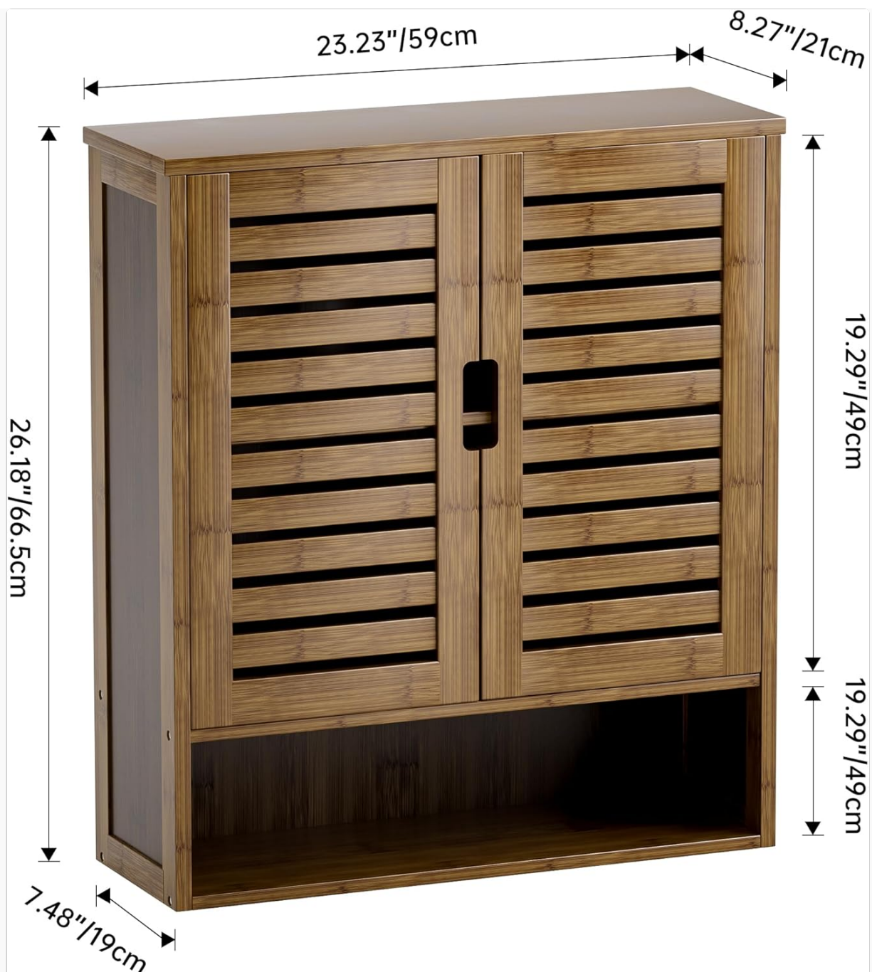
Figure 7: Product Dimensions