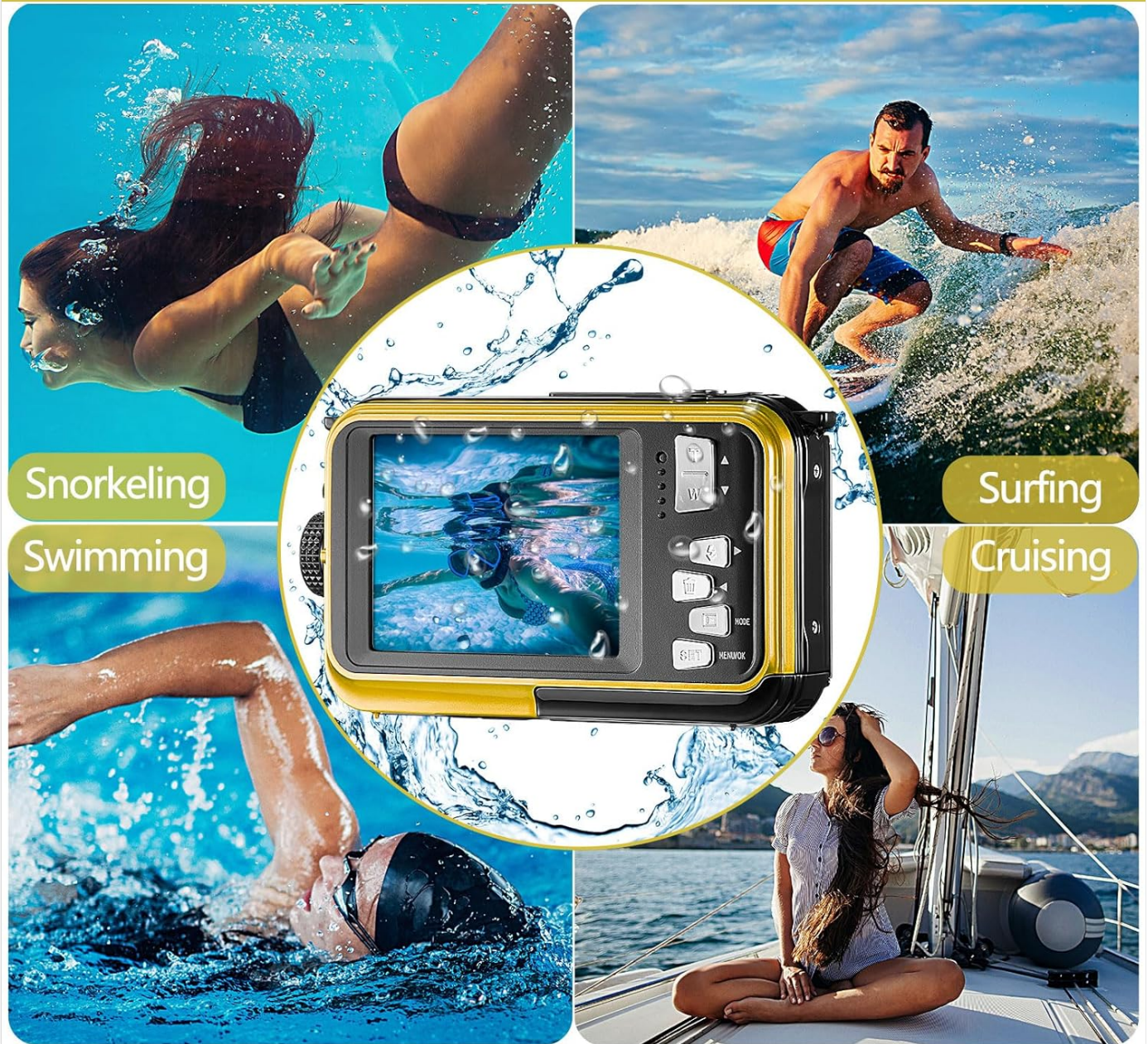
Figure 5: Camera in various water activities