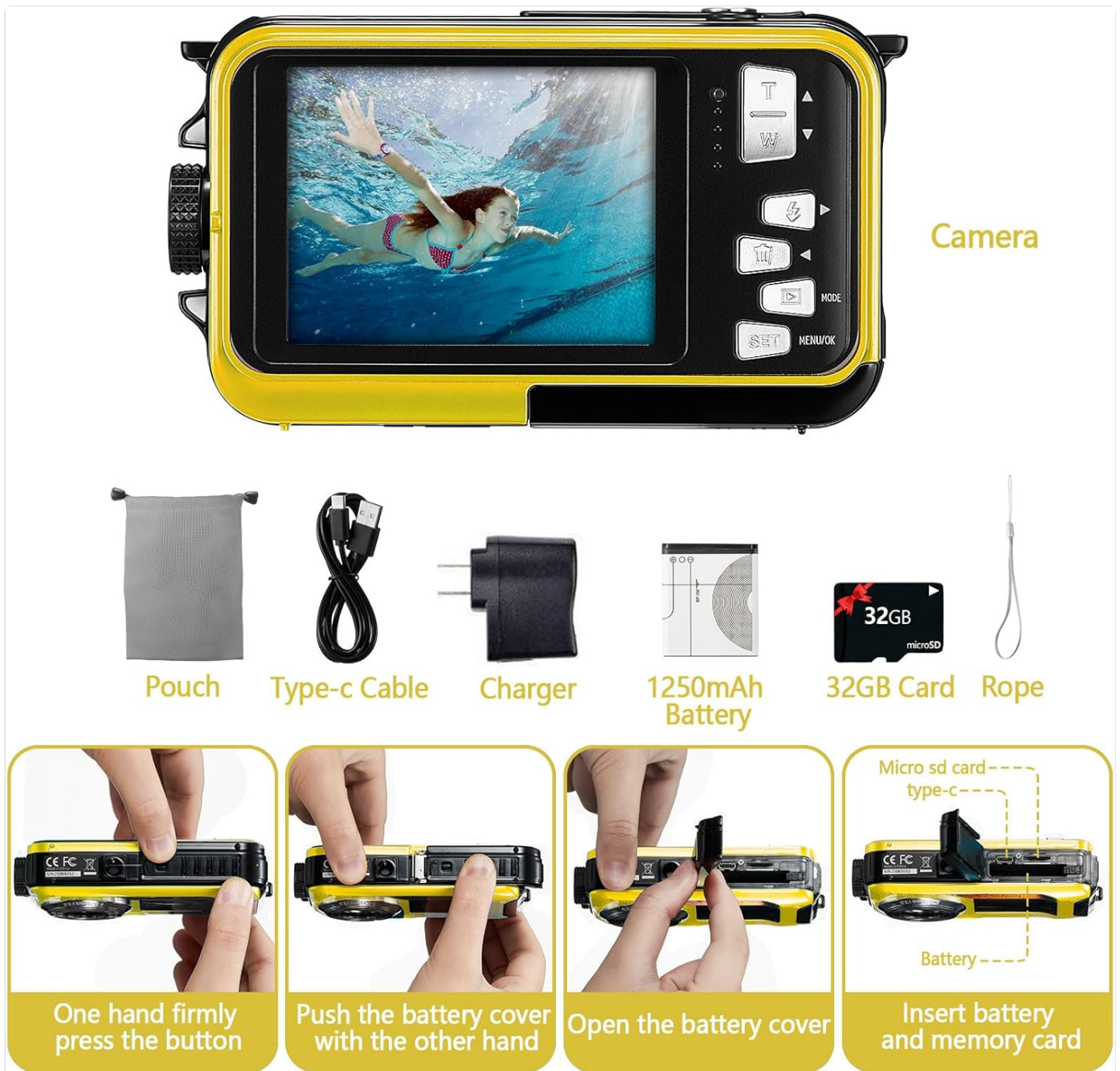
Figure 2: Package Contents