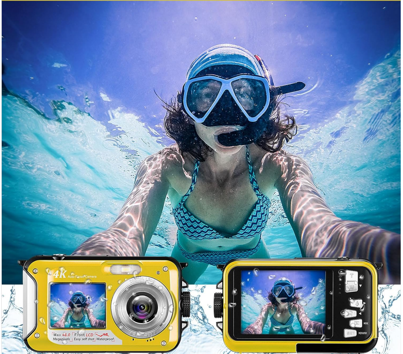
Figure 1: YISENCE 806 4K Waterproof Digital Camera