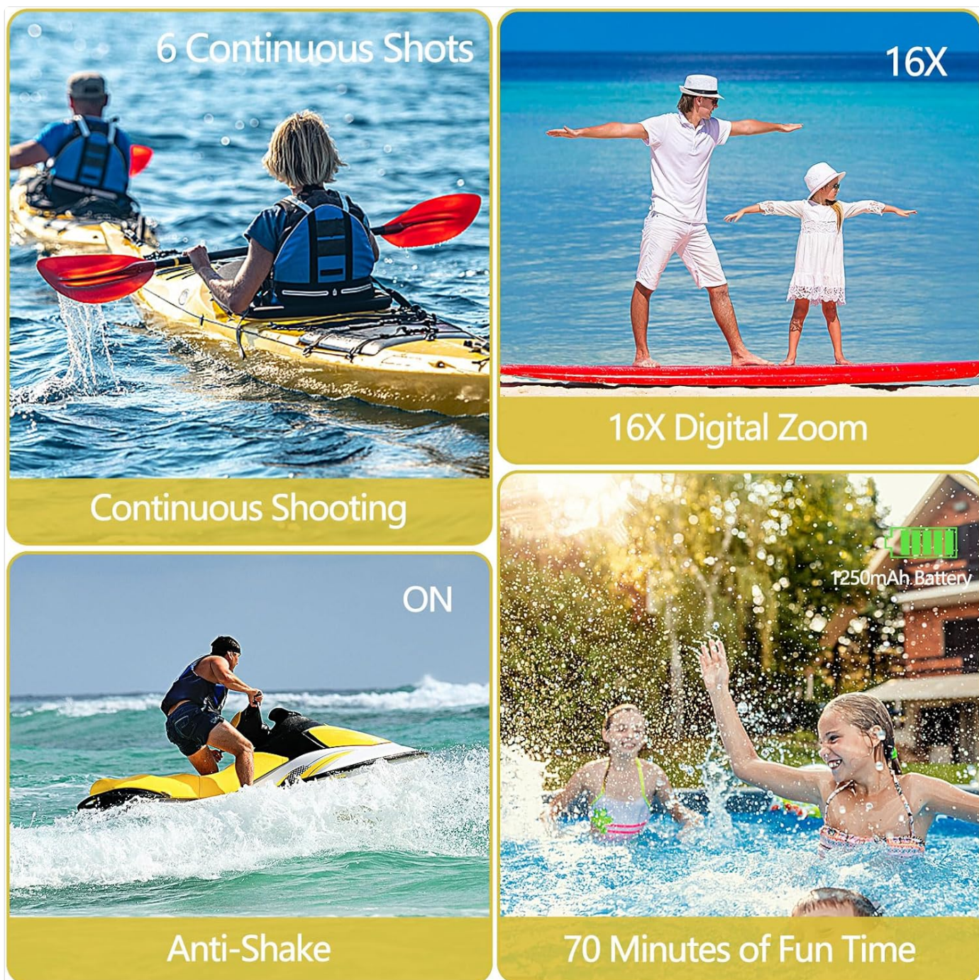
Figure 4: Continuous Shooting, Digital Zoom, and Battery Life