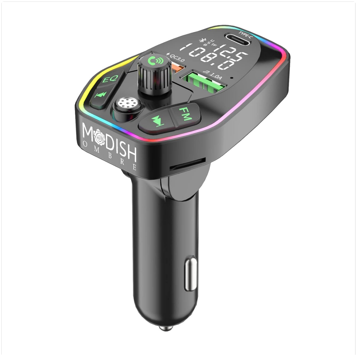
Image: ModishOmbre UNMO18 Car Charger FM Transmitter, showing its compact design and LED display.