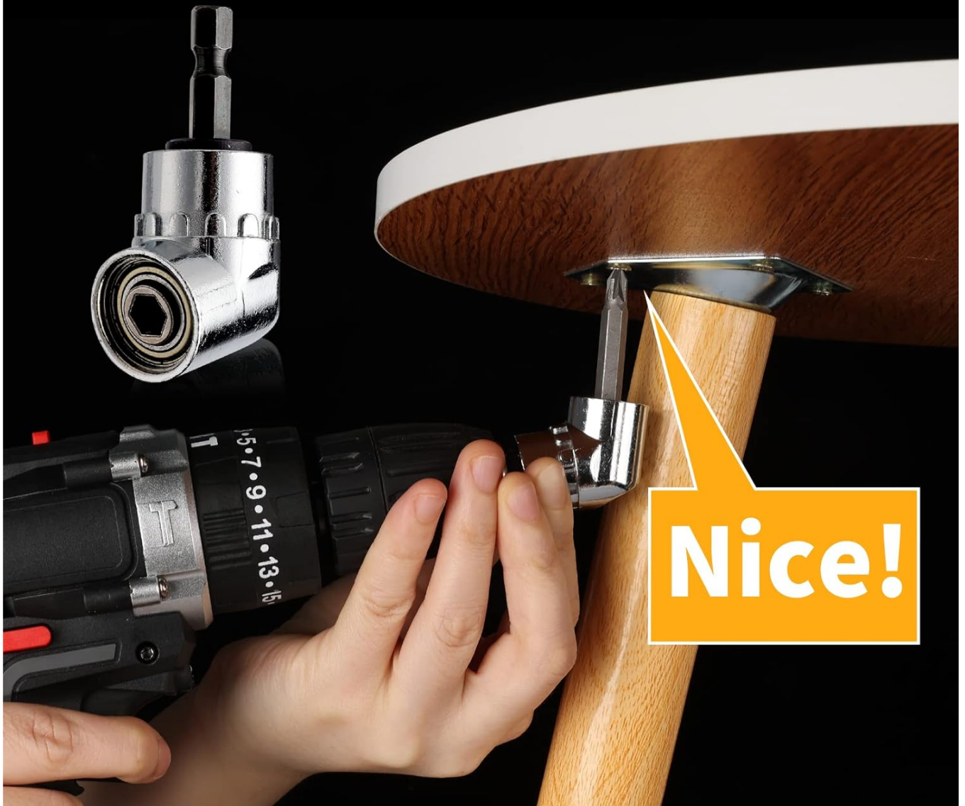
Figure 2: The 105-degree Right Angle Drill Attachment being used with a drill to access a screw in a tight corner, demonstrating its utility for hard-to-reach spaces.