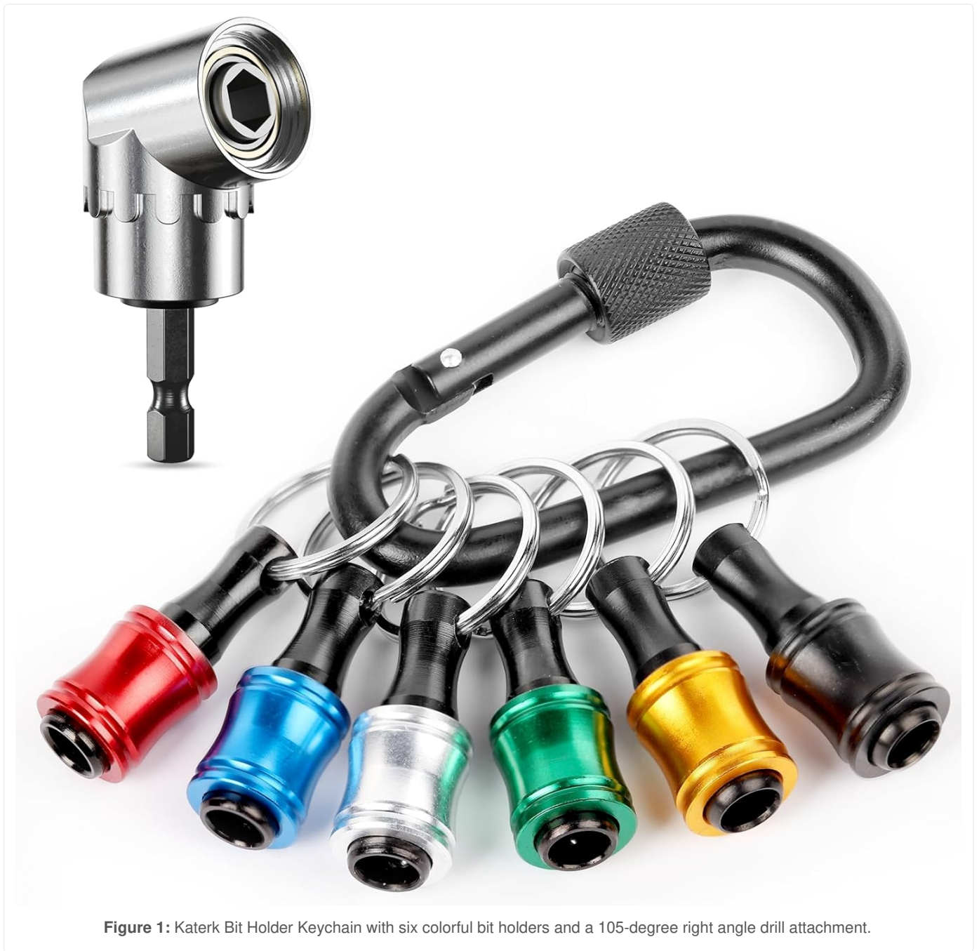
Figure 1: Katerk Bit Holder Keychain with six colorful bit holders and a 105-degree right angle drill attachment.